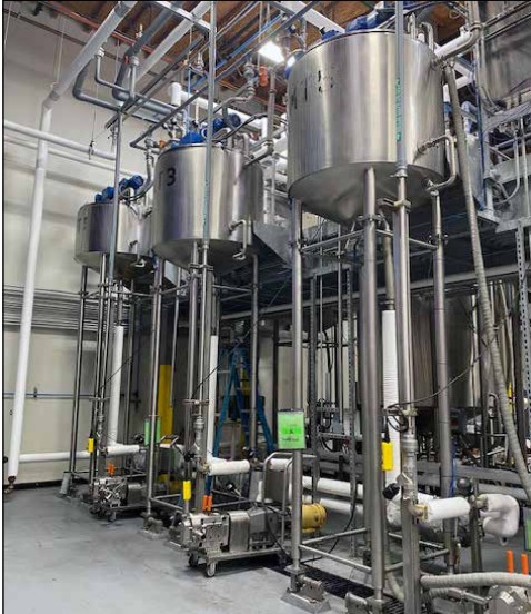
View of 250-700 Gal. SS 316L Tanks