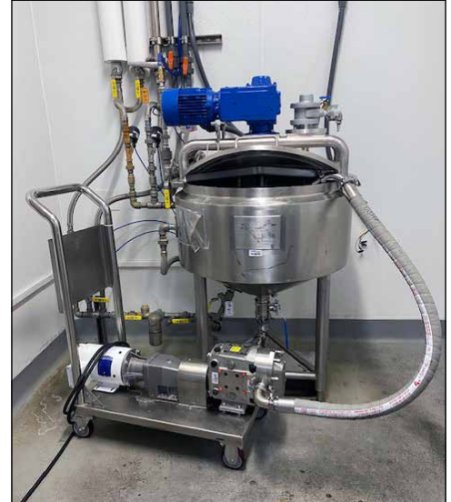
SS Tank w/Pump