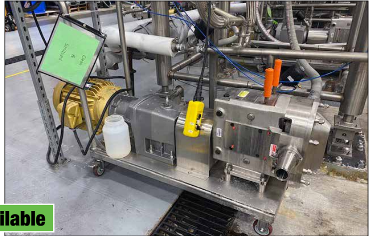
Views of Positive Displacement Pumps