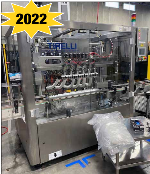
Tirelli 10-Head Filler