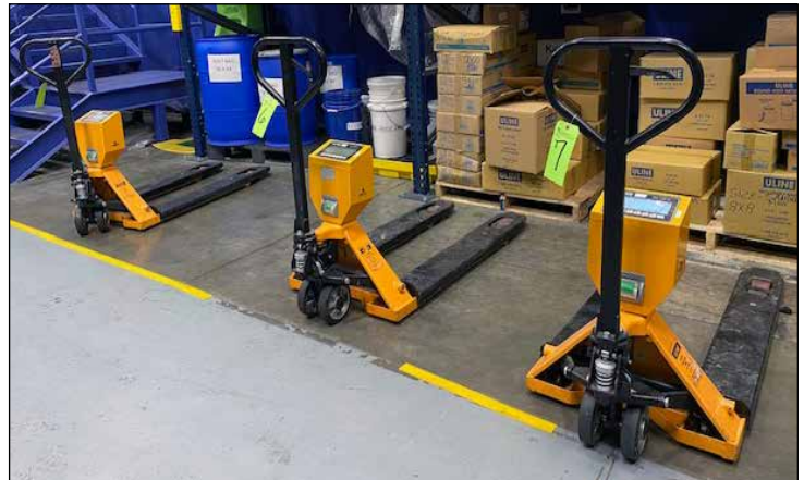
U-Line 5,000lb. Pallet Trucks w/Printers

(3) U-Line 4-Step Portable Ladders Just Rite Acid & Corrosive Storage Cabinet (5) Hoover Ferguson SS Totes Advance SC6000 EcoFlex Floor Scrubbers, S/N 3510204500250 (4) U-Line 5,000lb. Mod. H-4564 Pallet Truck Scales, w/Printers (2) U-Line H-3685 Flammable Liquid Storage Cabinets U-Line Mod. H-8462, 4,000lb. Hyd. Floor Crane Morse Mod. 400A-72, 800lb. Drum Lift, S/N 1221-001 Big Joe WPT-45-S Electric Pallet Jack Vestil 550lb. Mod. DRUMLFT-DCR, Drum Lift, w/62" Lift Height, S/N 210490 (5) Hyd. Pallet Jacks Huskey Twin-Stage Vertical Air Compressor (3) Defender Digital Scales (2) Clean Air Products Mod. AP-577F, Portable Clean Rooms 2024 Tirelli Mod. C1P10, Washing Machine, S/N M05413 Phoenix Mod. PLP Pallet Wrapper, S/N 22056498