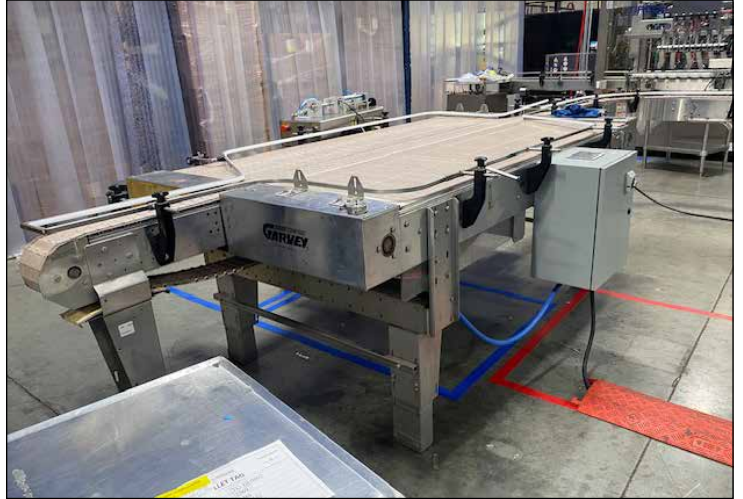
Garvey BiFlo Accumulation Table