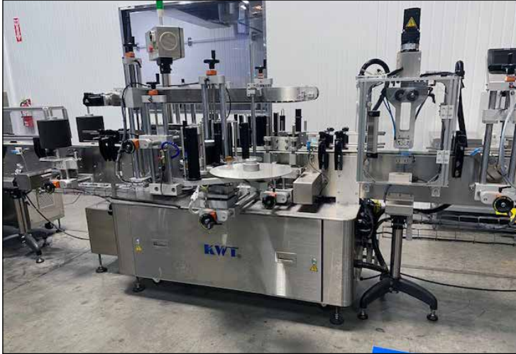
KWL Labeler, Conveyor