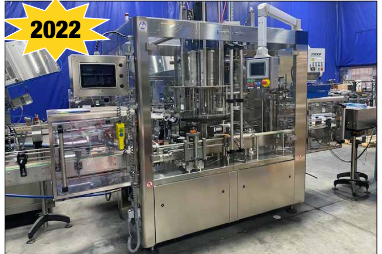
Tirelli Auto Capper/Pump Placer