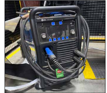
Miller Millermatic 255 Welder