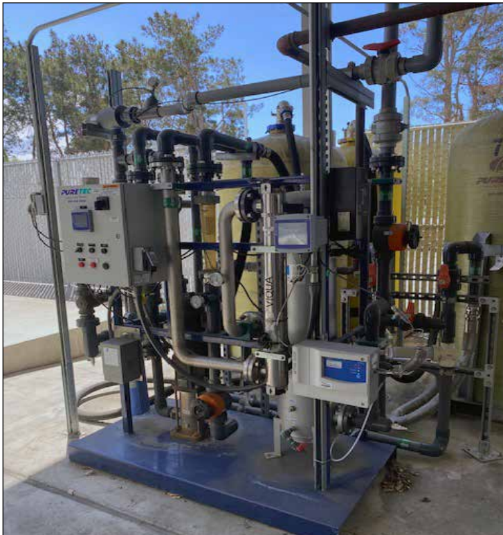
Pure Tec Water System w/Mettler Toledo Scale

Pure Tec Water System, w/Mettler Toledo M800 Digital Scale, Pumps