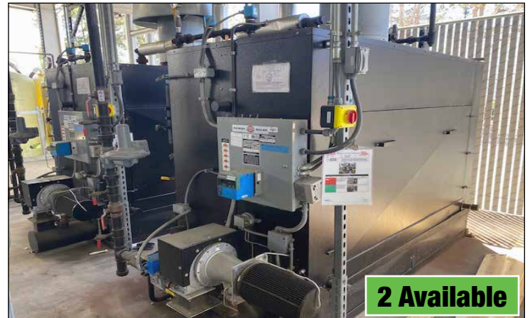
View of Parker Boilers

(2) Parker Boiler Mod. 48L, 48HP Steam Boilers, Natural Gas, S/N 96840P