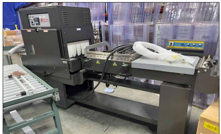
Packaging Tunnel w/Conveyor

2022 Lewco Mod. NS-EL8TV, Hot Box, S/N S28120-001-01