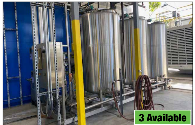
Tank Free CIP Systems

(3) Tank Free Standing CIP Systems, w/(20) Invertek VF Drives, Anderson-Negele AS-300 Reader, Pump