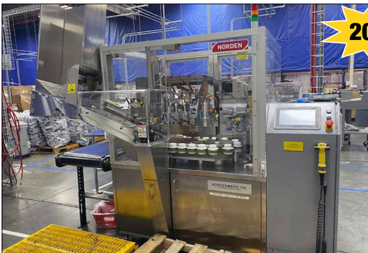
Views of Norden Tube Fillers