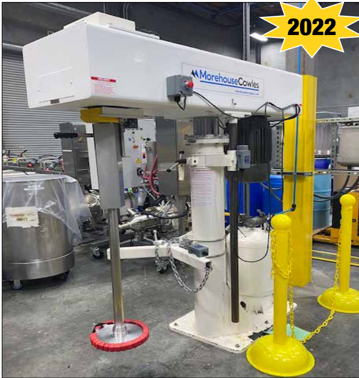
Morehouse Cowles High Shear Production Mixer

2021 Fryma Koruma Type 8L-TC-D, Toothed Colloid Mill, SS 316L, S/N 2119/50 Fryma Koruma 104010 MZ-150, Toothed Colloid Mill, SS 316L, S/N 104010 2022 Morehouse Cowles Mod. V-24-20X Mill, S/N 491914