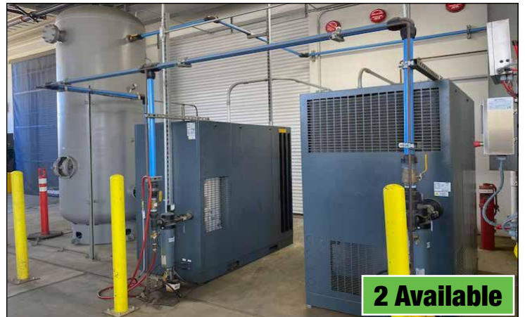
Atlas Copco Air Compressors

2021 Atlas Copco GA45+FF, Rotary Screw Air Compressor, S/N AP1442761 2021 Atlas Copco Type GA45VSD+FF, Rotary Screw Air Compressor, S/N AP1871095 Receiving Tank