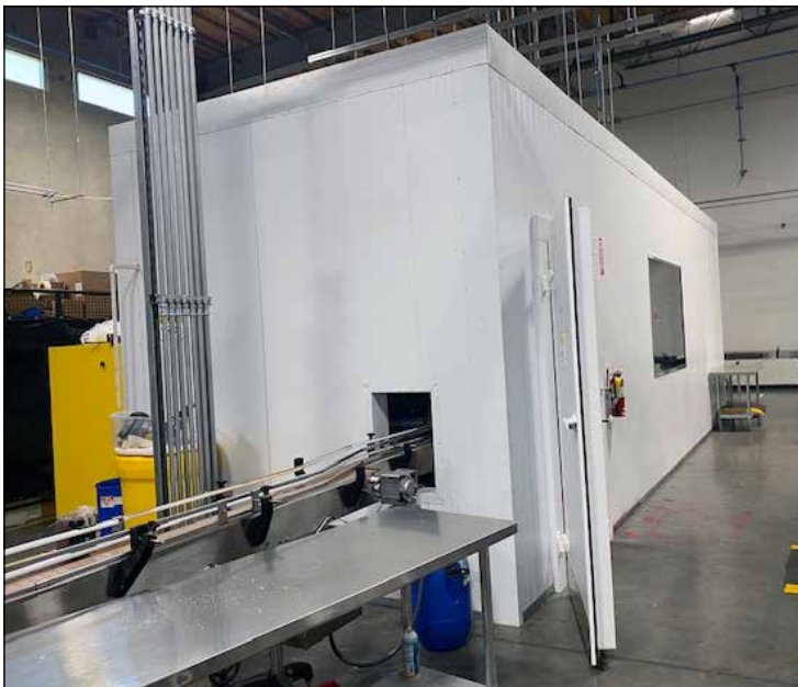
Free Standing Single Door Cold Room

Approximately (250) Sections of (LIKE NEW) Pallet Racking