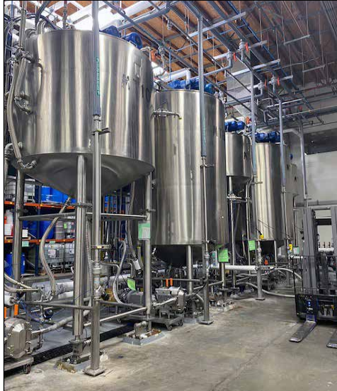
View of 1,700-3,000 Gal. SS 316L Tanks