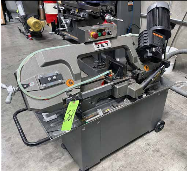
Jet Horizontal Band Saw

Jet JTM-2, 9x42 Step Pulley Vertical Milling Machine, w/PF Table, S/N 2B09943 Jet MBS-814GM, 8x14 Horizontal Geared Head Band Saw, S/N 24027140 Dake Hydraulic H-Frame Press