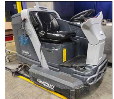
Advance EcoFlex Floor Scrubbers