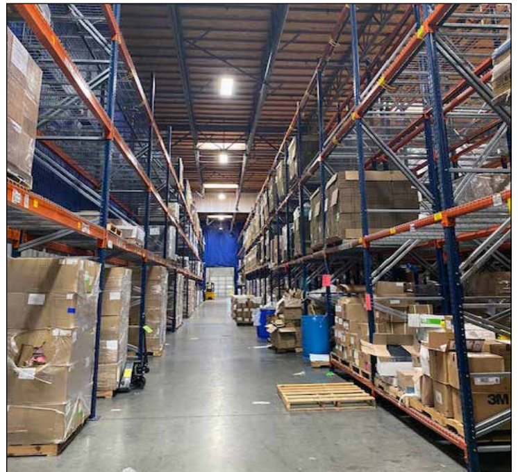
Approximately 30'T Pallet Racking

Just Rite Super Lock Chemical Storage Room