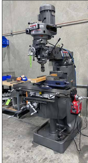
Jet Vertical Milling Machine

Miller Millermatic 255 Welder • Ryobi BG612G, 6" Dbl. End Bench Grinder Central Machinery Floor Type Drill Press Tool Boxes and Cabinets