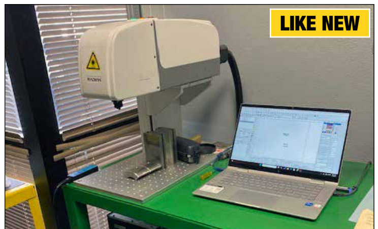
Radian Laser System

Radian Laser Systems, 80cm • Granite Surface Plate • Gauges, Mics, etc.