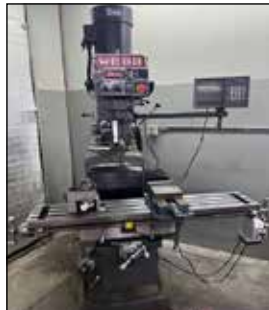
Webb Vertical Mill