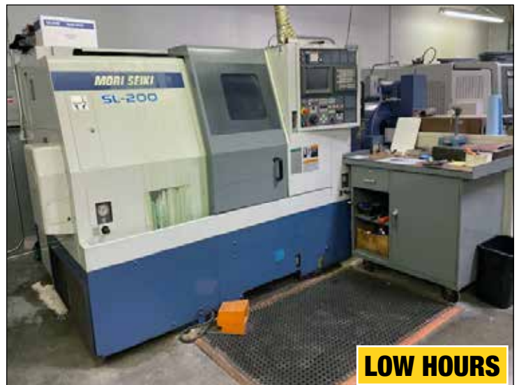
Mori Seiki SL-200 CNC Turning Center