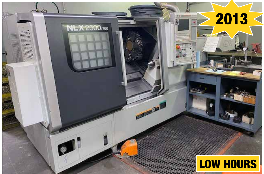
DMG Mori Seiki Mod. NLX2500/700 CNC Turning Center

For An Auction Calendar Visit Our Website: tauberaronsinc.com 323.851.2008 888.648.2249