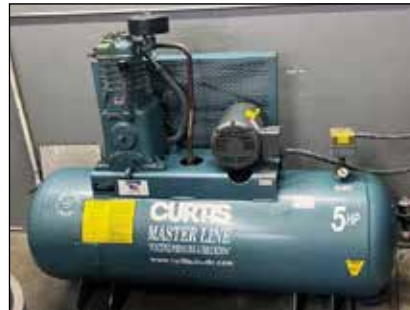
Curtis 5 HP Tank Mounted Air Compressor