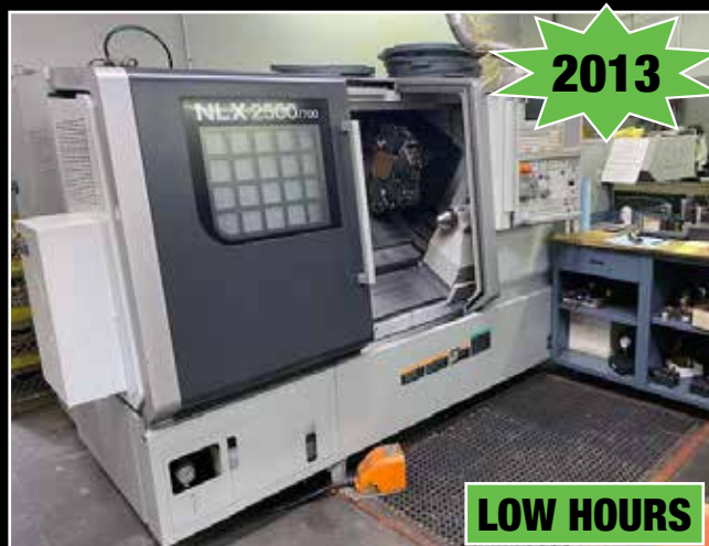
DMG Mori Seiki Mod. NLX2500/700 CNC Turning Center