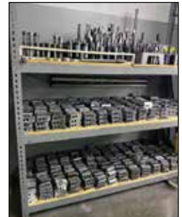
Partial View of Tooling