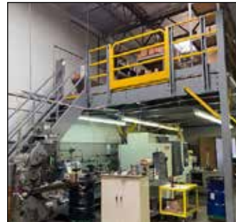
View of Mezzanine