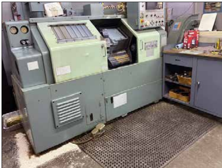
Mori Seiki AL-2BTM CNC Turning Center