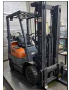
Toyota 4,000lb. LPG Forklift