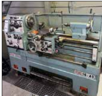
AcraTurn 16x40 Engine Lathe