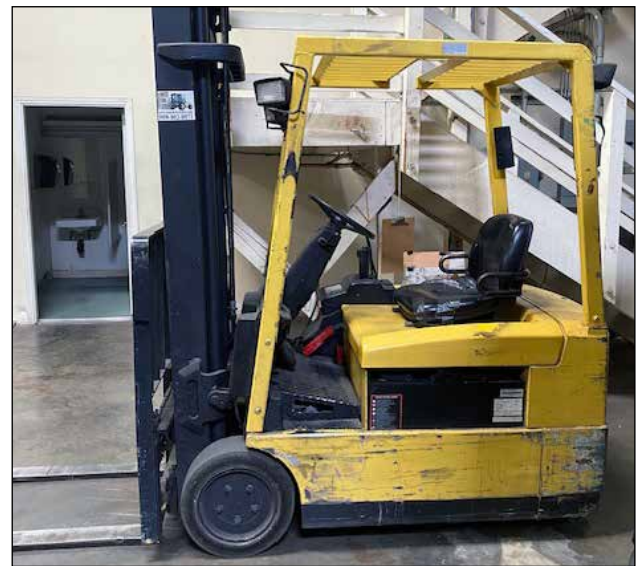
Yale Electric Forklift