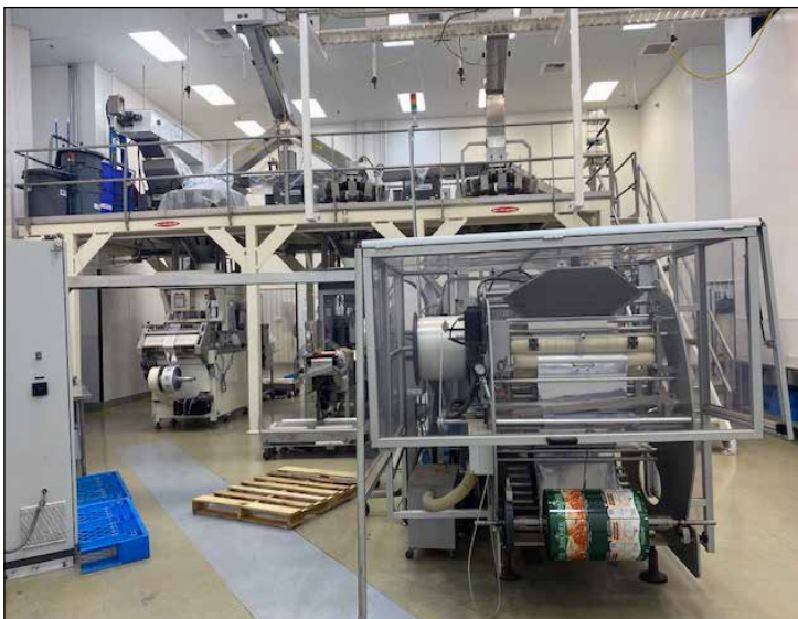
Overall View of Packaging Room