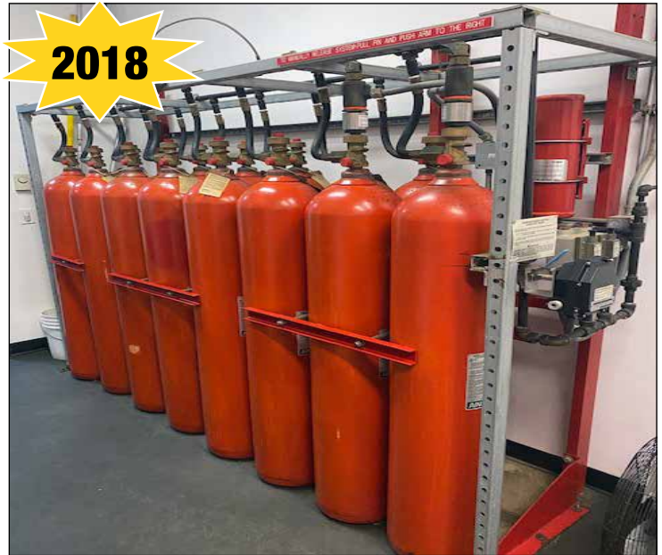
Great Lakes Nitrogen System