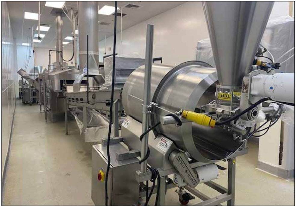
Partial View of Roasting Line