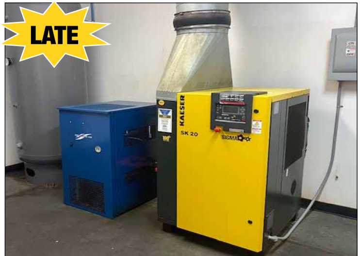
Kaeser SK20A2 AC w/Dryer & Tank