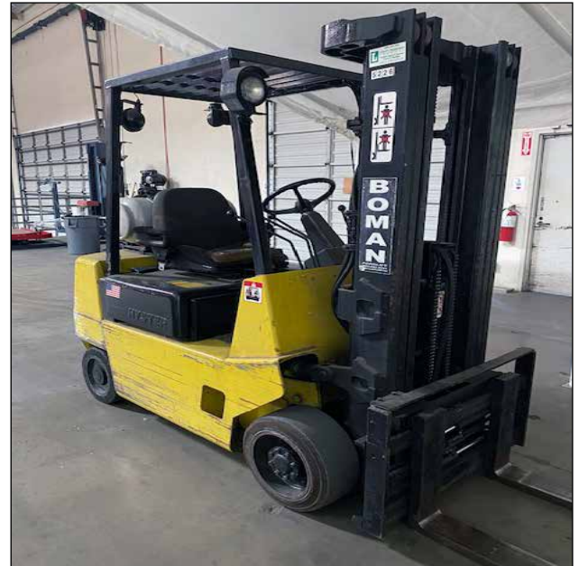
Hyster Electric Forklift