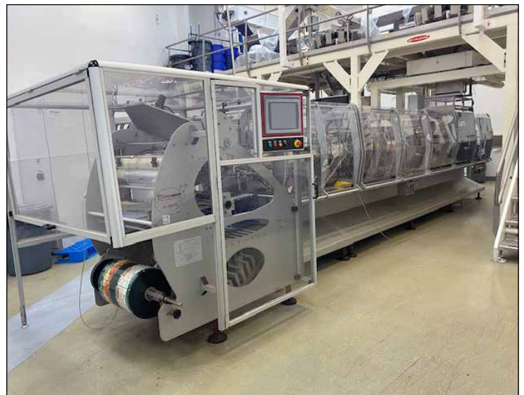
Mespack Horizontal Form/Fill & Seal