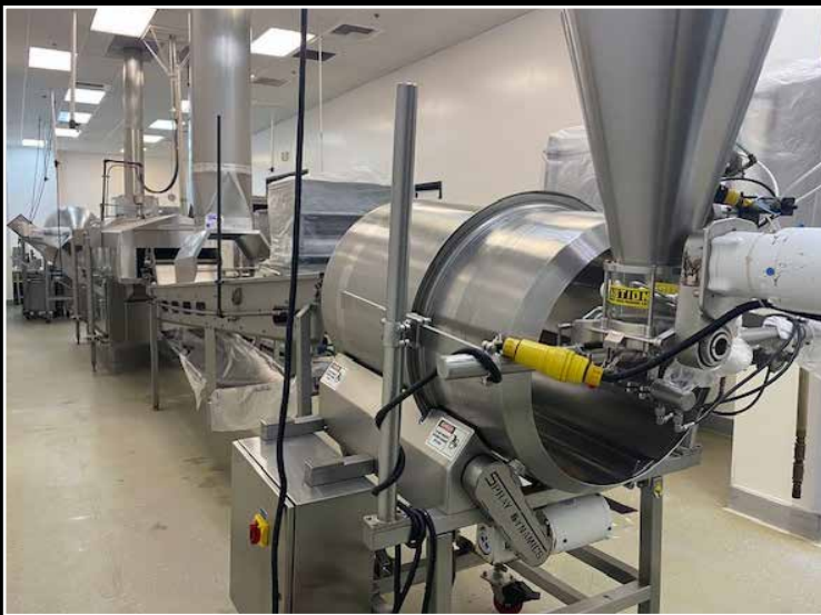
Partial View of Roasting Line