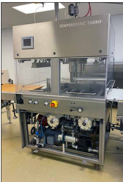
Sollich Temperature Turbo Enrober