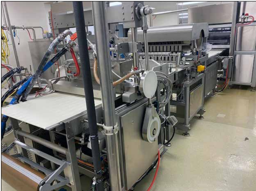
Partial View of Chocolate Line

Also: Sollich Mini-Temperer, (2) Imperial Melters & Lomar Metal Detector