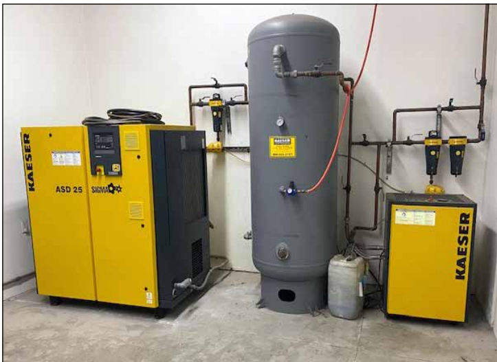
Kaeser Sigma AC Dryer & Tank