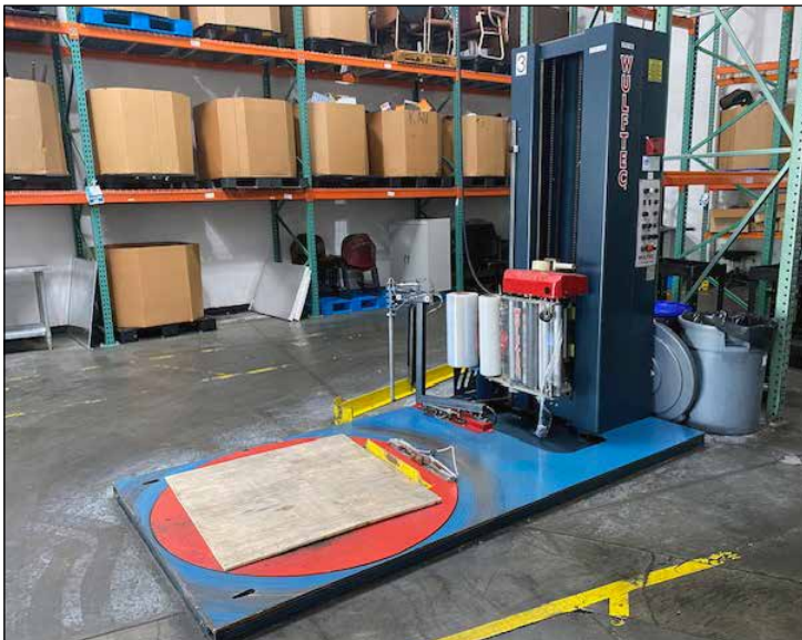
Wulftec WLPA-200, Pallet Wrapper