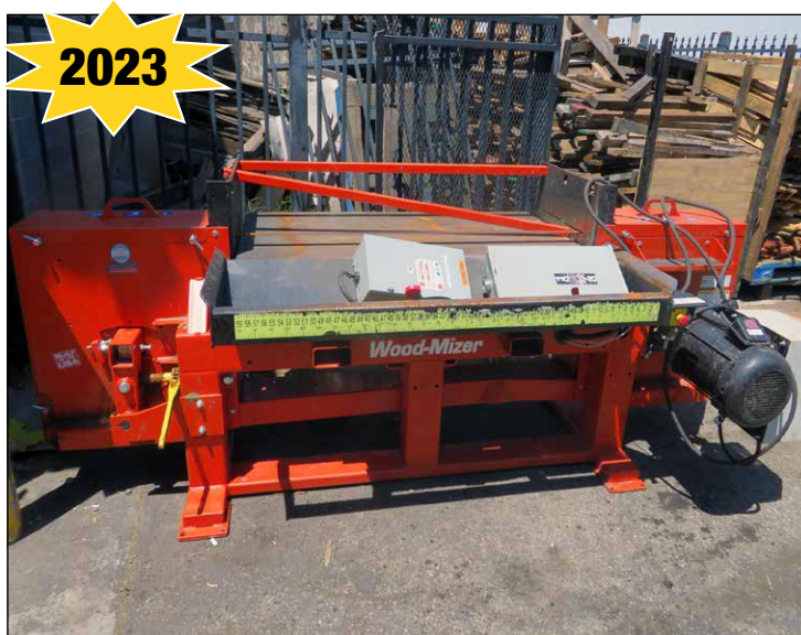
Woodmizer PD200C10-RJ Pallet Dismantler