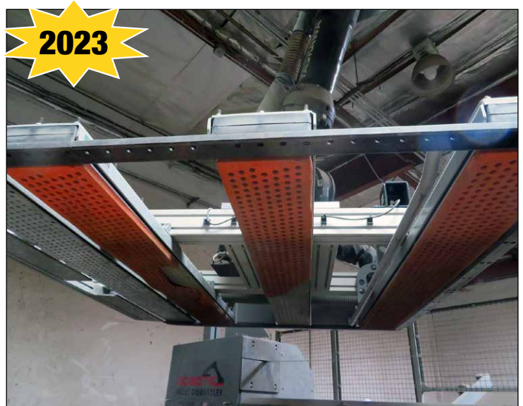
Yaskawa Motomen HP3 Robotic Arm