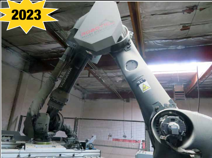
Alliance Robotic Pallet Dismantler w/Yaskawa Motomen HP3 Robotic Arm