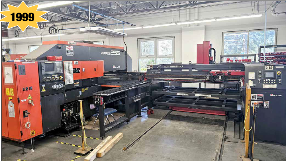
Amada Vipros 255, 22-Ton CNC Turret Fabricator

1999 Amada Mod. Vipros 255, 22-Ton CNC Turret Fabricator, with Sheet Loader, Fanuc 18p Controls, with Coolant, S/N AVP55186