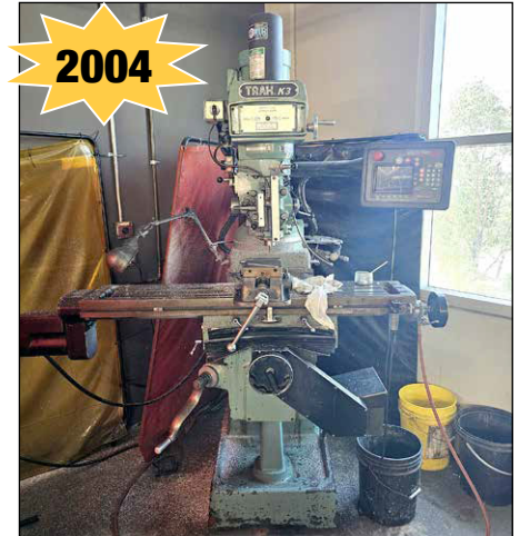
Trak K3 Edge CNC Vertical Mill

2004 Trak Mod. K3 Edge CNC Vertical Mill, w/Photo Trak Edge Control, S/N 042AF12735