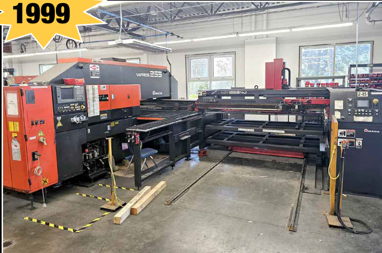
Amada Vipros 255, 22-Ton CNC Turret Fabricator