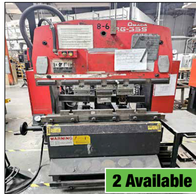
Amada RG35S, 4' x 38-Ton CNC Press Brake