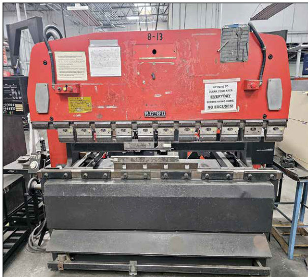
Amada RG80, 8' x 80-Ton CNC Press Brake

Amada Mod. RG-25, 4' x 25-Ton CNC Press Brake, S/N 2S4767