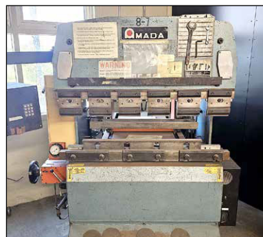
Amada RG-25, 4' x 25-Ton CNC Press Brake