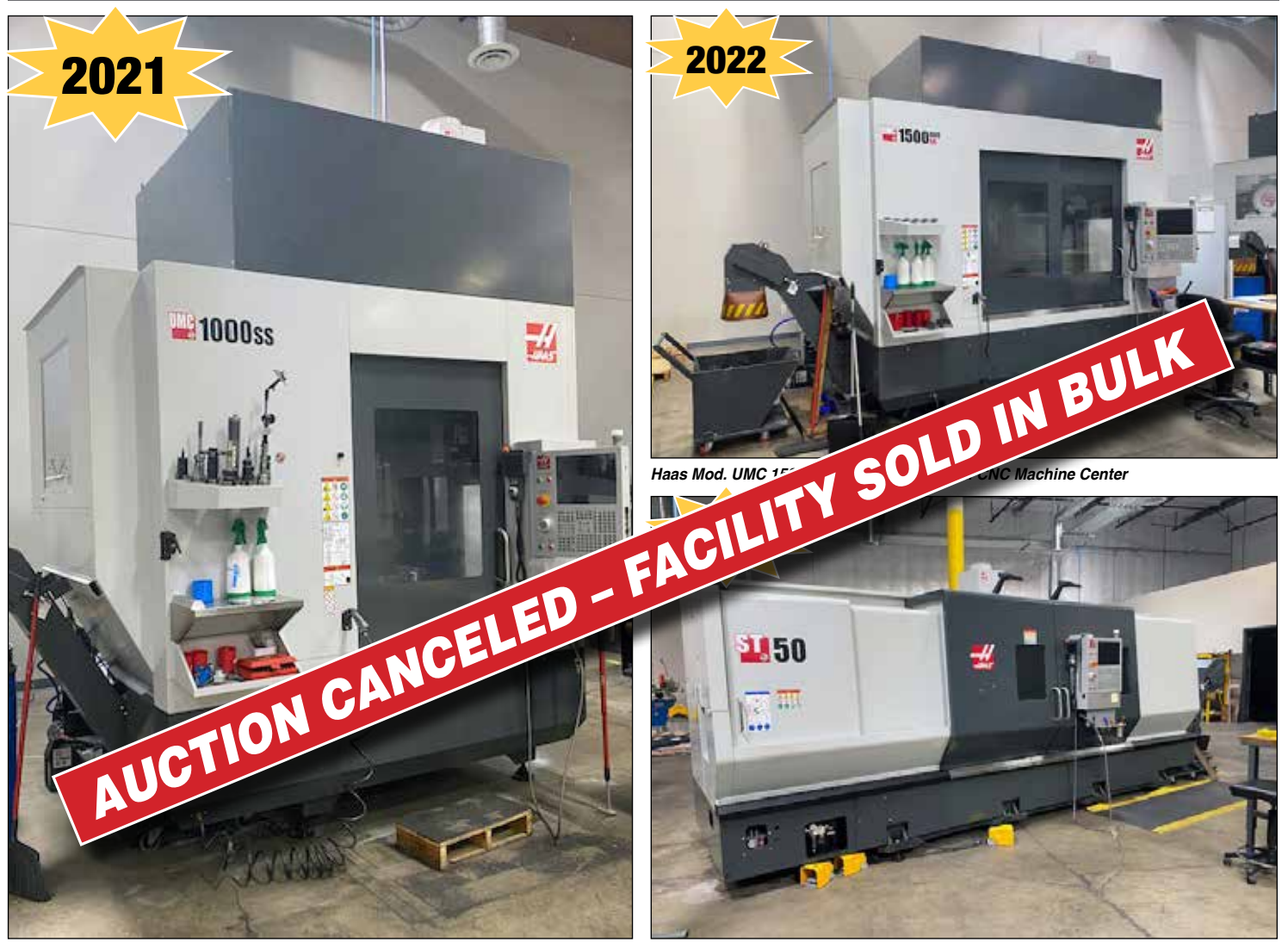
Haas Mod. UMC 1000 S.S. 5-Axis Vertical CNC Machine Center

HAAS CNC MACHINING / TURNING (Continued)