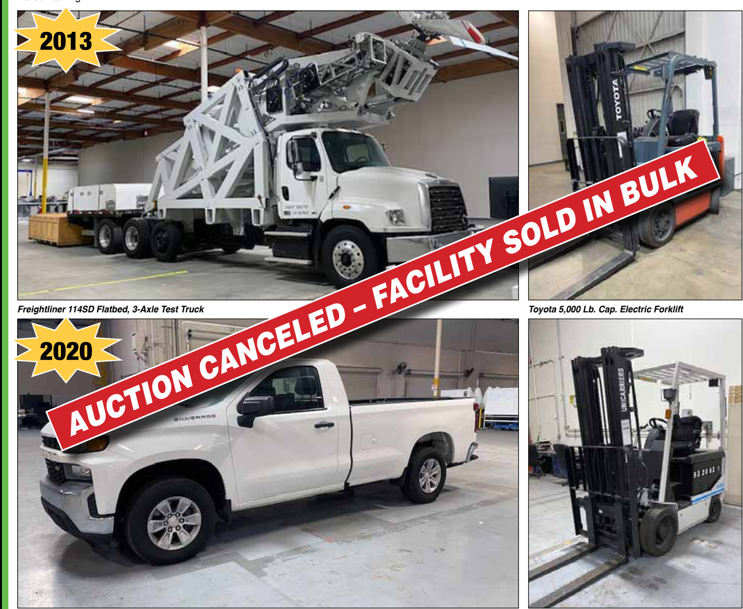
Chevrolet Silverado Pick-Up Truck

JLG Mod. 3246ES, Manlift 2023 Rock Solid Cargo 3-Axle Trailer, Side & Rear Doors, Test Station, Interior 2020 Chevrolet Silverado Pick-Up Truck JLG Mod. 1930ES, Manlift