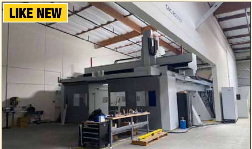
CMS Poseidon 50/130 KX5 Z2500 NC, Boring-Routing-Milling Machine Room

CMS Poseidon 50/130 KX5 Z2500 NC, Boring-Routing-Milling Machine Room, w/(2) AirWall Envirosystems, 16-Station Tool Changer, Renishaw Probe, S/N DB65