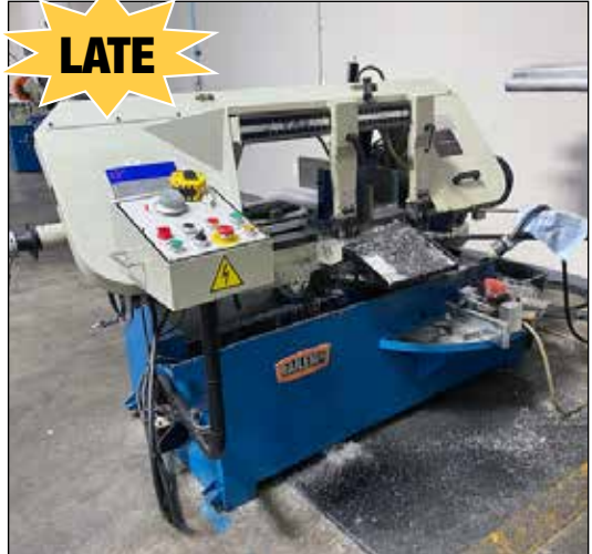
Baileigh BS-330SA, 13" Metal Cutting Horizontal Band Saw