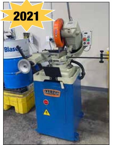
Baileigh CS-350EU Auto Cut Off Saw