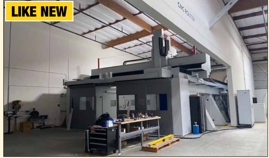
CMS Poseidon 50/130 KX5 Z2500 NC, Boring-Routing-Milling Machine Room

CMS Poseidon 50/130 KX5 Z2500 NC, Boring-Routing-Milling Machine Room, w/(2) AirWall Envirosystems, 16-Station Tool Changer, Renishaw Probe, S/N DB65