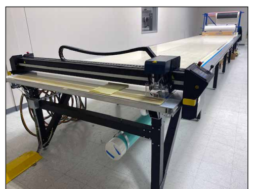
Gerber Cutting Table w/Controls

Gerber Cutter, w/Tool Holders, 78" Width • Ultimate Bench Type Test Chambers • Husky Tool Cabinets; Portable Test Stands • BuildPro Welding Tables, S/Ns TM210527 & TM220398 • Quincy Mod. 40 Lab Oven; Portable Work Tables • Genie Mod. 2416, 450lb. Portable Hoists, w/ Virtek Units • Frigidaire Freezers