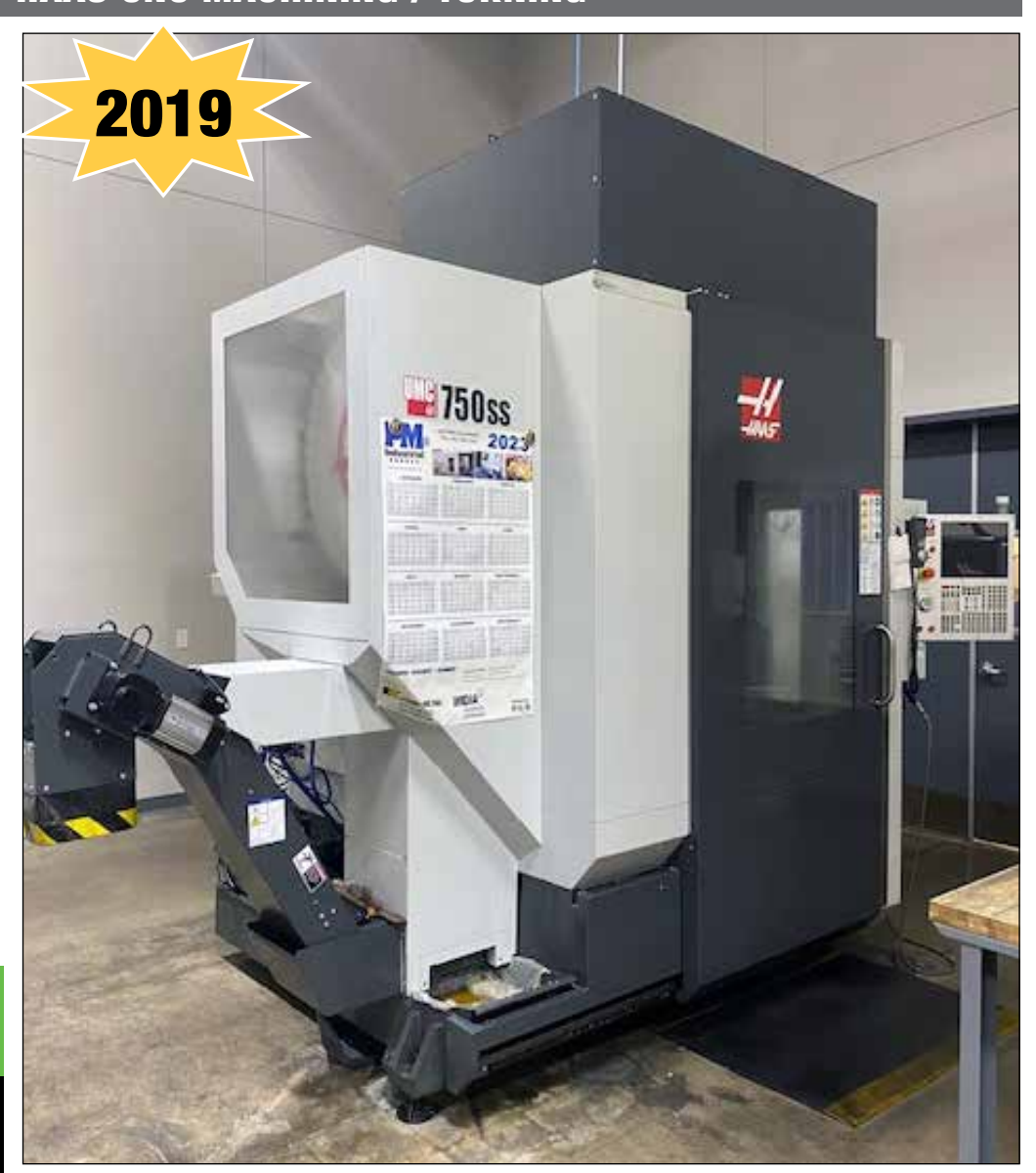
Haas Mod. VMS750SS, 5-Axis Vertical and Horizontal CNC Machine Center