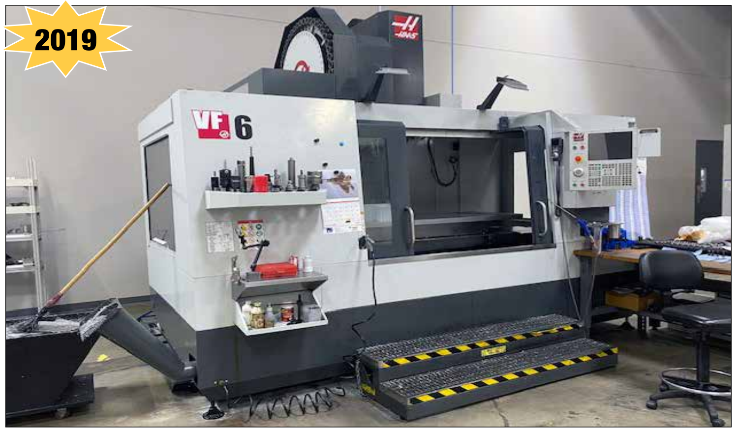
Haas Mod. VF-6, Vertical CNC Machine Center