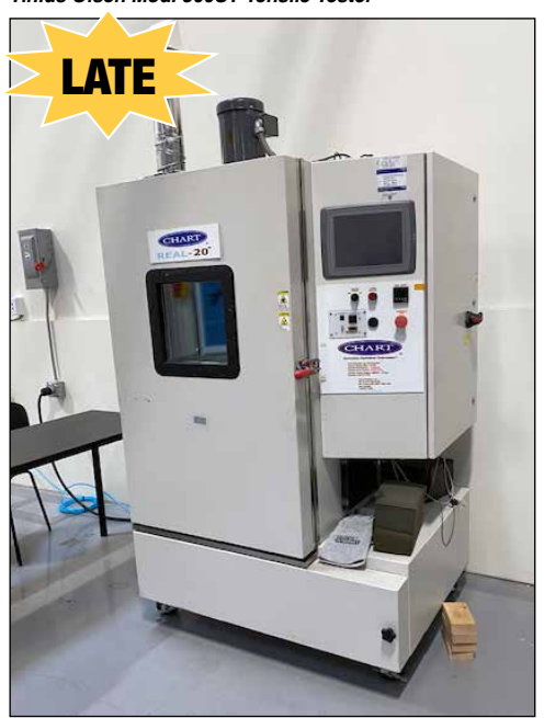
Chart Mod. REAL-20GM Test Chamber