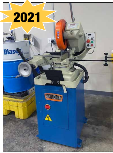
Baileigh CS-350EU Auto Cut Off Saw

Standridge 48" x 72" x 9"Granite Surface Plate, w/Stand • Stepcraft Mod. M-1000 Portable CNC Router • Grizzly Mod. G1014Z Combination Sander • 2000 Baileigh Mod. BSV-20VS, Vertical Band Saw • Jet 8" Industrial Dbl. End Grinder, Ped. Type • Powermatic Mod. PM200B, Var. Spd. Pedestal Drill Press • Baileigh 20" Disc Grinder • Bilt Hard 12-Speed Bench Drill Press