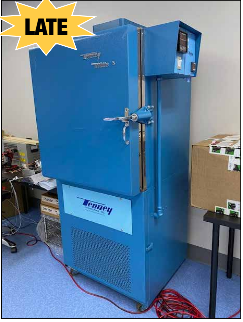
Tenney Mite 5 T-5/Class, 2 & 3 Refrigerated Chamber

Strandridge 48" x 48" Lip Type Granite Surface Plate