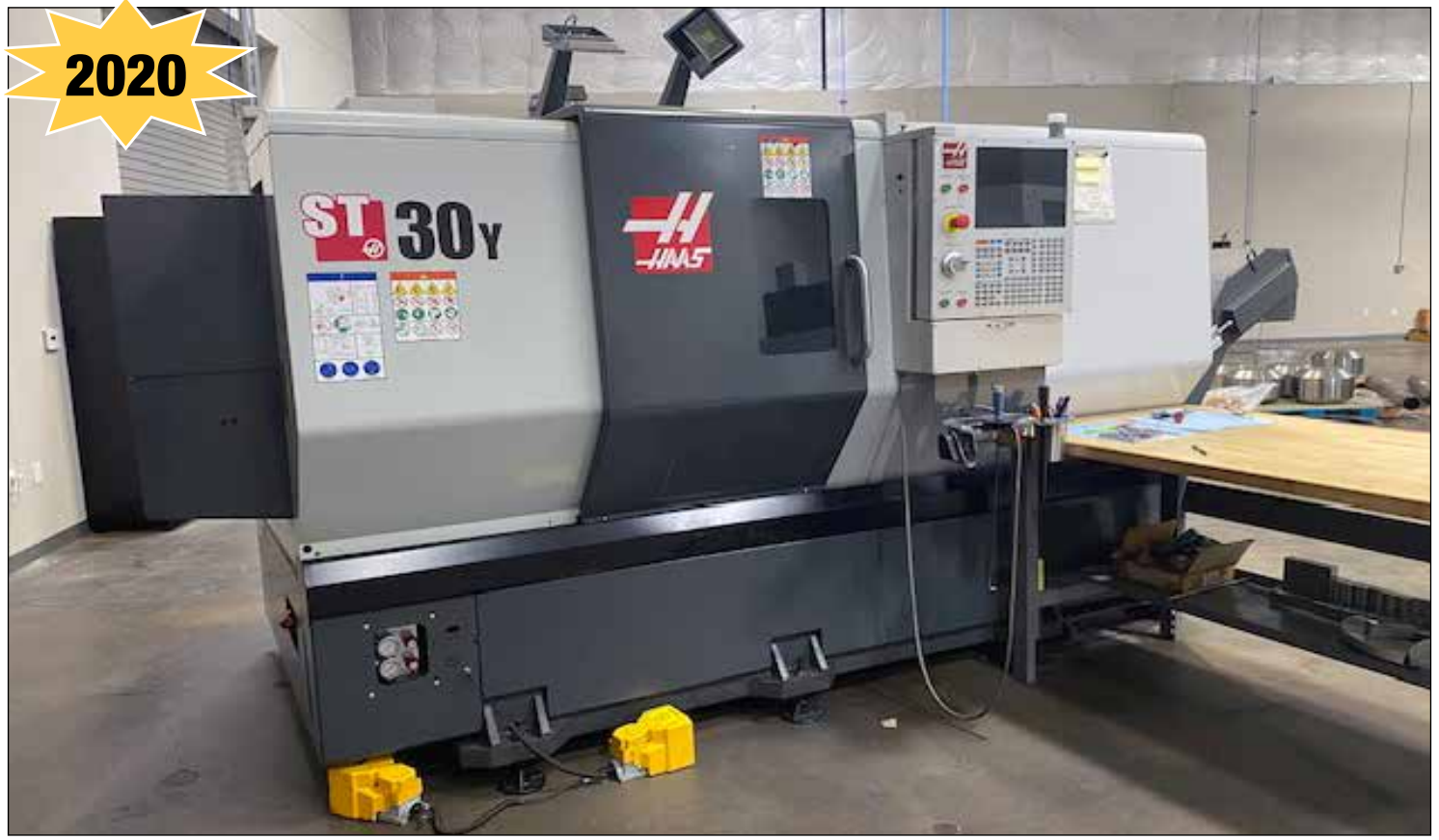
Haas Mod. ST30Y CNC Lathe