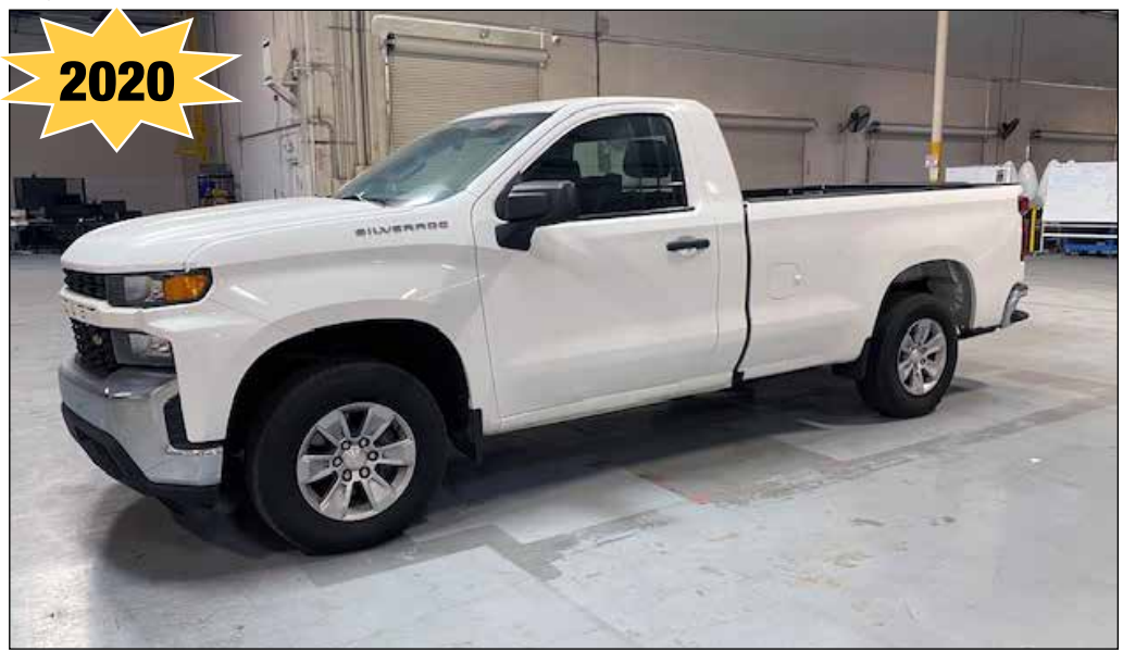
Chevrolet Silverado Pick-Up Truck