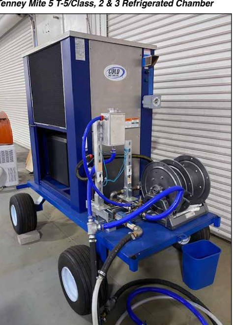
Cold Shot Mod. ACWC-036Q-LT06, Portable Chiller