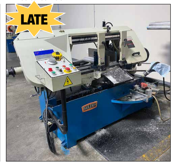
Baileigh BS-330SA, 13" Metal Cutting Horizontal Band Saw