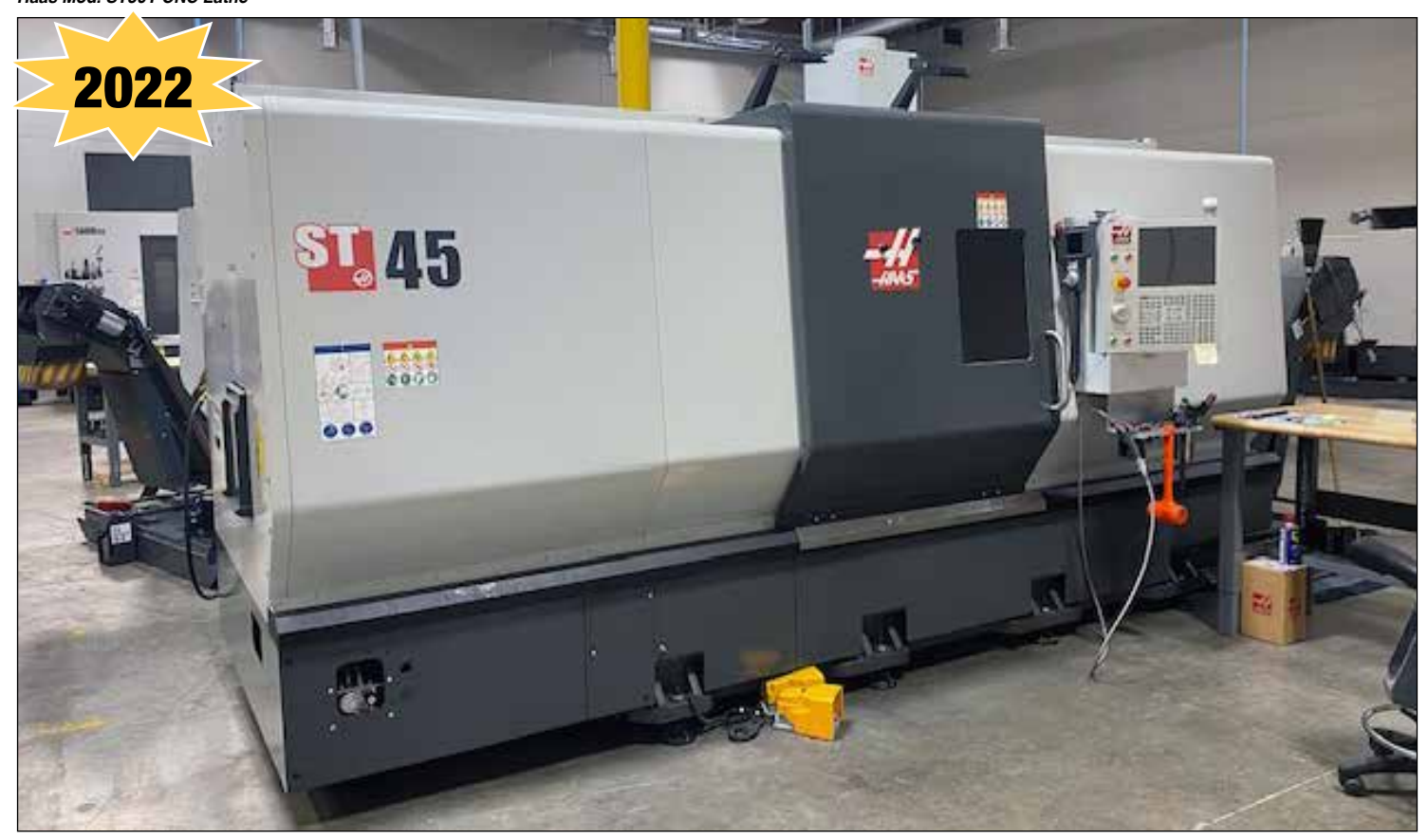
Haas Mod. ST-45, CNC Lathe