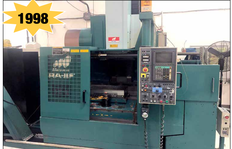
Matsuura Mod. RA-IIF, 3-Axis CNC Vertical Machine Center