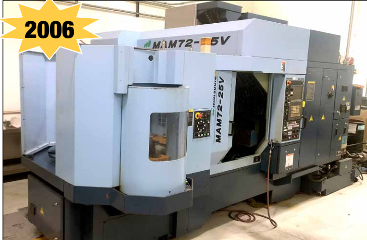
Matsuura Mod. MAM72-25V, 5-Axis CNC Vertical Machine Center

2002 Kitagawa Mod. TC100-33, 4th Axis Indexer, S/N E2016