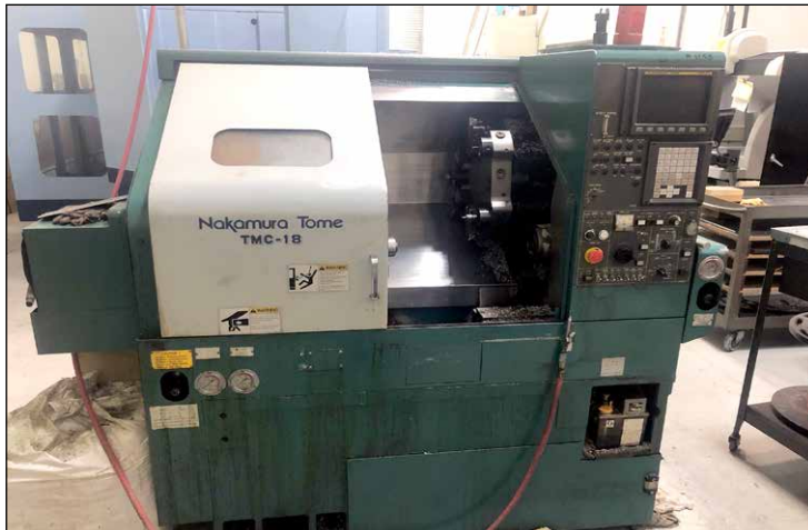
Nakamura Tome Mod. TMC-18, 2-Axis CNC Turning Center

Hitachi Seiki Mod. Hitech-Turn 20, 2-Axis CNC Turning Center, Yasnac Controls, 8" x 3-Jaw Chuck, 16" x 12-Position Turret, S/N 21469SC