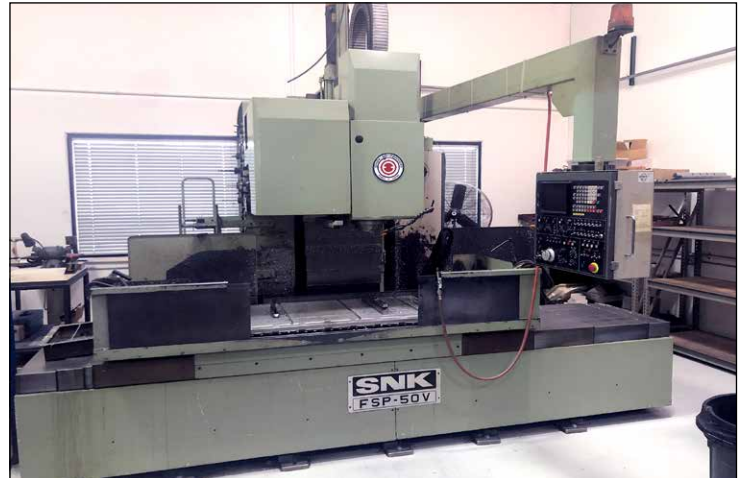
SNK Mod. FSP-50V, 3-Axis CNC Vertical Machine Center