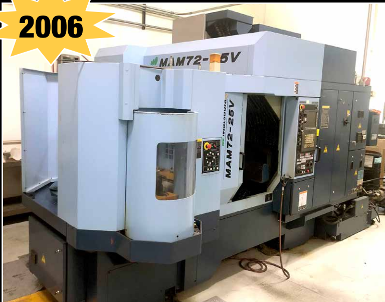
Matsura Mod. MAM72-25V, 5-Axis CNC Vertical Machine Center