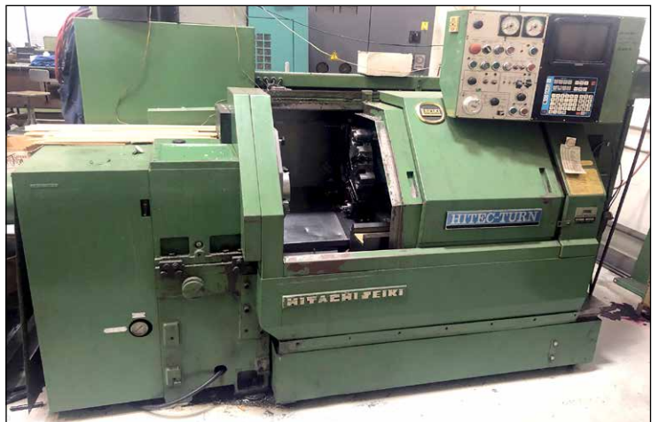
Hitachi Seiki Mod. Hitech-Turn 20, 2-Axis CNC Turning Center