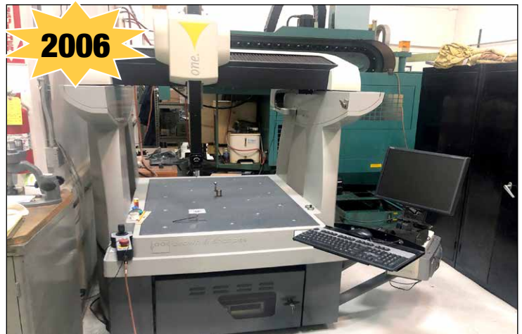
Brown & Sharpe Mod. ONE 7.10.7, 3-Axis CMM

Lista Tool Cabinet & Tooling, 9" Horizontal Band Saw, Vise and Benches, Crown Pallet Jack, Arbor Press, Kalamazoo 1-1/2" Vertical Belt Sander, (2) Baldor Double End Carbide Grinders, Digi Bench Scale, Craftsman 1/2 hp Double End Grinder, Baldor Double End Buffer, Ridgid Shop Vacuum, 2-Ton Engine Hoist, Hand Truck, (3) Shop Fans, Kurt Table Vises, Safety Kleen Parts Cleaner, Office Equipment, MASSIVE AMOUNT OF CNC TOOL HOLDERS AND TOOLING