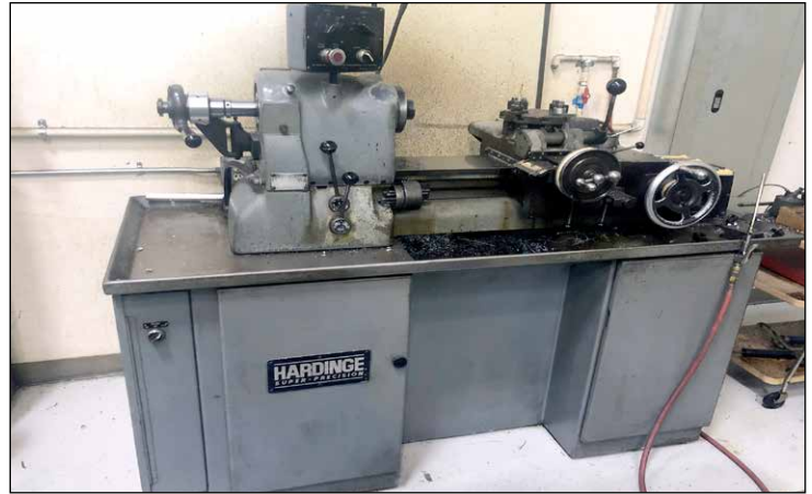
Hardinge Mod. HC Chucker