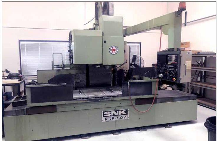
SNK Mod. FSP-50V, 3-Axis CNC Vertical Machine Center