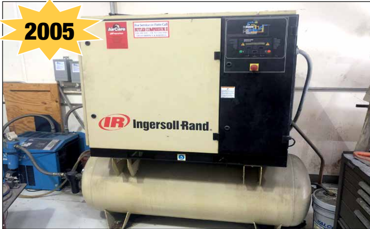
Ingersoll Rand SSR-UP6-15-125, 15hp Tank-Mounted Rotary Screw Air Compressor