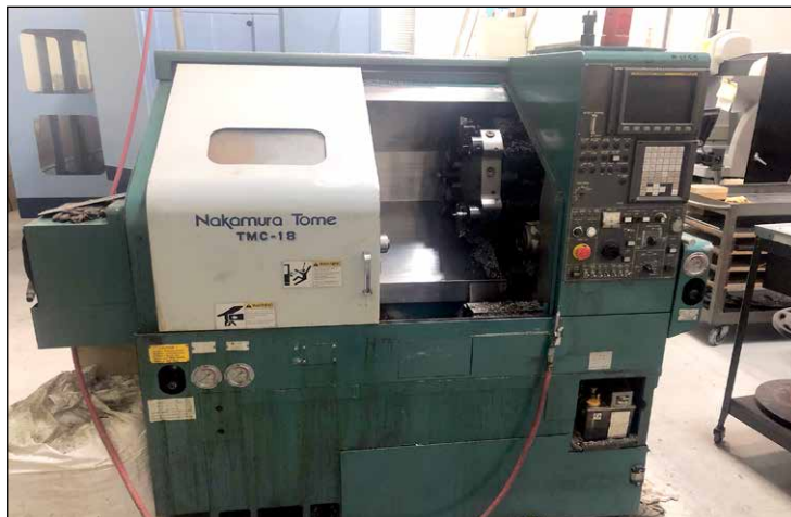
Nakamura Tome Mod. TMC-18, 2-Axis CNC Turning Center

Hitachi Seiki Mod. Hitech-Turn 20, 2-Axis CNC Turning Center, Yasnac Controls, 8" x 3-Jaw Chuck, 16" x 12-Position Turret, S/N 21469SC