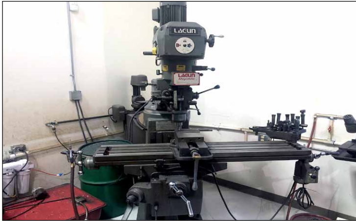
Lagun 1-1/2 HP Variable Speed Vertical Mill