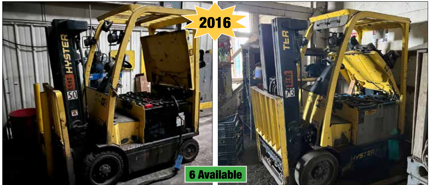
Hyster E50XN, 5,000 Lb. Capacity Electric Forklifts