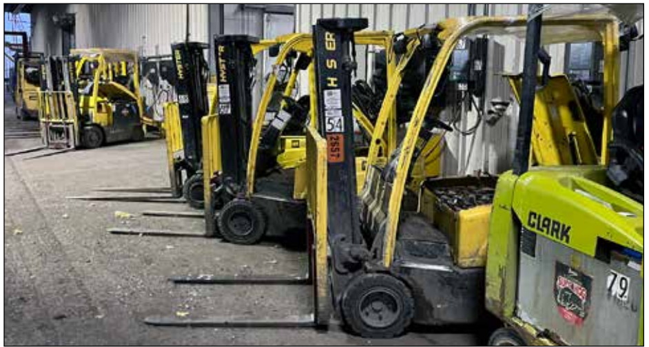
View of Forklifts