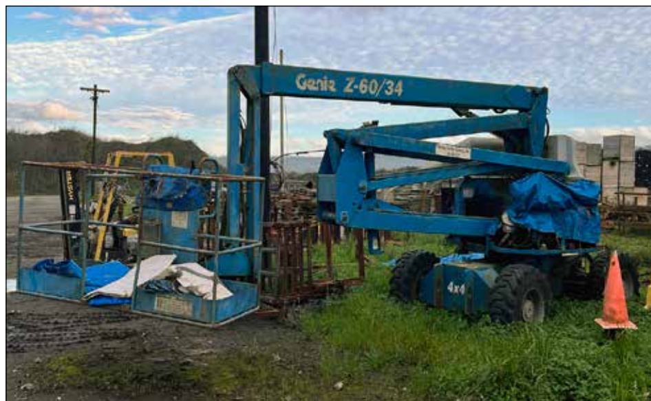
Genie Mod. 2-60/34, 60' Aerial Manlift