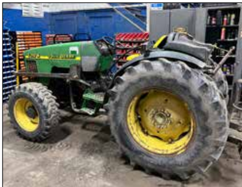
John Deere 5310N Tractor