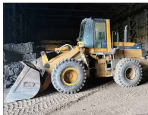
Komatsu Loader with 8' Bucket