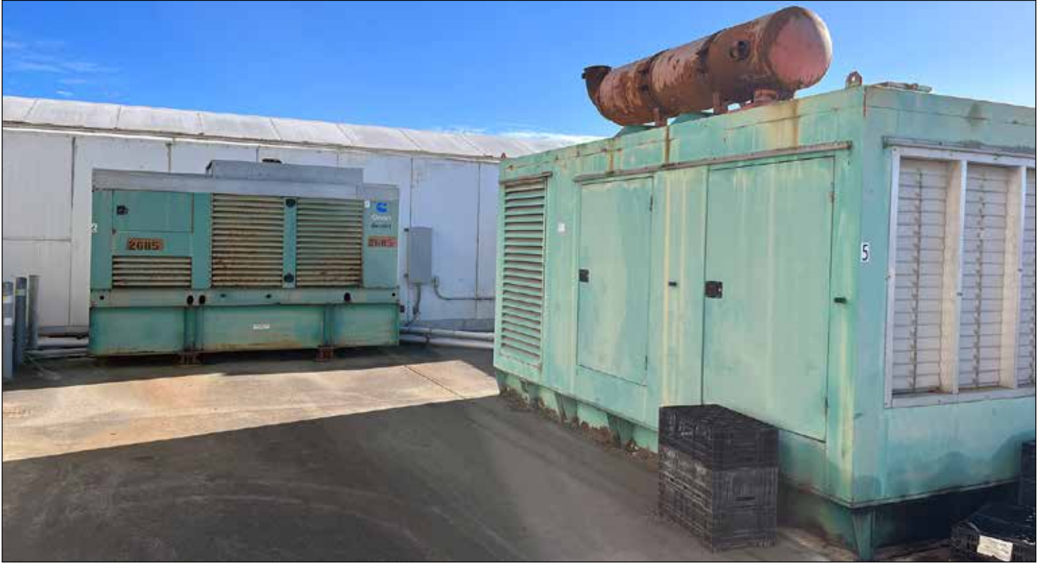
Onan Mod. DFRH-5002064 400-KW Generator

Command Control Horizontal Propane Tank, S/N 113812, w/ Ransome Vaporizer 2005 MQ Power Mod. Whisperwatt DCA-25SSIU, 25 KVA Diesel Generator, Trailer-Mounted, S/N 7105454 Whisper Watt mod. DCA-25SSIU2, Generator, S/N 3775800 Onan Mod. DFRH-5002064, 400-KW Generator, S/N J010298902, Asset #5, Cummins Diesel Engine, w/Power Command Control Onan Mod. 4000FCE Generator, S/N K980820087, Cummins Diesel Engine, w/Power Command Control 1,000-Gal. Off-Road Diesel Horizontal Carbon Steel Tank, w/Pump Raypak Boilers; Holland Heaters