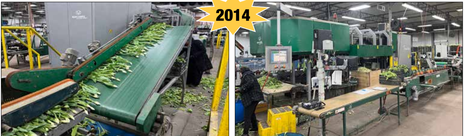
Views of Bercomex / Furora Bunching Line