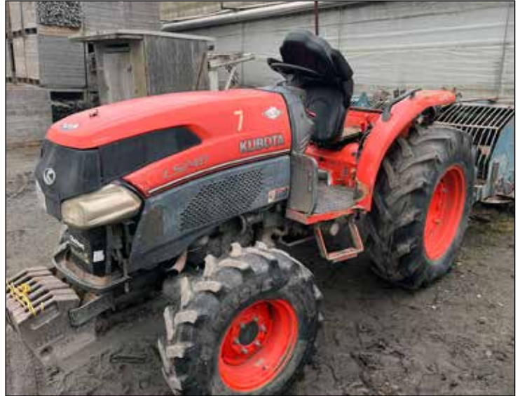
Kubota 5240 Tractor