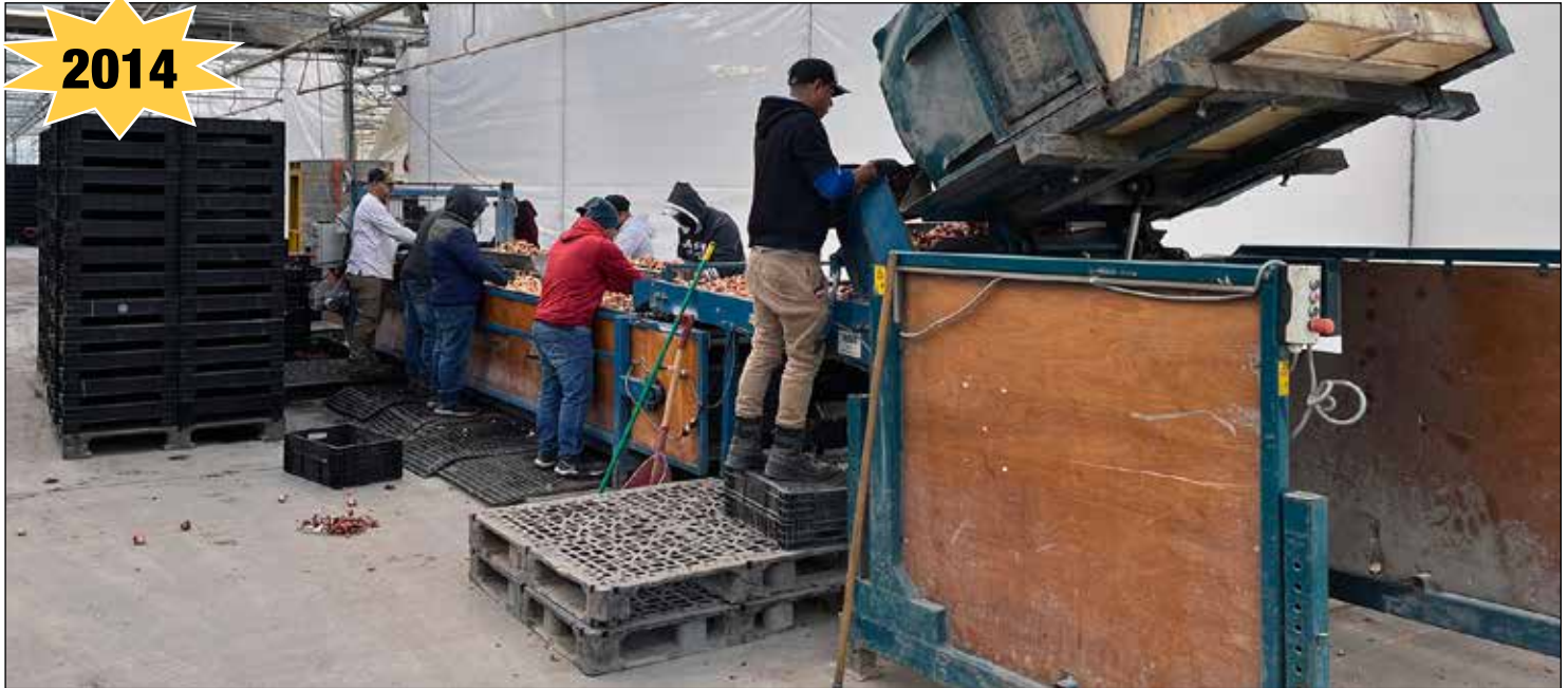
Bulb Packaging Line/Water Tulip Line