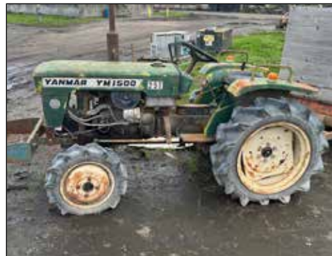
Yanmar YM1500 Tractor