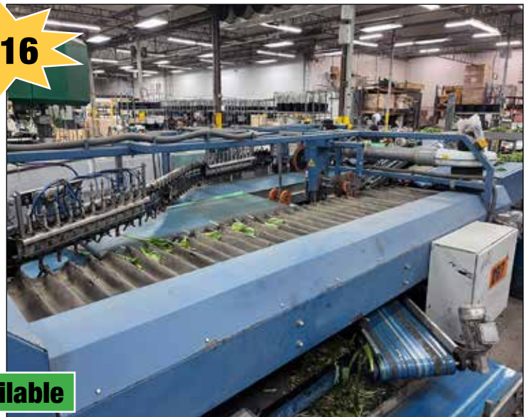
Views of Havatec Bunching Lines #6 and 7