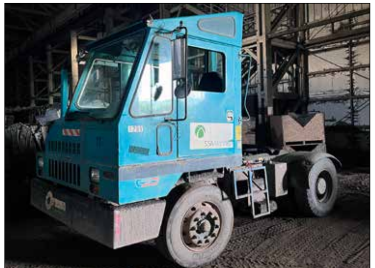
Commando YT-50 Yard Goat