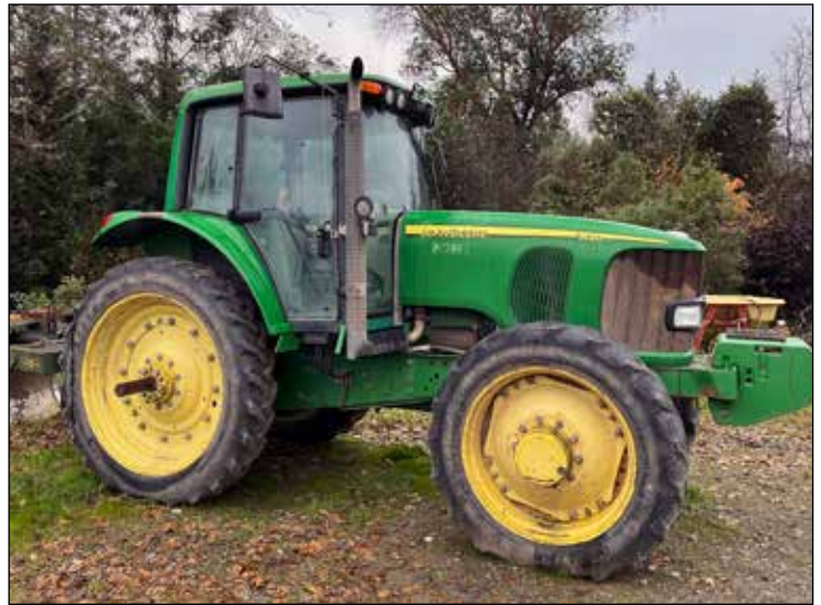
John Deere 7420, 4WD Tractor