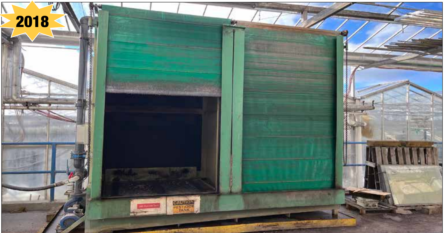
Akerboom Bulb Shower, w/Steel Enclosure