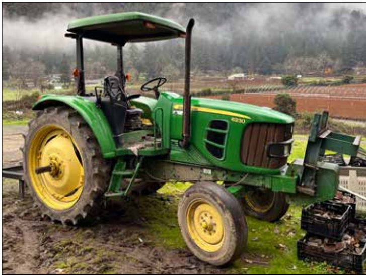
John Deere 6230, 4WD Tractor