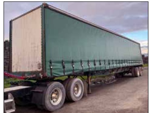
Nu-Van 53' Curtain Trailer