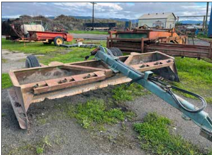
View of Agricultural Equipment