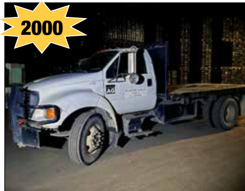
Ford F-650 Flatbed Trucks