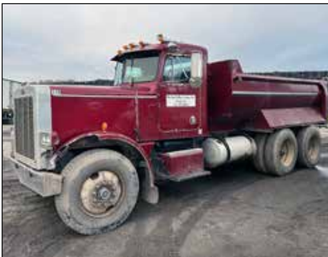
Peterbilt Dump Truck