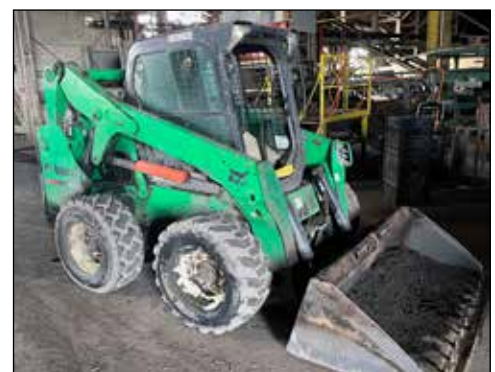
Bobcat Skid Steer Loader with 6' Bucket