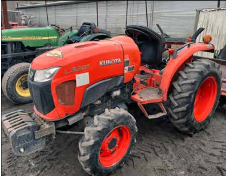
Kubota L3301DT Tractor

(2) Matthew Mowers (3) 200 Gal. Pesticide Trailers LMC Mod. 8204, Plow (29) EX-GO XI640, 3-Wheel Electric Yard Carts Yamaha YDRAX3, Gas Tenco Electric Yard Carts Honda ATV (4) Tenant and Advanced Floor Scrubbers/Sweepers