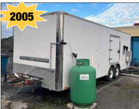
Forest River 20' Shower Trailer