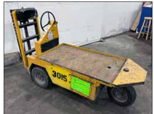
EZ GO 3-Wheel Electric Cart