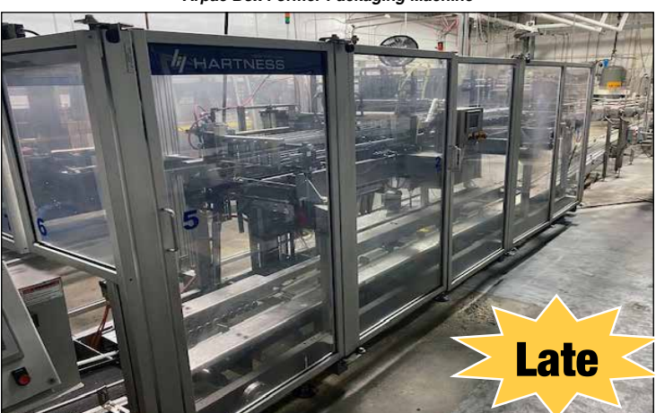
Hartness Mod. L-130, 4-Row Case Packer