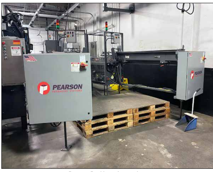
Pearson Dual Lane Accumulator