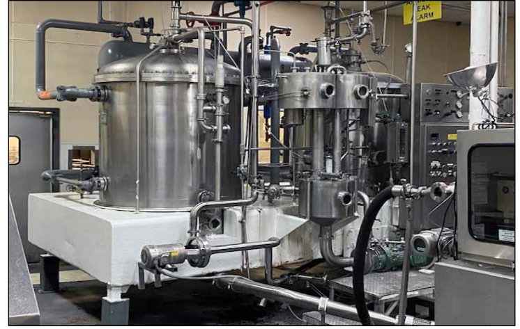
Partial Views of Filler Room 2