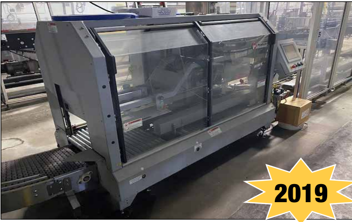
Pearson Packaging System