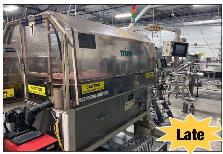
Trine Mod. M6700, Wrap Around Labelling System

Socal Mod. ST1100 Labeler, S/N 325340822 VideoJet Excel/100, S/N E91D09016