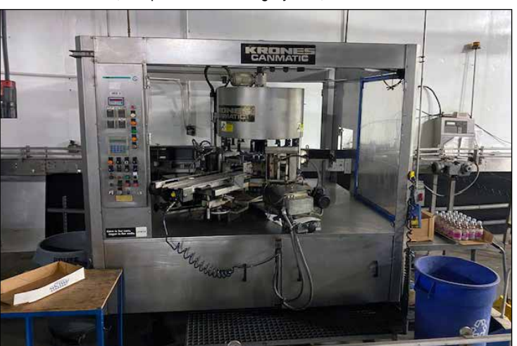
Krones Carmatic 18-Station, Foil Wrap Rotary Labeler

Krones Carmatic 18-Station, Foil Wrap Rotary Labeler Trine Mod. M6700, Wrap Around Labelling System, S/N M67044