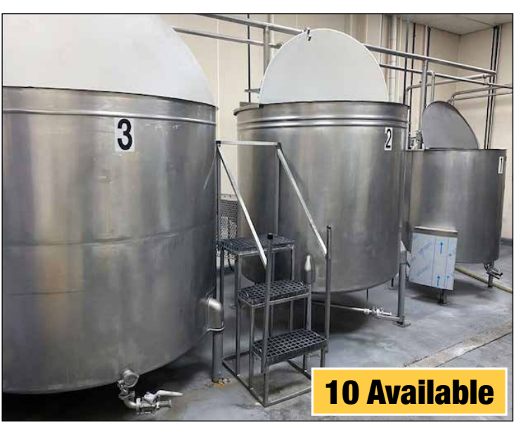
Partial View of S.S. Mixing Tanks

Xobus Priority Due Mod. PX5002 Depalletizer, w/Strong Arm Vertical Stacker Conveyor, S/N 4037123109