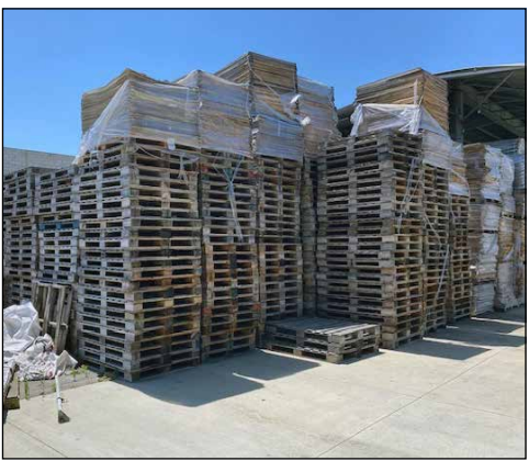
Large Quantity of Usable Wood Pallets