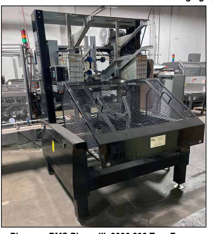
Plemons PMS Phase III, 3000 200 Tray Former

For An Auction Calendar Visit Our Website: tauberaronsinc.com 323.851.2008 888.648.2249