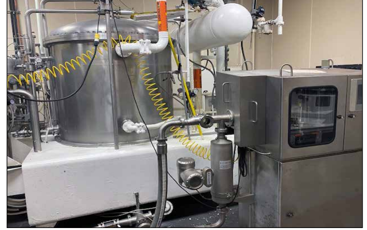
Partial Views of Filler Room 1