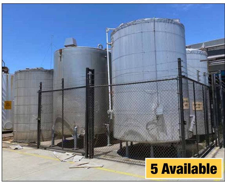
Partial View of Sugar Tanks