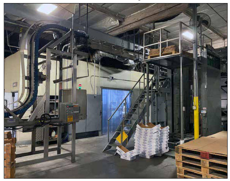
Seco Mod. 300-20 Palletizer, w/Ambec Conveyor System