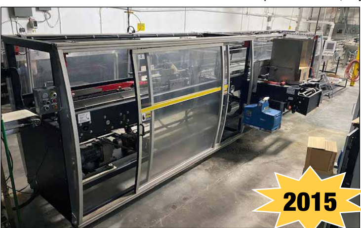
Arpac Box Former Packaging Machine