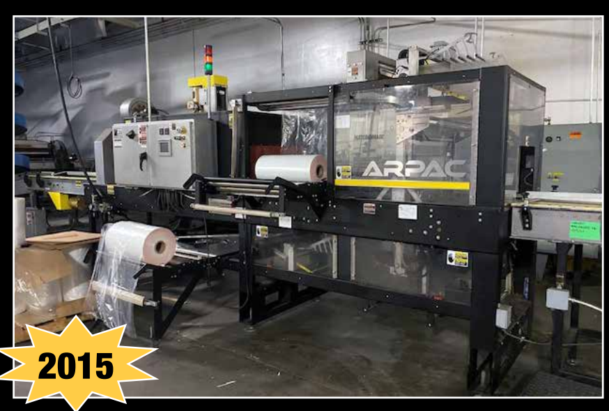
Arpac Mod. 45TW-28, Tray Type Shrink Wrap Bundler