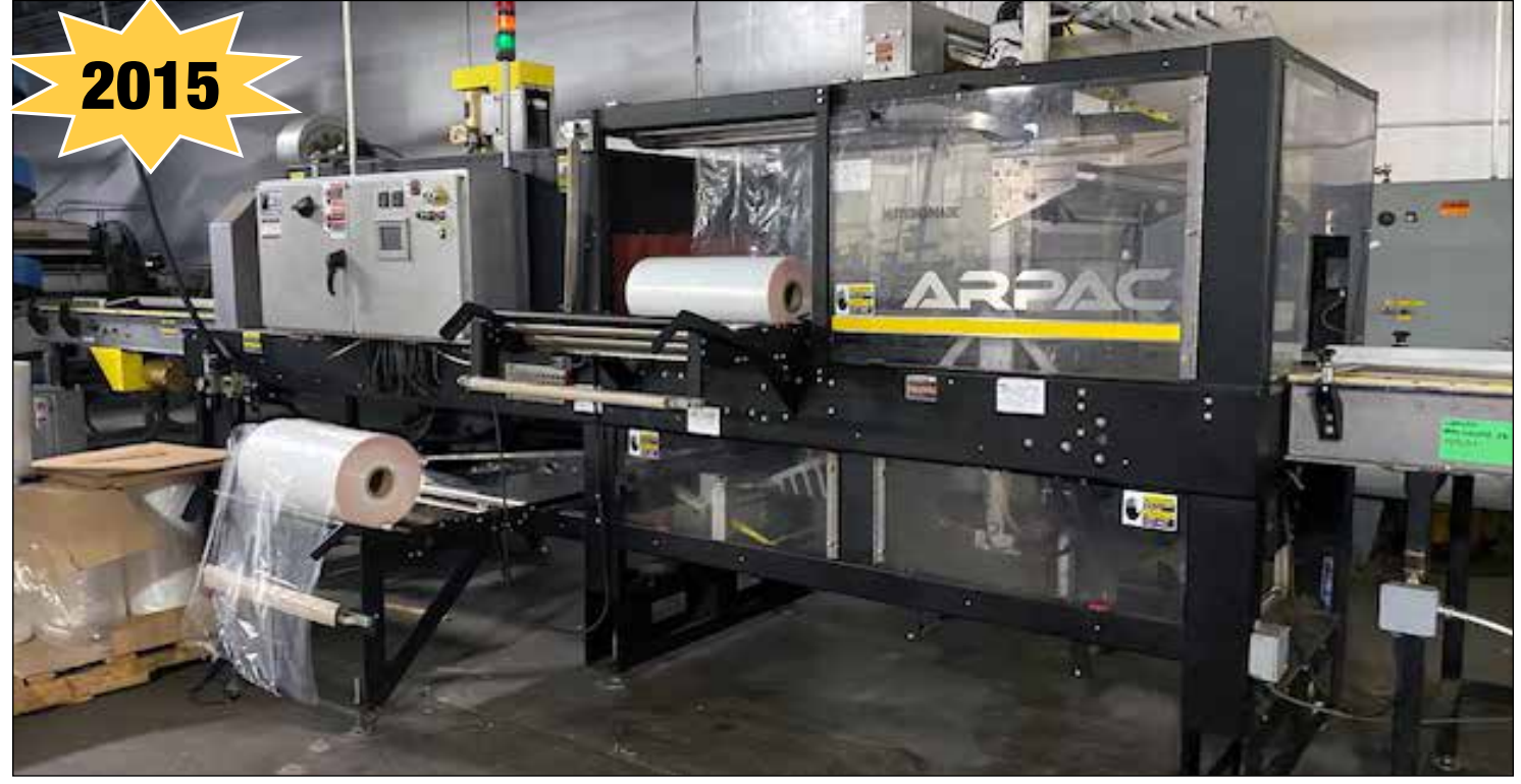
Arpac Mod. 45TW-28, Tray Type Shrink Wrap Bundler

Hartness Mod. L-130, 4-Row Case Packer, S/N W835301