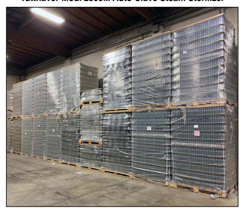
Large Quantity of New Unused Glass Bottles