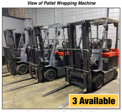
Toyota 4,000 Lb. Electric Forklifts