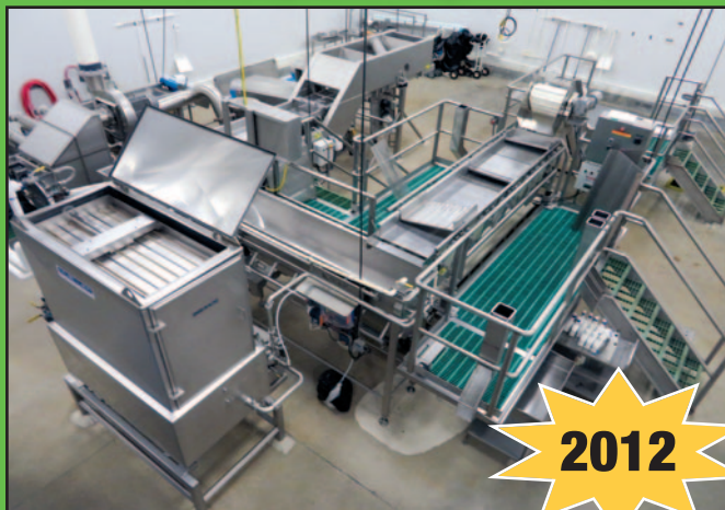
Overall View of Fresh Pack Processing Line

Tuesday, July 16th at 10am PDT 384 E. Bromley Lane, Brighton, CO 80601