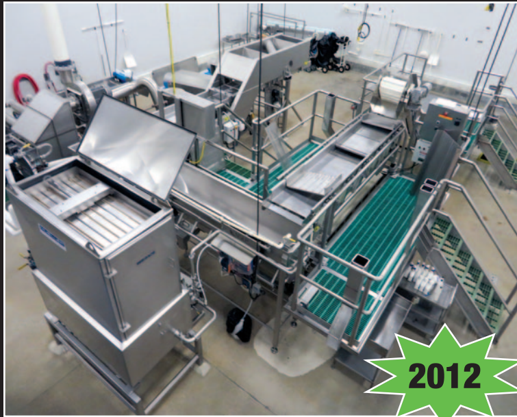
Overall View of Fresh Pak Processing Line