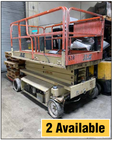
Yale 5,000 Lb. Capacity, LPG Forklifts