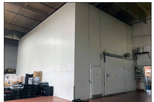
R' Cold 30' x 20' Cooler Room