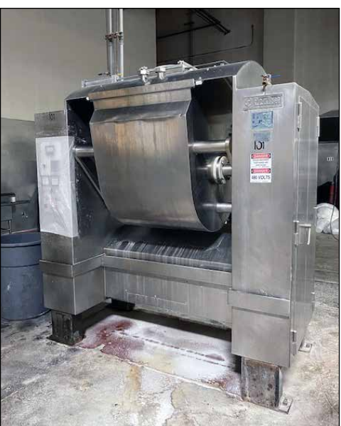
Peerless 300 Lb. Jacketed Roller Bar Dough Mixer