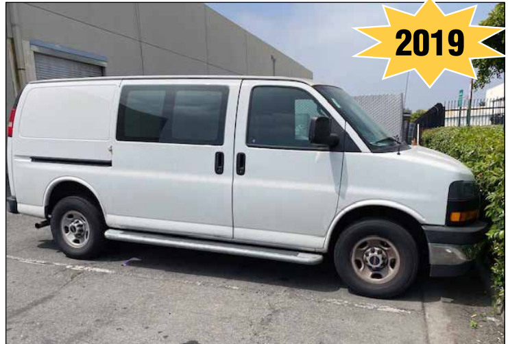
GMC Savana Cargo Van