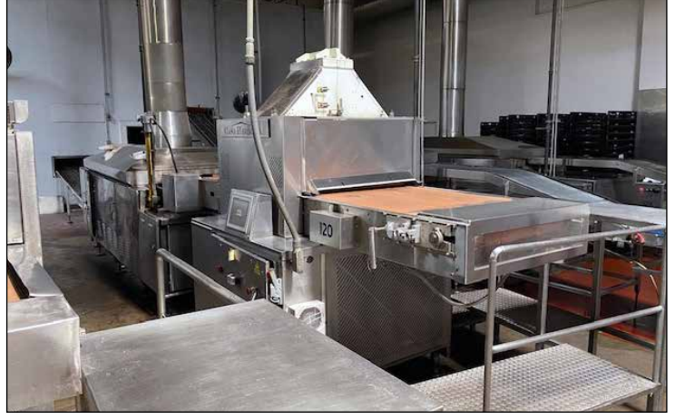
Casa Herrera Mod. TP3232, 32" Conveyorized Tortilla Cooker