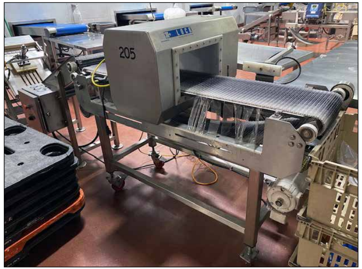
Loma Lock 30+, 8" x 4" Metal Detector and Bag Sealer