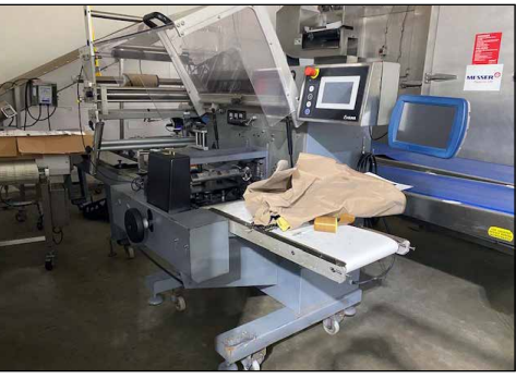
PFM Hawk Wrapper