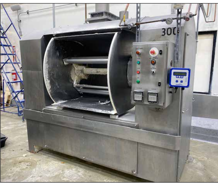
300 Lb. Spiral Jacketed Dough Mixer