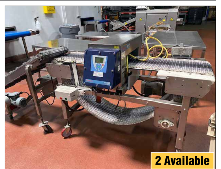
Thermo Apex 500, 8" x 3" Metal Detectors

(2) Lazy Susans • West Coast 18" x 12' S.S. Plastic Conveyor • PCS 12" x 10' Portable S.S. Plastic Offeed Conveyor, S/N 51924 • (2) Dekka Cadet Box Tapers • 20" x 20' S.S. Conveyor Frame • (2) Portable Accordion Conveyors • Factory Cat Mini HD Floor Scrubber • (2) Portable Fans • Rigos 20" Tenderizer • Husky 5 H.P. Vert. Tank Mounted Air Compressor • (3) Portable Large S.S. Vats • (2) Jet Labelers • 5 H.P. Tank Mounted Air Compressor • Machine Shop, w/Mill, Lathe, Sander & Welder • Video Jet Labeler • Markem Mod. 9410, Coder • Outside Refrigeration - Quincy Air Compressor • Fast Track Elec. Door • Misc. S.S. Tables, Scales, Pallet Jacks, Shop Equipment & Office • (2) 40' Containers