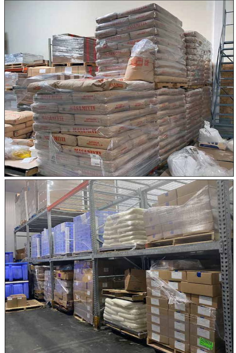
View of Raw Materials & Finished Goods

Monday, July 22nd thru Friday, August 2nd, from 8am to 4pm PT. Weekdays Only. (Thru Friday, August 9th for Ford Tortilla Line)