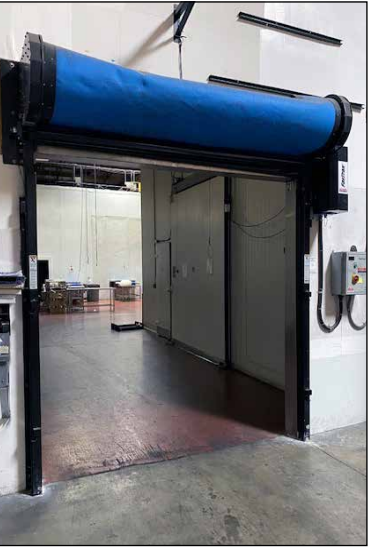
Fast Track Elec. Door