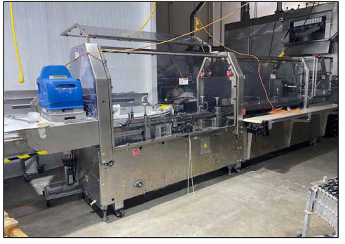
Adco Mod. 15DZ-60-SS Cartoner

50' x 25' Tortilla Cooler Room, w/Ref. Compressors & Coils