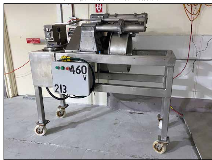
Urschel Mod. G-A Slicer