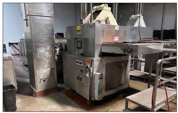
Casa Herrera Mod. HH1TP, 24" Conveyorized Tortilla Cooker