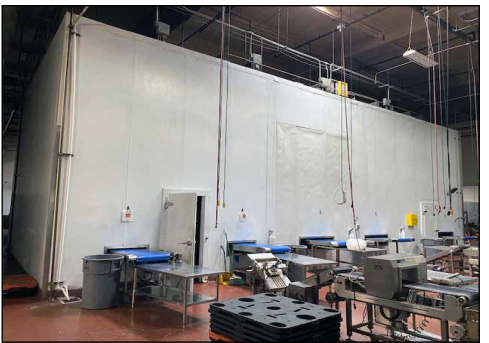
50' x 25' Tortilla Cooler Room