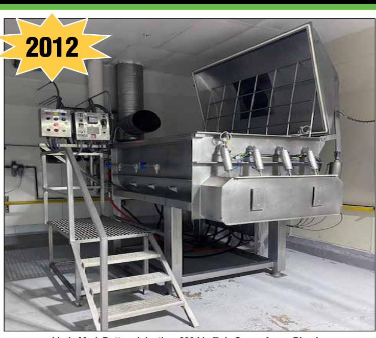
Linde Mod. Bottom Injection, 300 Lb. Twin Screw Auger Blender

(2) Konig Rex Futura Mod. NB420, Dough Divider Rounders, S/N's 037117 (2019) & N/A. #347 KB Divider/Router