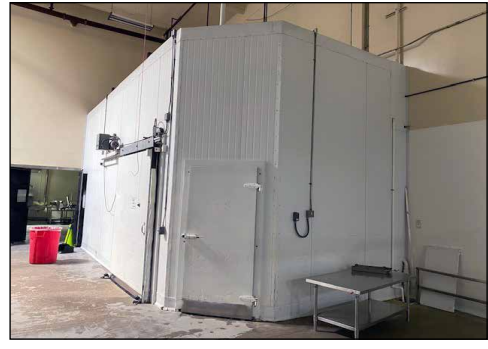
30' x 15' Cooler Room