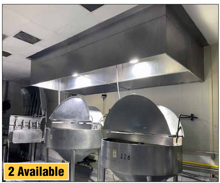
Chester Jensen Mod. 70N20, 350 Gal., V-Shaped, Jacketed Cooking Kettles