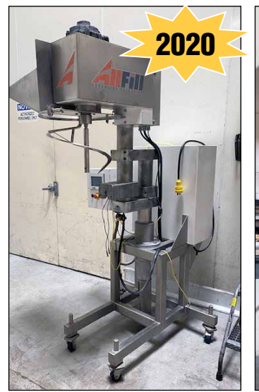
All Fill Mod. B-SV-600, Auger Fillers