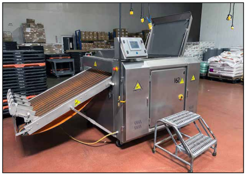
Ford Mod. CSPS-4C Counter Stacker