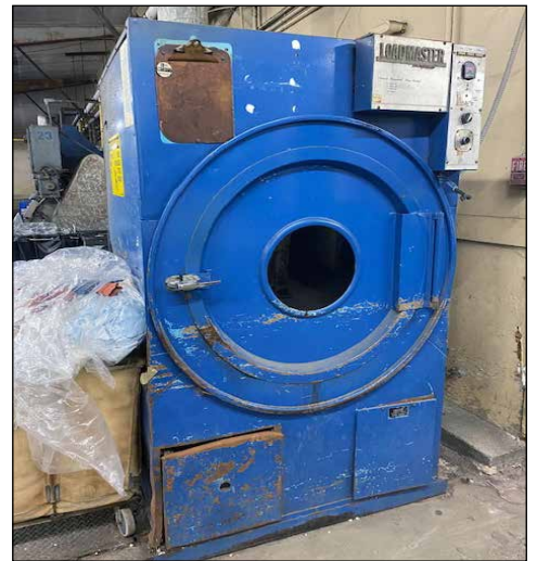
Loadmaster Front Load Dryer