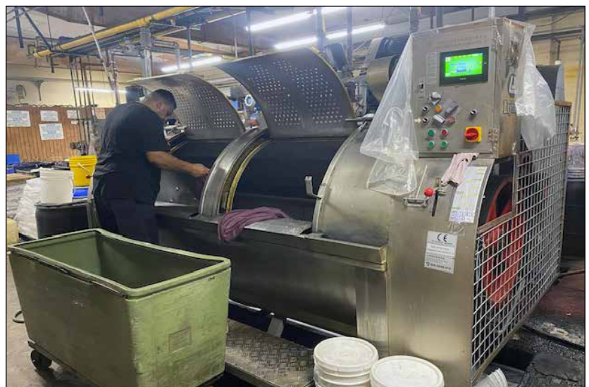
Shanghai Lijing Double Door, Garment Dyeing & Washing Machine