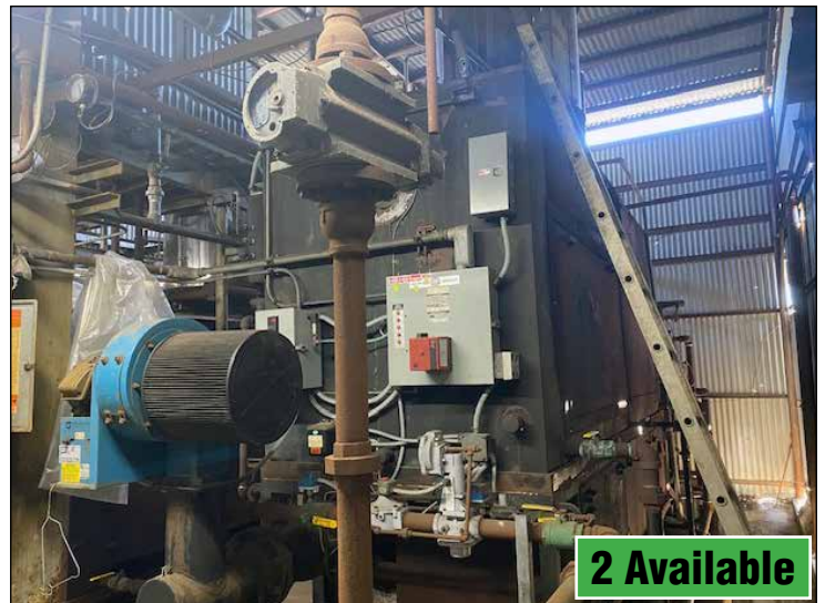
Parker Mod. 150LR Steam Boiler