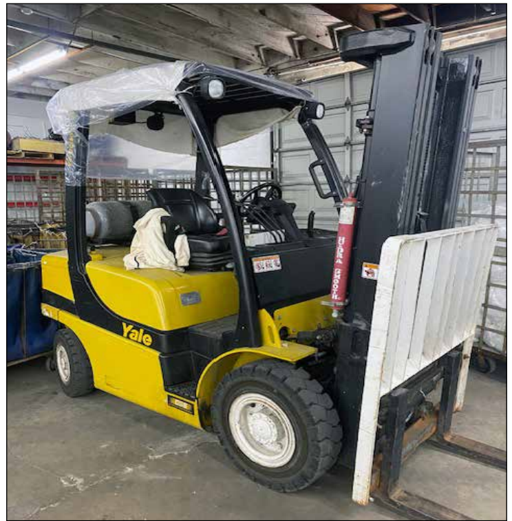
Yale 3,000 Lb. LPG Forklift

1987 Parker Gas-Fired Boiler, 100 psi, 150 hp, 6300 BTU, 100 psi-Trim, S/N 33704