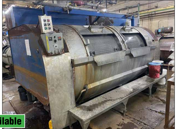
Views of Jumbo Double-Door Dyeing Washers