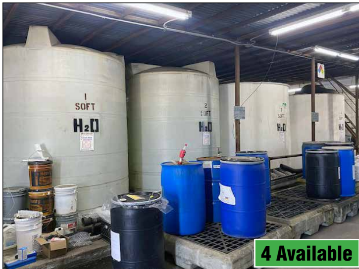
View of Poly Water Tanks