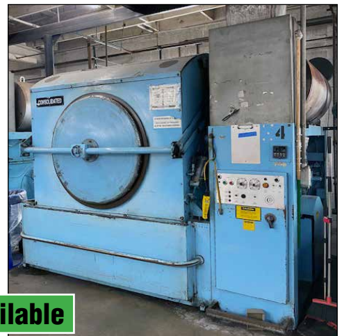
Views of Consolidated Mod. 400GK, Industrial Garment Drying Machines