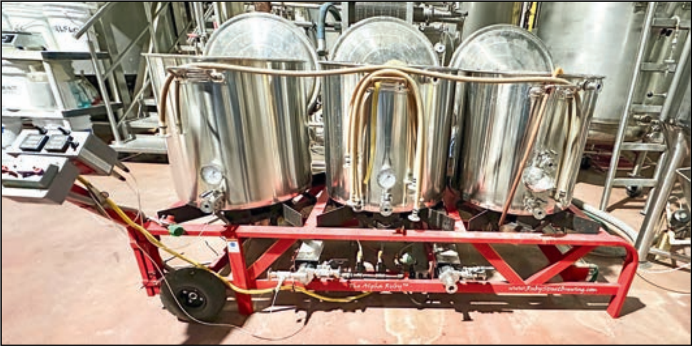
PORTABLE PILOT BREW HOUSE