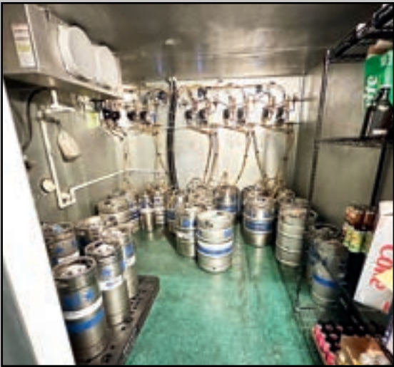
WALK-IN COOLER - INTERIOR VIEW