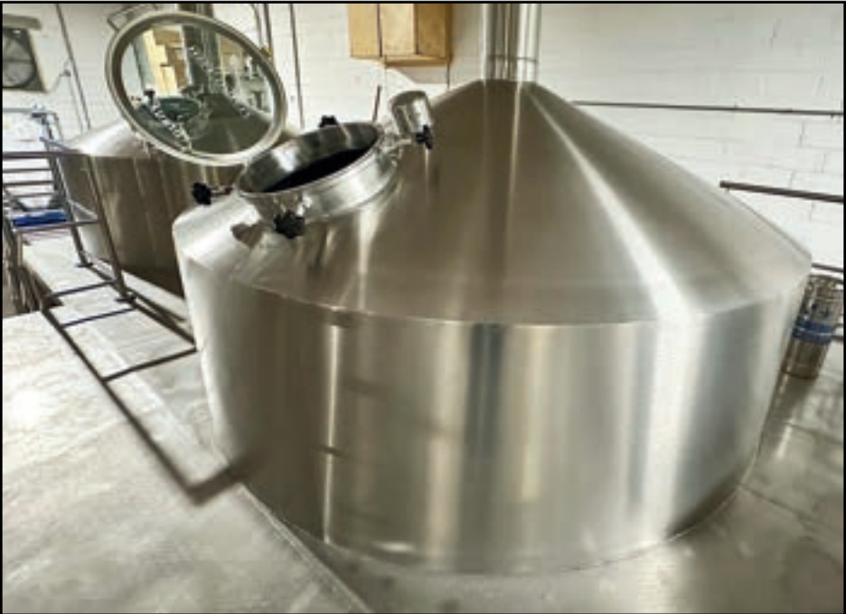
MASH KETTLE/LAUTERN TUN FROM BREW HOUSE