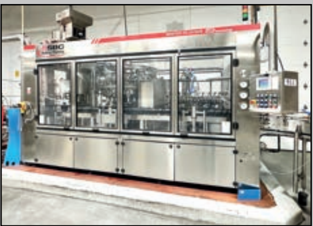
SBC MASTER RS 24-24-6 PLC BOTTLING LINE