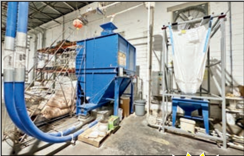
TAUBER GRAIN MILL WITH SUPER SACK UNLOADER

INSPECTION: Monday, February 12th Beginning at 9:00 A.M. ET