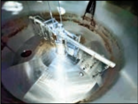
MASH TANK – INTERIOR VIEW