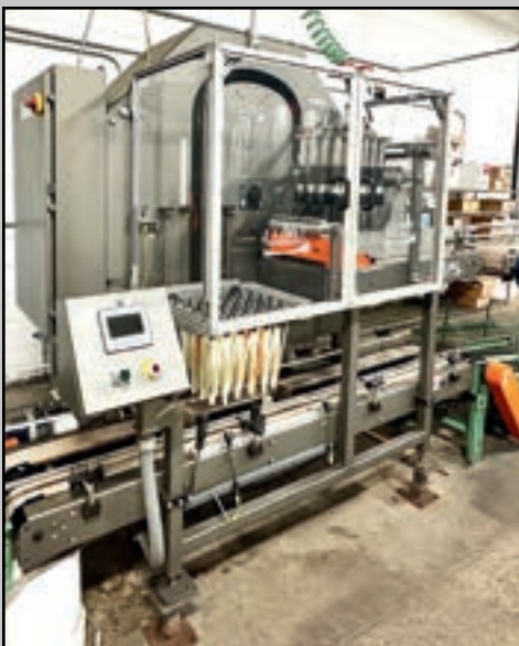
CLIMAX CASE PACKER