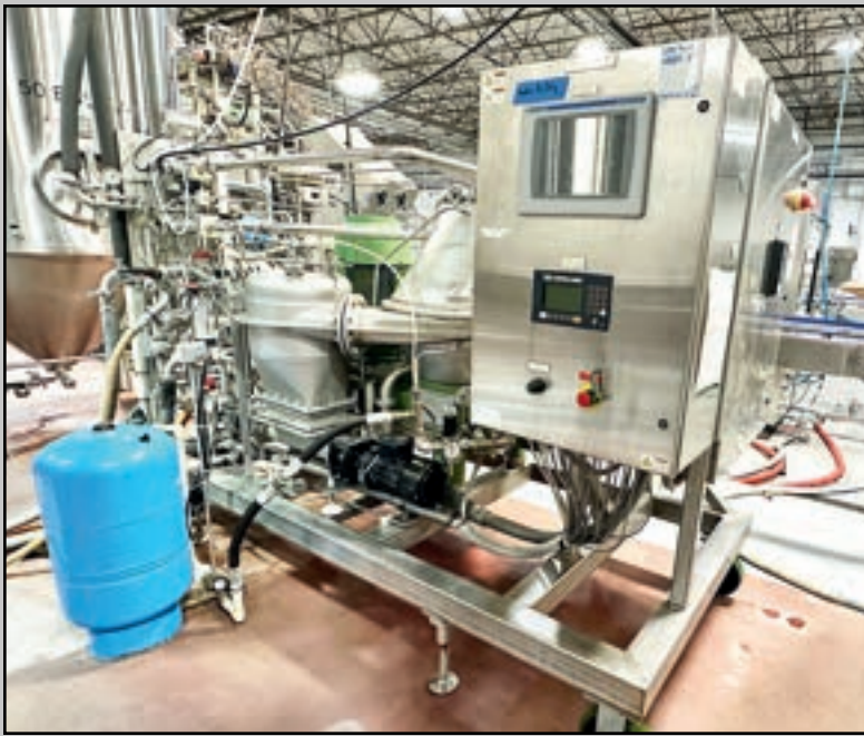
GEA WESTFALIA CLARIFIER SKID W/PLC CONTROLS