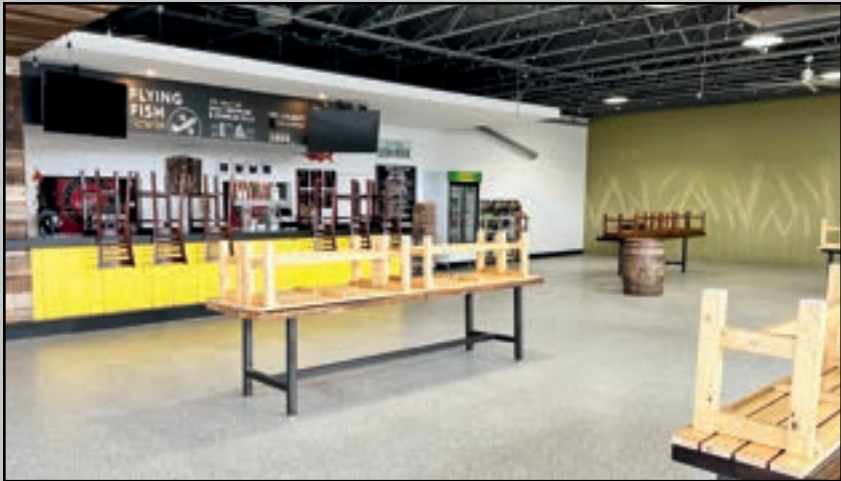
TAP ROOM INTERIOR