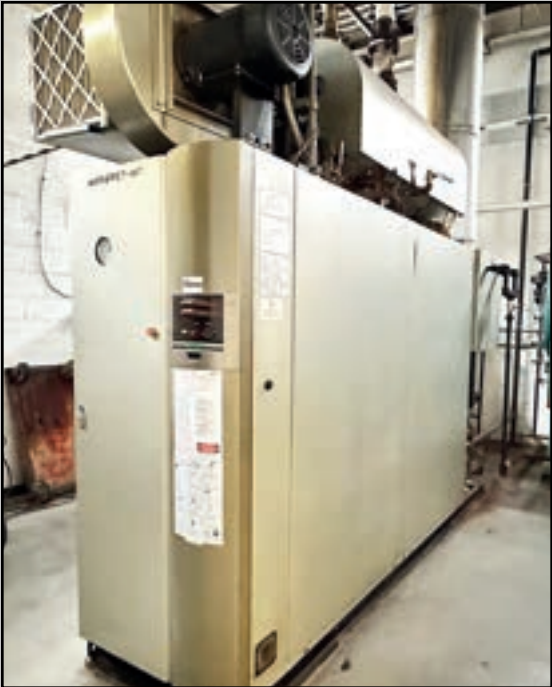
MIURA LOW NOX GAS STEAM BOILER