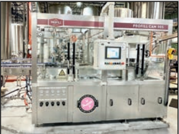
PROFILL CAN 90S CAN FILLER-SEAMER