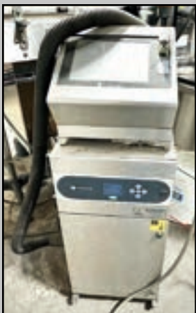
DOMINO LASER ENCODER