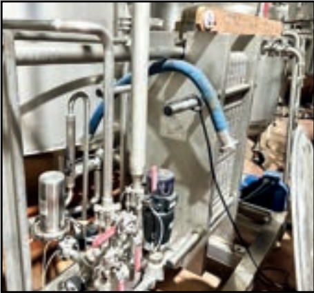
GEA HEAT EXCHANGER SKID FOR PILOT BREW HOUSE