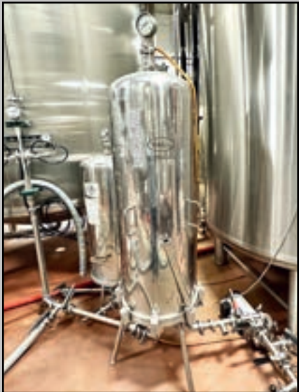
PALL SUPRADISC WITH 3 HP PUMP