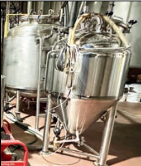
PROCESSING TANKS FOR PILOT BREW HOUSE