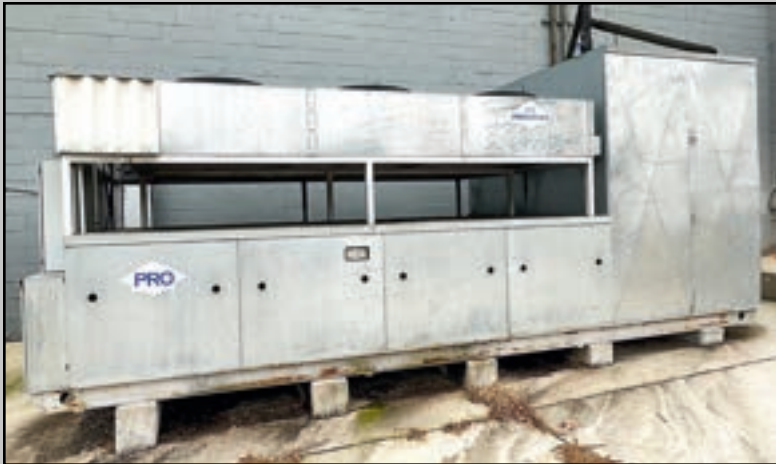
PRO PROFORMER CO2 WATER CHILLER