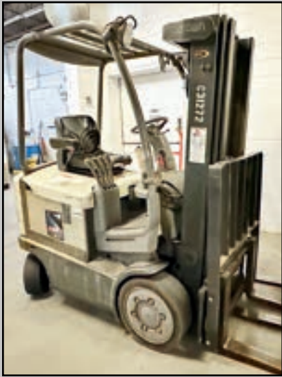
(1 OF 2) CROWN ELECTRIC FORKLIFTS