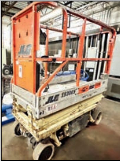
JLG SCISSOR MANLIFT