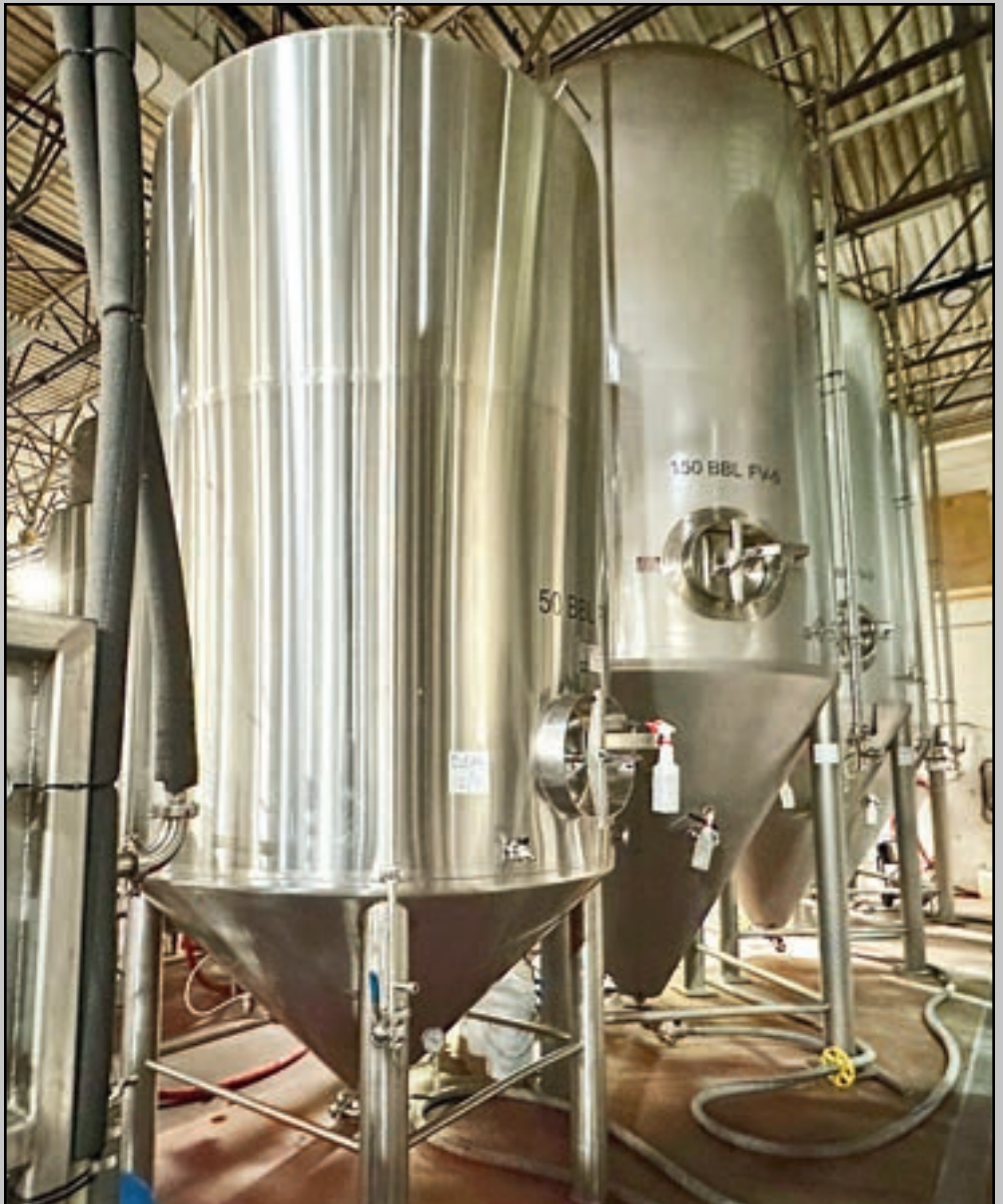
(SAMPLE) 50 - 150 BBL MUELLER FERMENTATION TANKS

GREAT OPPORTUNITY TO PURCHASE AS A TURNKEY OPPORTUNITY IN A VERY DESIRABLE LOCATION