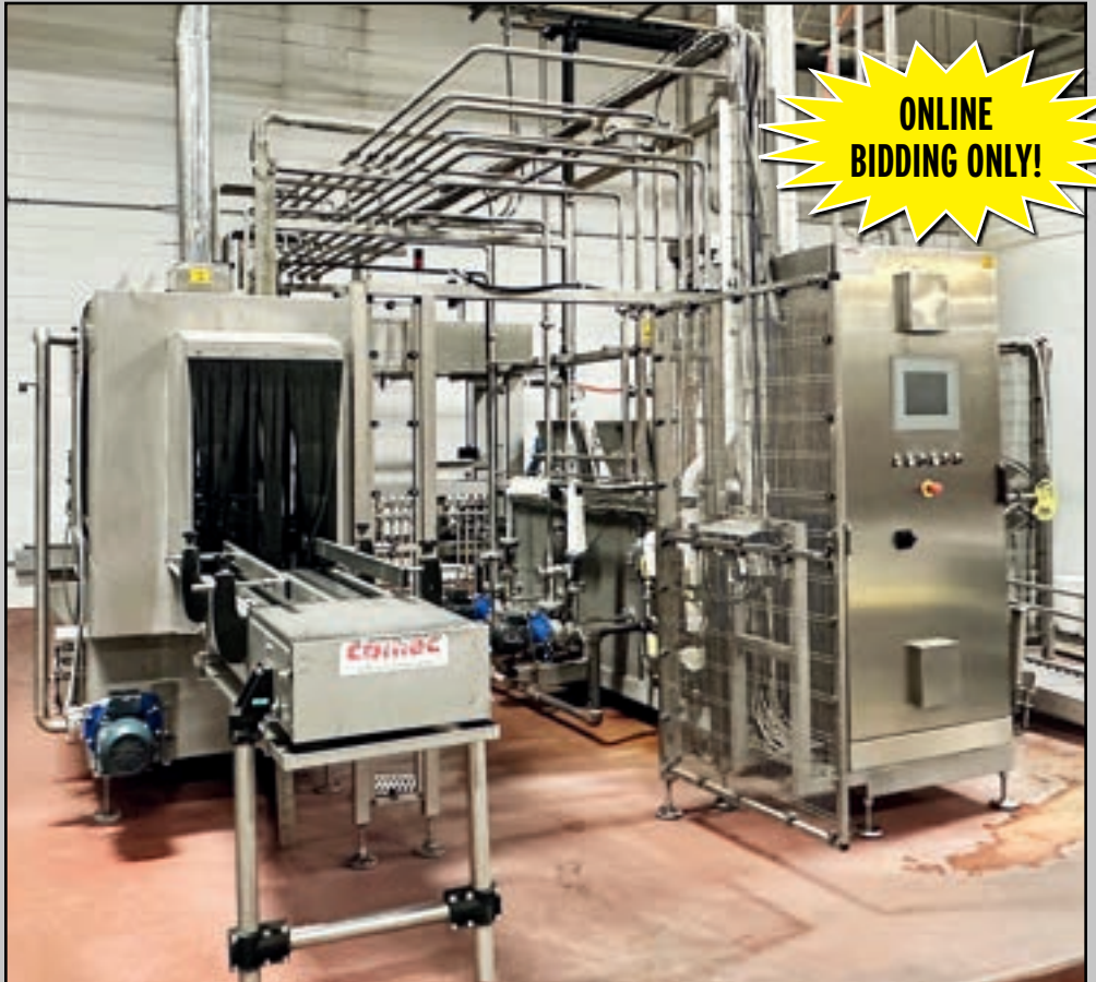
COMAC KEG RINSING AND FILLING LINE