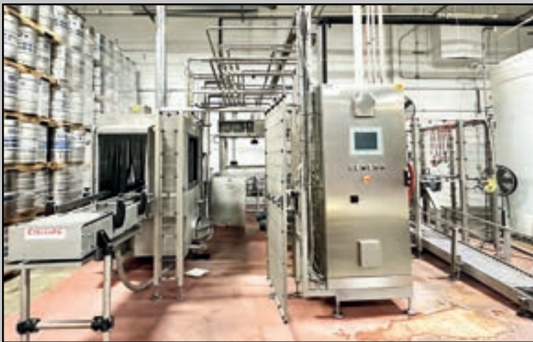
COMAC KEG RINSING AND FILLING LINE