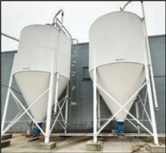
(2) GRAIN SILOS