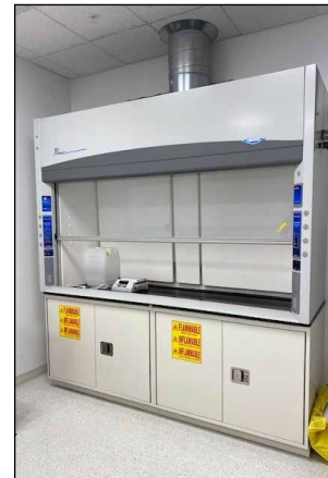
VWT Fume Hood