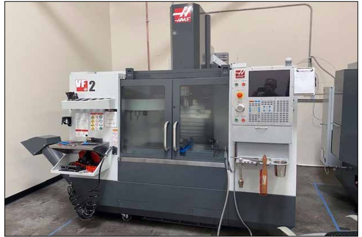
Haas VF2 CNC Vertical Machining Center