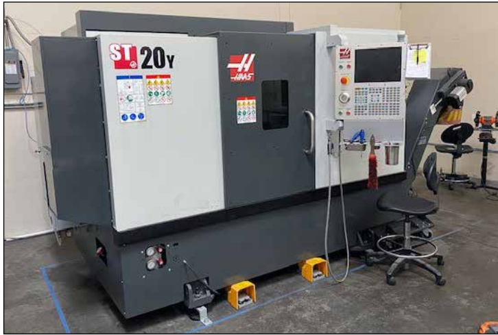
Haas SL-20Y CNC Turning Center