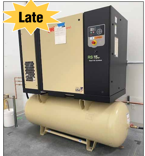
Ingersoll Rand Air Compressor