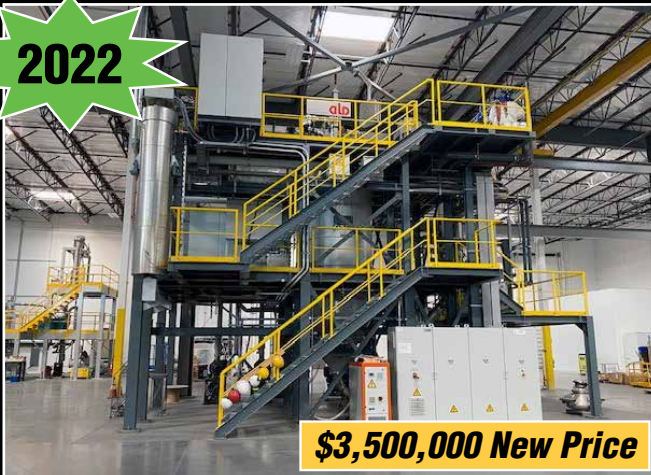
Views of ALD Viga 35 Vacuum Gas Atomizer