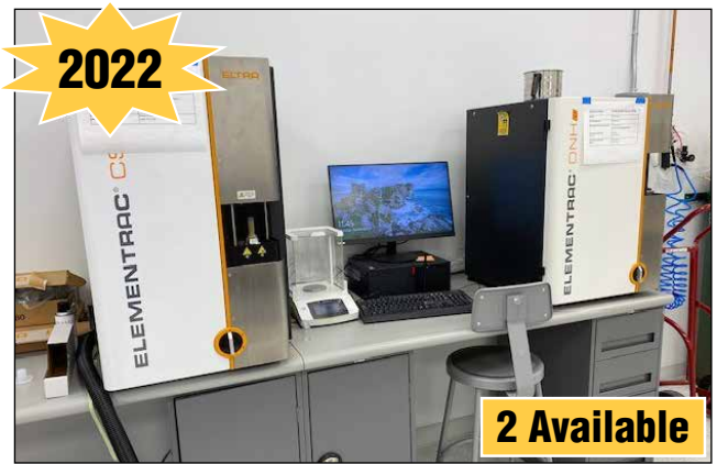
Elementrac Gas Analyzers

2022 Fluid Chiller 2022 Brabender Separator 2022 Production Piping System 2022 Genie Aerial Platform Hyster Forklift 2022 WW Water Treatment System Vac-U-Max Powder Conveying System Wintex Vacuum Pump Brabender Single Screw Digital High Precision Feeder Mokon Hot Oil Heater Virto 48" Screener/Separator