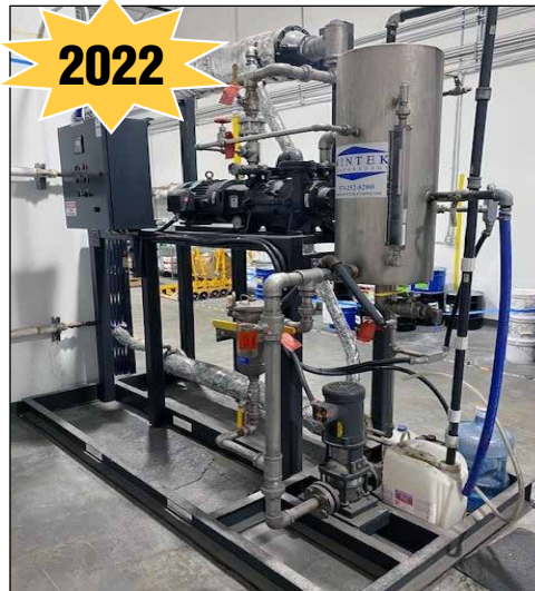
Wintek Solvant Recovery System