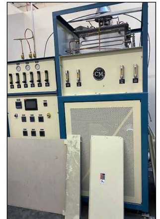
CM Bottom Loading Hydrogen Furnace