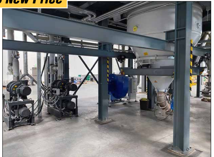
Views of ALD Viga 35 Vacuum Gas Atomizer