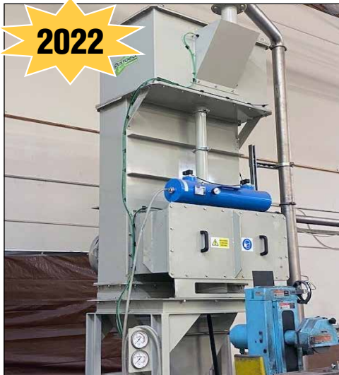
Dust Check Dust Collector