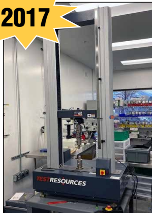
Test Resources 313N Universal Dual Column Tester