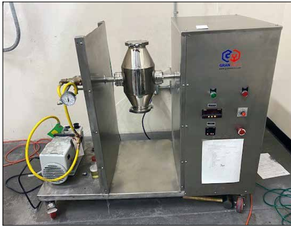
Gram Mech Mixer

Haas VF2 CNC Vertical Machining Center , (Located at: 41400 Christy St, Fremont, CA)