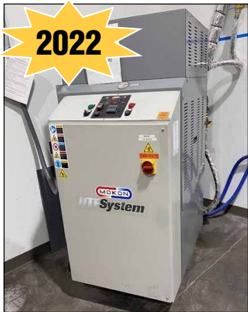
Mokon Oil Heater