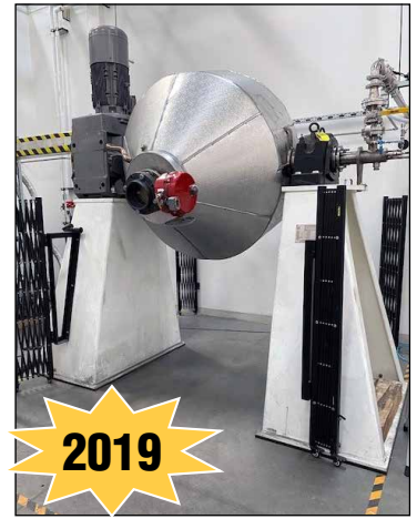
All-Weld Patterson Double Cone Vacuum Dryer