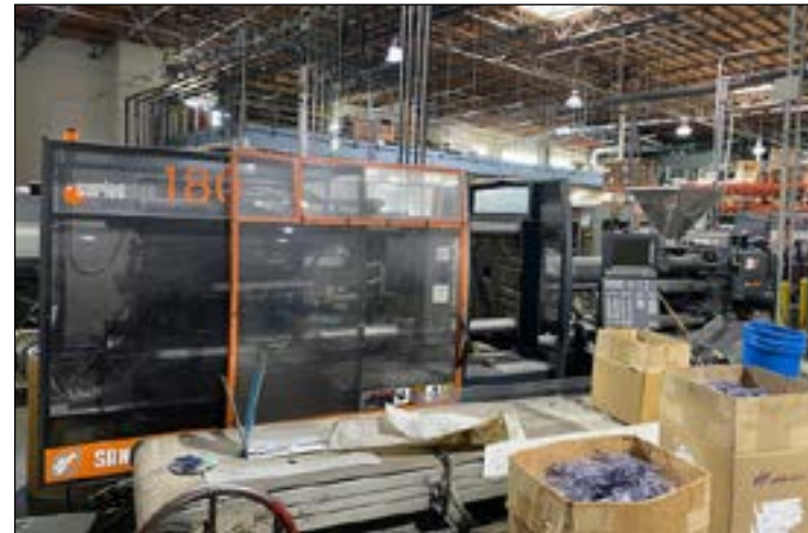
Sandretto 180 Injection Molder