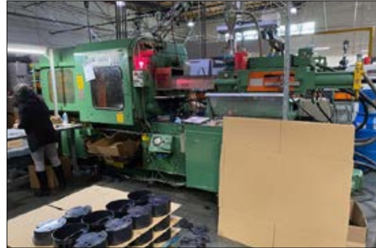
Van Dorn 300 Injection Molder