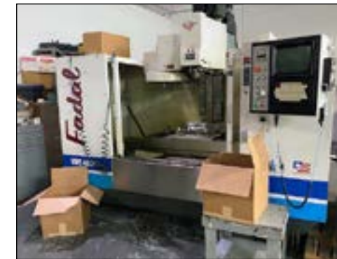
Fadal VMC4020 Vertical CNC Machine Center