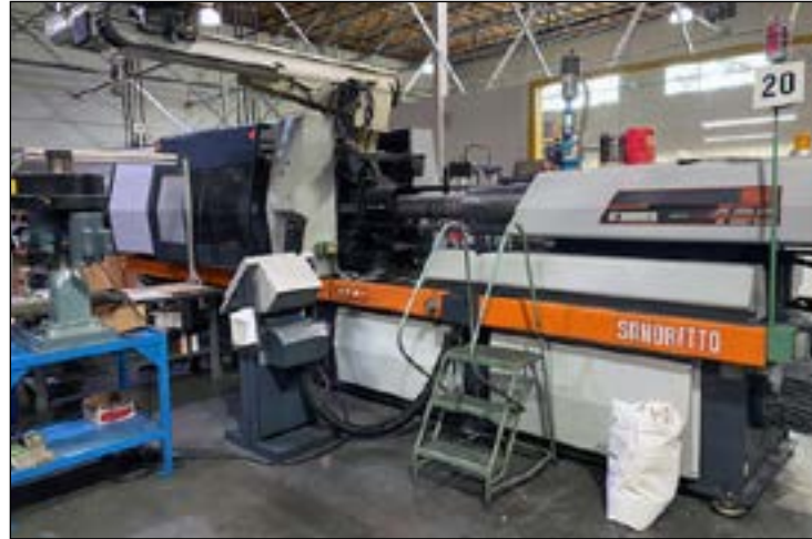
Sandretto 400 Injection Molder

Arburg Allrounder 220-90-350 Injection Molder