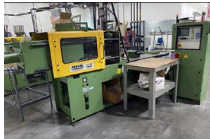
Arburg 270M Injection Molder