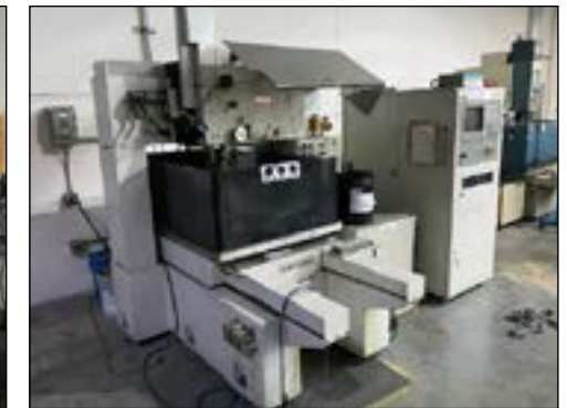
Mitsubishi Wire EDM