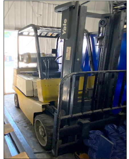
Yale 5,000 Lb. Capacity LPG Forklift