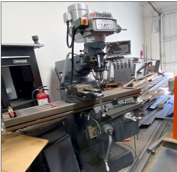
Trump 3HP Variable Speed Vertical Mill