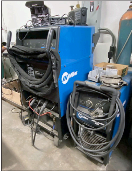
Partial View of Welders

Yale Mod. GC050RDJUA083, 5,000lb. LPG Forklift, w/Solid Tires and Overhead Guard, S/N N409210