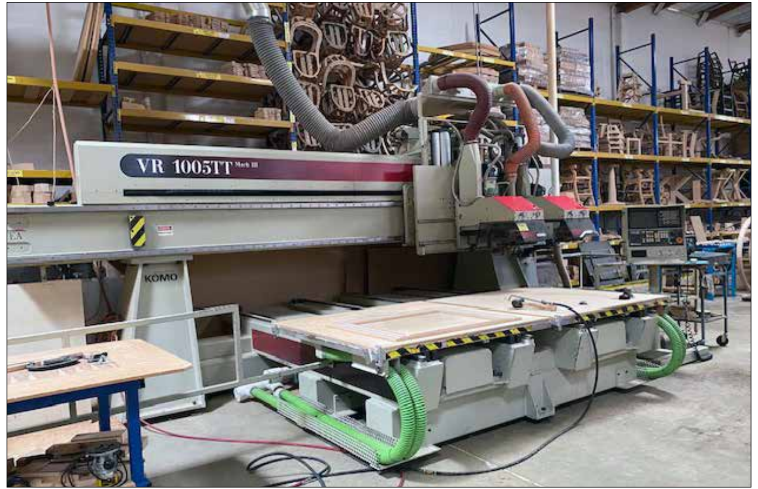
Komo Mod. VR 1005 TT Mach TTT Vertical CNC Router

C.R. Onsrud Mod. 122C16C Vertical CNC Router , w/AMC Computer Controls, Single Spindle, Twin Work Tables, 60 x 60 12-Position Tool Changer, Vacuum Pumps