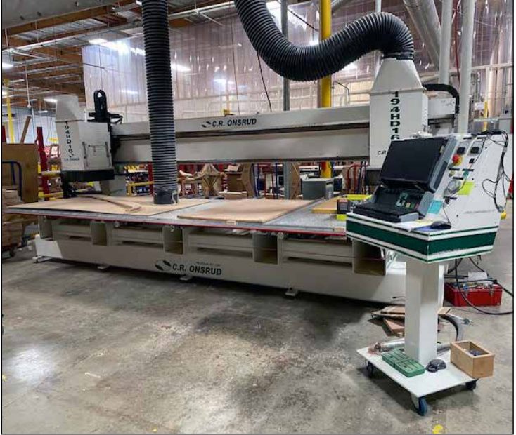
C.R. Onsrud Mod. 194HD16 Vertical CNC Router