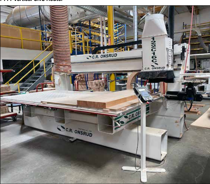
C.R. Onsrud Mod. 122C16C Vertical CNC Router

www.tauberaronsinc.com | 323.851.2008 | 888.648.2249