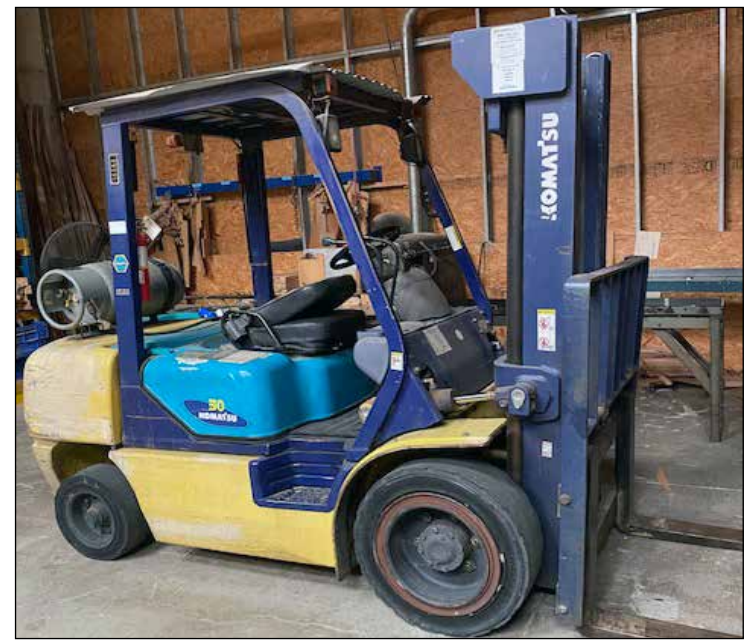
Komatsu 30, 6,000lb. LPG Forklift

Komatsu 30, 6,000lb. LPG Forklift, w/Solid Tires Mitsubishi FGC20, 4,000lb. LPG Forklift, S/N AF82B-05141 Mitsubishi 3,000lb. Order Picker