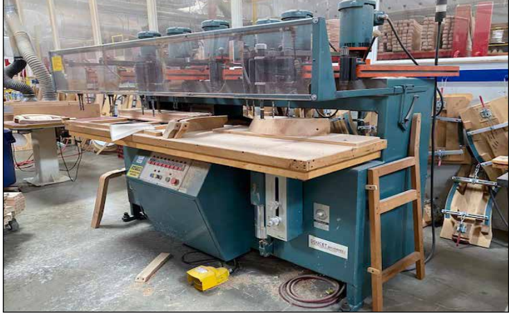
Doucet Mod. J3H-7 Multi Spindle Vertical Boring Machine