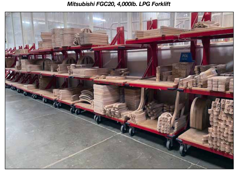
(Approx. 100) 3-Shelf Product Carts

Wednesday, September 20th thur Friday, September 29th, from 8:00am to 4:00pm PT.