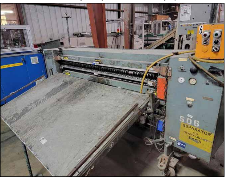
1984 Gloucester Engineering Co. Model 423, 70" Bag Separator