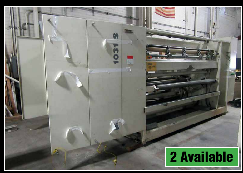
Battenfeld Gloucester Mod. 1031S Winder