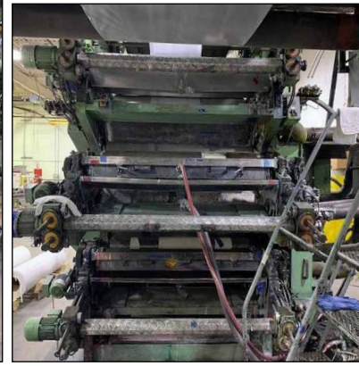
W&H Olympia, Mod. 150, 6-Color Printing Press