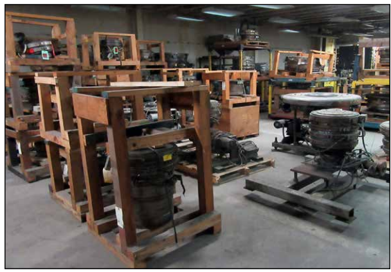
Partial View of Dies

(Approx. 50) Assorted Air Ring Die, Assorted Sizes & Layers (Approx. 20) Sheet Dies, Assorted Sizes