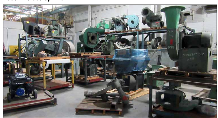
Overall View of Blowers