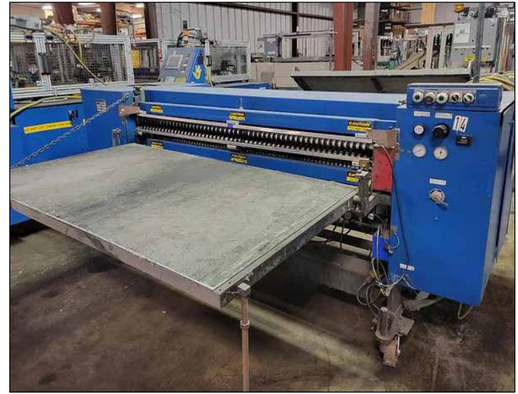
1987 Gloucester Engineering Co. Model 423, 70" Bag Separator