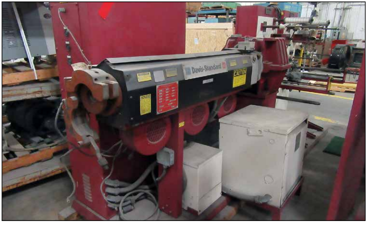
Partial View of David Standard Zipperline