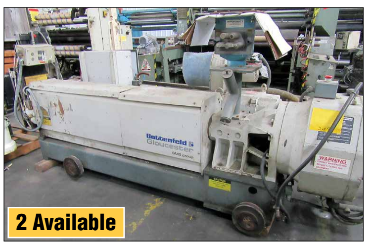
Battenfeld Gloucester 1031S Winder

Maguire ML-1, Color Blender, w/AEC Whitlock Hoppers, Controls