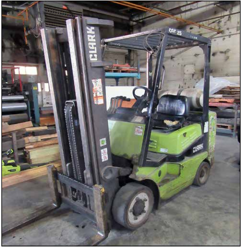
Clark CGC25, 8,000 Lb. Cap. LPG Forklift