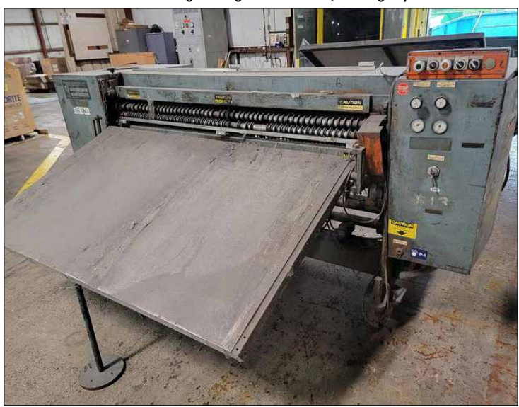
1985 Gloucester Engineering Co. Model 423, 70" Bag Separator