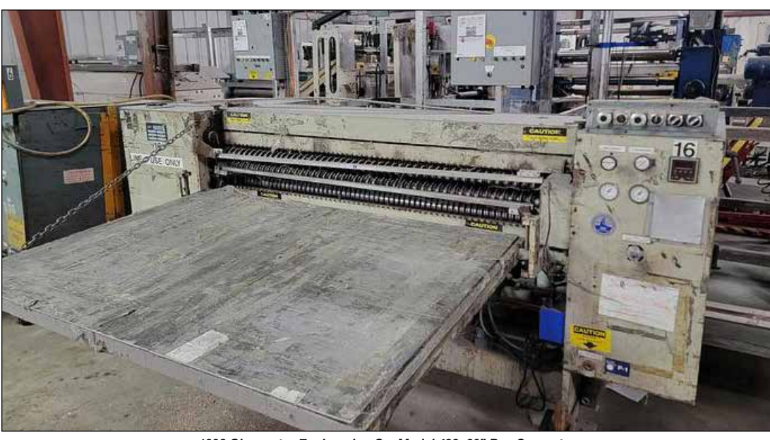
1992 Gloucester Engineering Co. Model 423, 60" Bag Separator