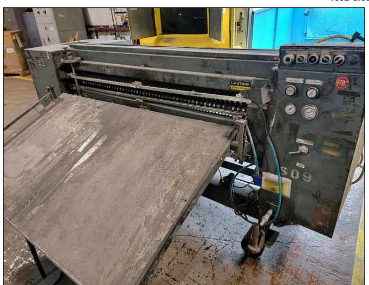
1988 Gloucester Engineering Co. Model 423, 70" Bag Separator