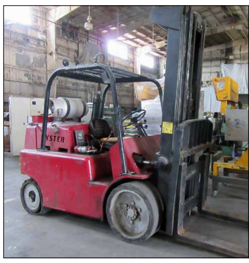
Hyster 5150A, 15,000 Lb. Cap. LPG Forklift