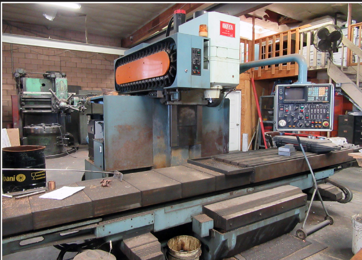
Ooya Mod. RE-IMV, CNC Vertical Machine Center