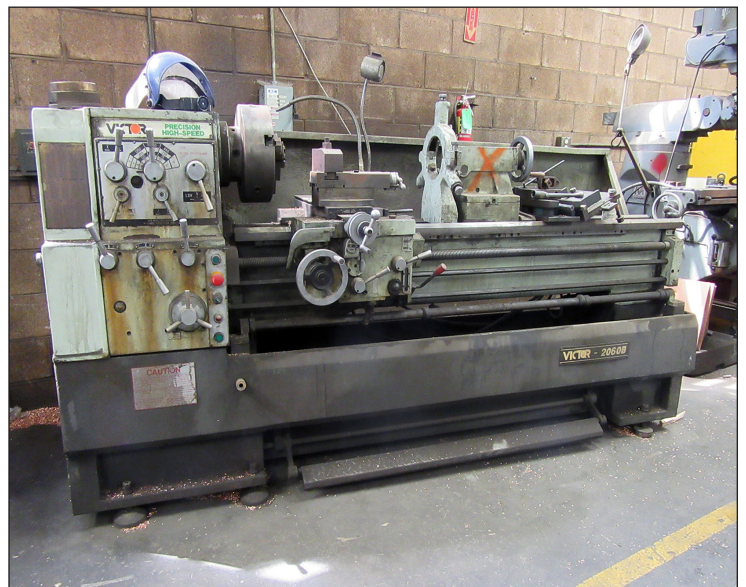
Victor 2060B, 20" x 60" Precision High Speed Engine Lathe