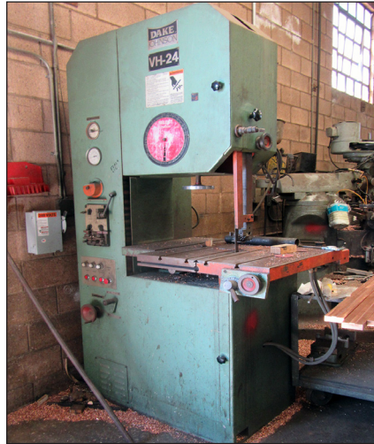
Dake/Johnson VH-24, 24" Vertical Band Saw

Cincinnati Bickford Radial Arm Drill, 8" Column x 4' Arm • Drooprein Lathe, w/6-Jaw Chuck • Super Max Variable Speed Vertical Mill, w/9" x 48" Table • Ranco Vertical Mill, w/Spirit DROs, 9" x 42" PF Table • Heavy Duty Hydraulic H-Frame Press • H-Frame Press • Dake/Johnson VH-24, 24" Vertical Band Saw, w/Butt Welder & Grinding Attachment • Delta Shop Master Bench Type Vertical Band Saw • 16" Disc Grinder • Ped. Type Carbide Dbl. End Grinder • (2) Pedestal Type Dbl. End Grinders • Sears/Craftsman Contractors Series 2hp, 20" Industrial Pedestal Drill Press • Miller Synchrowave 350 Constant Current AC/DC Arc Welding Power Source • Miller Millermatic 200 Constant Potential DC Arc Welding Power Source • Boom, w/Chain Hoist • 4,000lb. Gantry Crane, w/Electric Chain Hoist • Toledo 500lb. Platform Scale