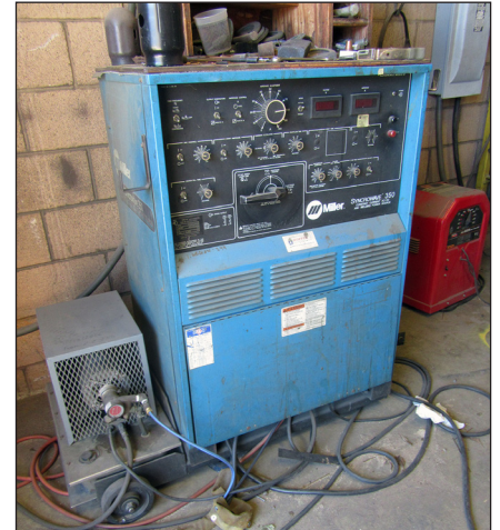
Miller Synchrowave 350 Constant Current AC/DC Arc Welding Power Source