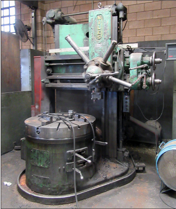
Niles Mod. FPW Vertical Turret Lathe

Niles Mod. FPW Vertical Turret Lathe, w/40" Chuck, 5-Position Turret, S/N 23944