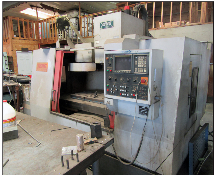
Yang Mod. SMV-1000, CNC Vertical Machine Center

Victor 2060B, 20" x 60" Precision High Speed Engine Lathe, w/3-Jaw Chuck, Tail Stock, Tool Holder, Steady Rest