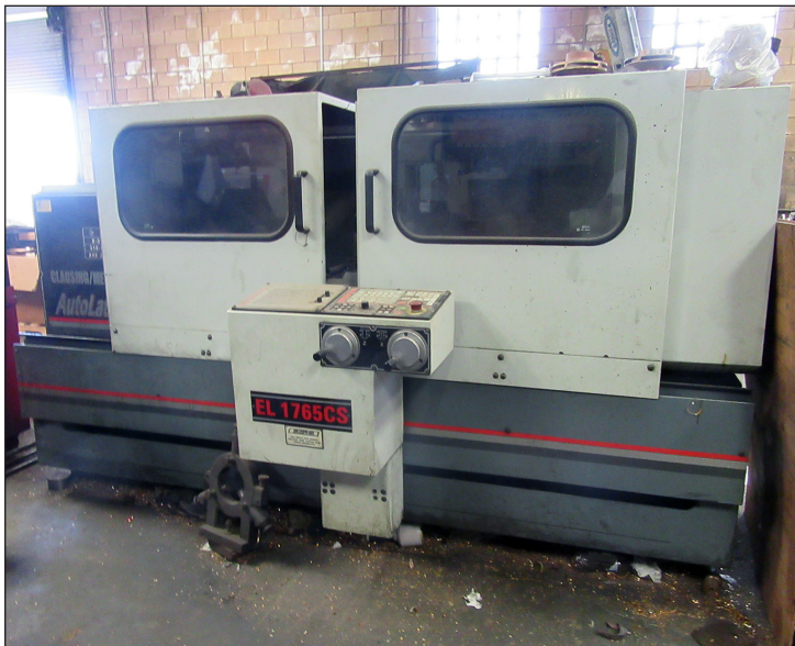
Clausing/Metosa Mod. EL 1765 CS Auto Lathe