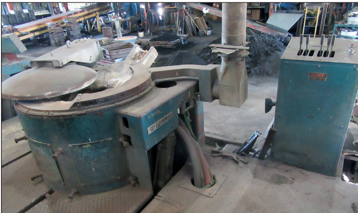
Partial View of Pillar Furnace System

Pillar Induction Lift Coil Type, 325lb Capacity Bronze Melting Furnace, 250kw, Electric Induction Heated