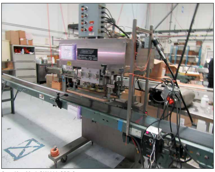
Sure Kap Mod. SK6000-SPP Capper

(5) Video Jet Excell Series 100 Printers Domino A300 Printer Schafer HM-9 Hot Melt Coater Profill Jet 2X, Twin-Station Filler Pad Print Mod. DP-1000 Dryer