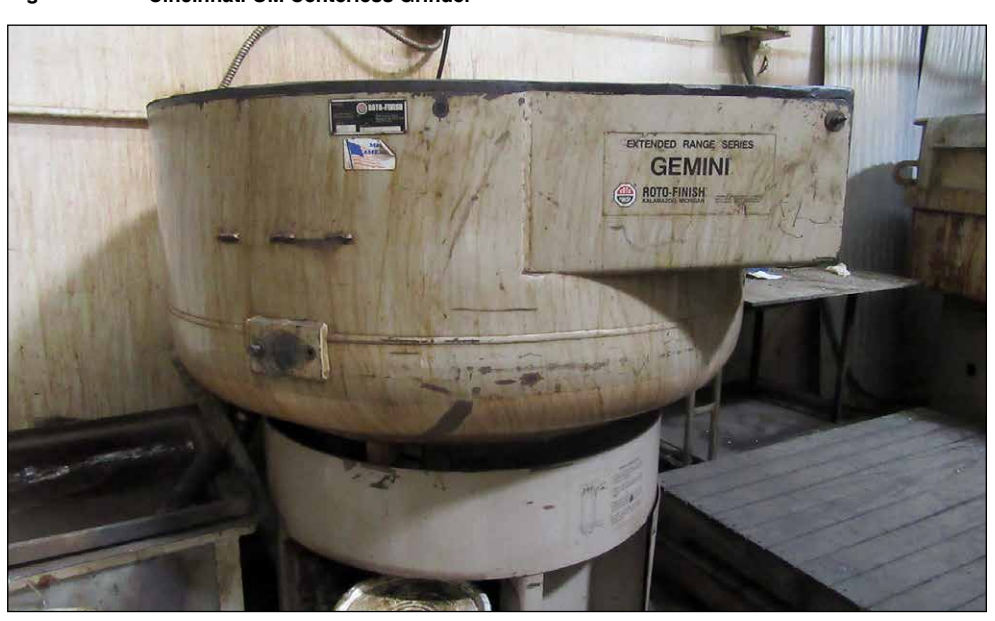
Roto-Finish Gemini Extended Range Series 58" Rotary Tumbler