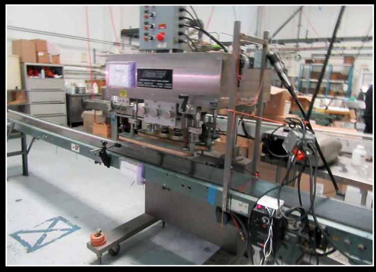
Sure Cap SK6000-SP Capper