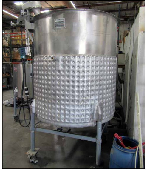
Perma-San Mod. Jove, 550 Gal. S.S. Dimple Jacket Holding Tank