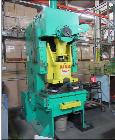
Aida PC-7(II), 75-Ton SSSL Punch Press

Fosdick Mod. 5VS, Sensitive Drill Press Emo Bevelthyme Drill Press 1" x 8" Combo Belt and Disc Sander/Grinder Baldor 3/4hp Dbl. End Grinder (4) Ped. Drill Presses (1997) Fipi Mod. AF-95, Die Clicker, S/N 231A20035 Shuttleworth Power Conveyors