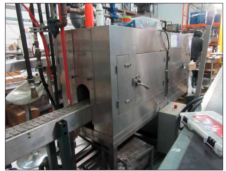
Tri Pack Mod. LSA-160 Filler