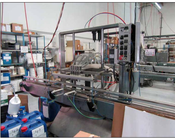
5-Station Filling Line