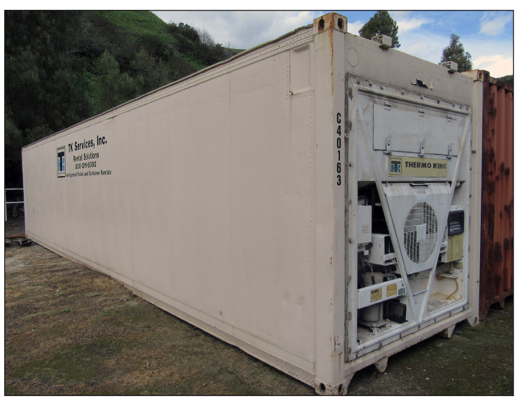
Thermal King Mod. CSR 40-4, 40' Refrigerated Container

Martin 40' Storage Container, w/(3) Roll-Up Doors