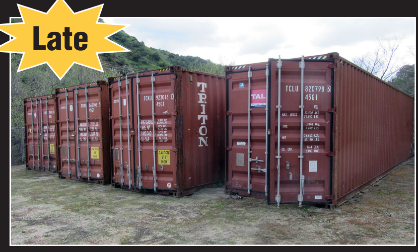
Partial View of Shipping Containers