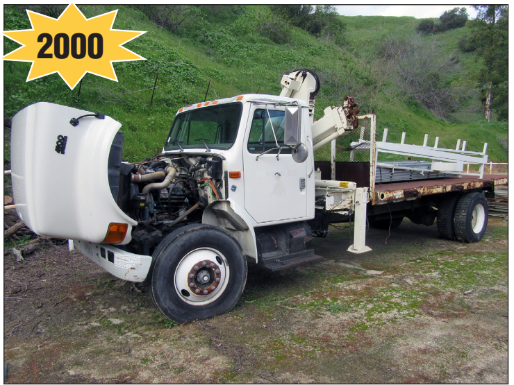
International Navistar 4900 DT 466E, Mod. 4900 4 x 2, 18' Flat Bed

2000 International Navistar 4900 DT 466E, Mod. 4900 4 x 2, 18' Flat Bed, w/National Mod. N50 Boom Crane, VIN: 1HTSDAAN51H344636