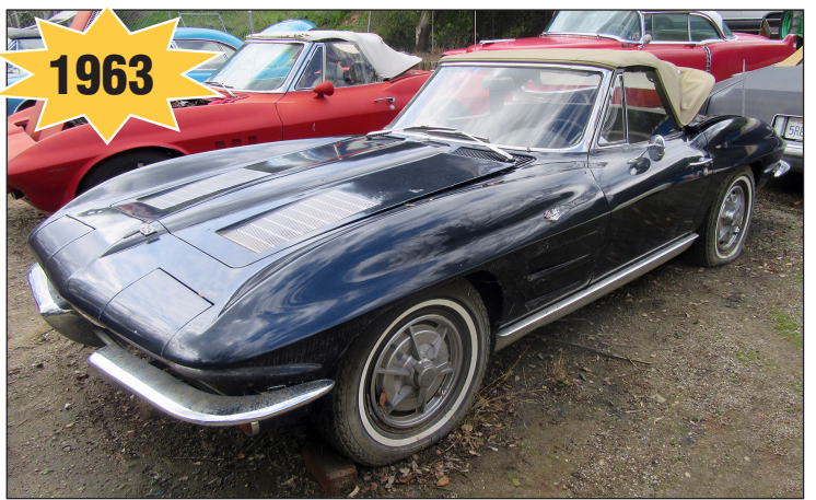
Chevrolet Corvette Sting Ray Convertible