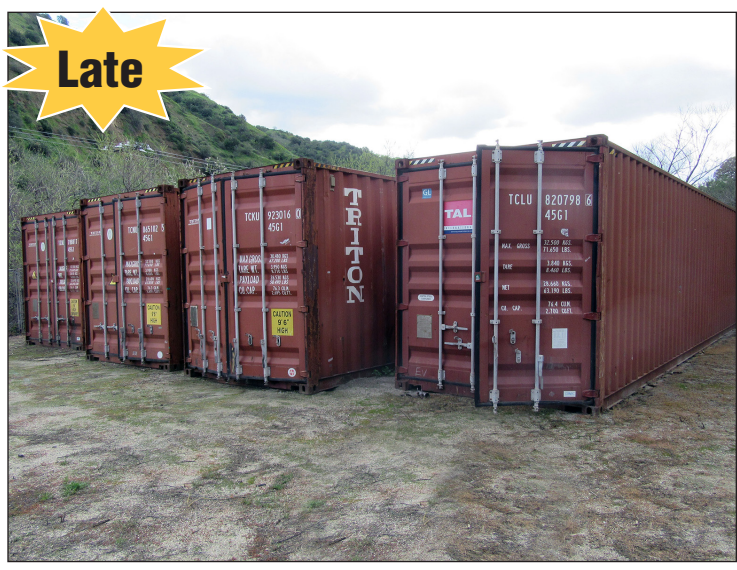
Partial View of Shipping Containers