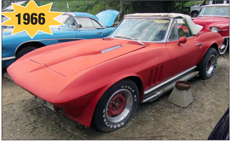
Chevrolet Corvette Sting Ray Convertible