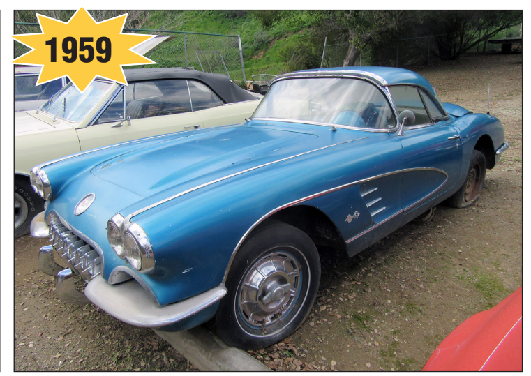
Chevrolet Corvette Convertible Hard Top