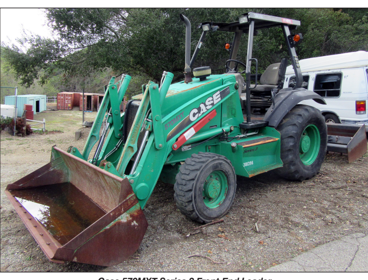
Case 570MXT Series 3 Front End Loader