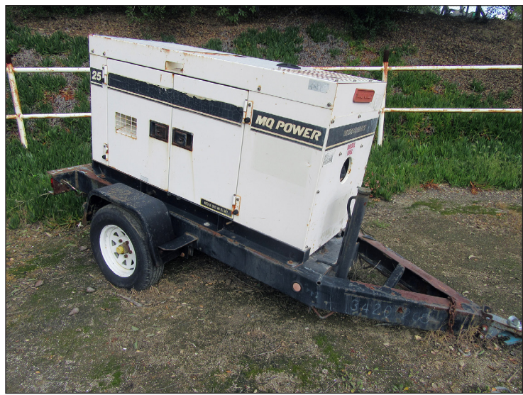
MQ Power Whisper Mod. DCA 25SS102 Watt 25KVA Diesel Powered AC Generator

MQ Power Whisper Mod. DCA 25SS102 Watt 25KVA Diesel Powered AC Generator, \rm S/N~3778088H