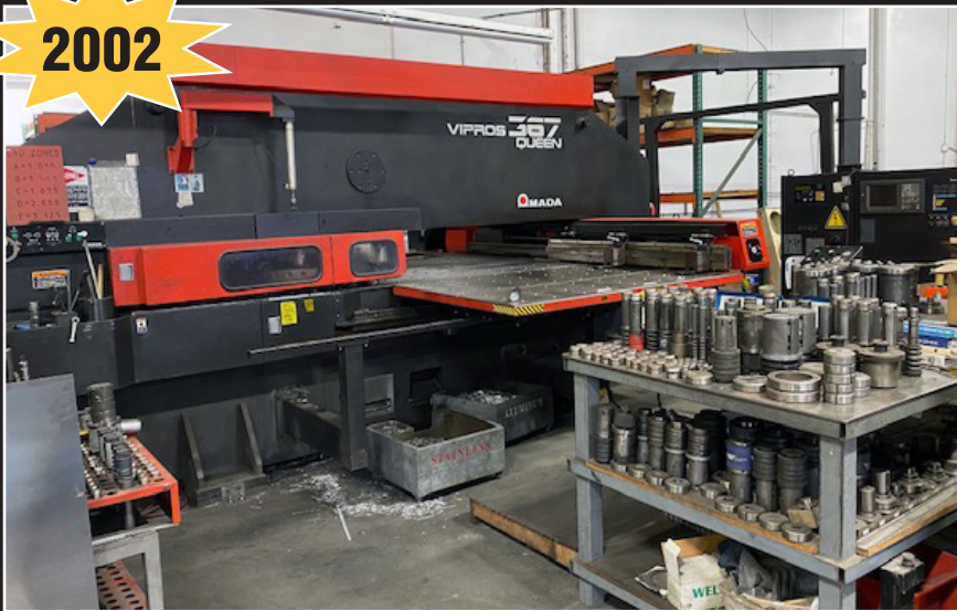
Amada Vipros 367 CNC Turret Fabricator