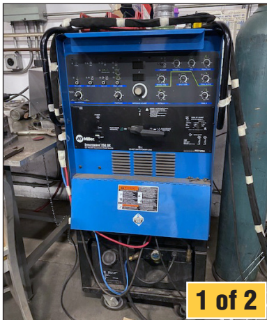
Miller Synchrowave 250 DX Welder

Lincoln Squarewave Tig 275, 275 Amp Tig Welder, w/Magnum System, S/N U1001127936