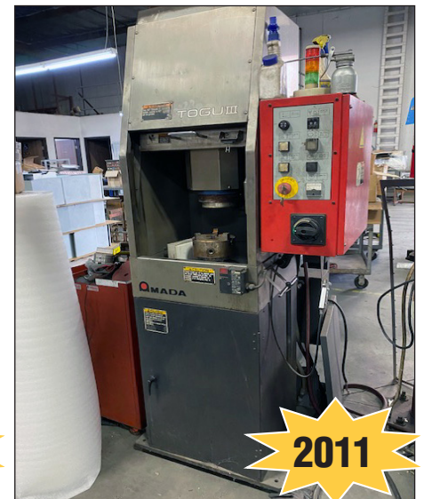
Amada Togo III-US Automatic Grinding Machine

2011 Amada Togo III-US Automatic Grinding Machine , S/N 30230096