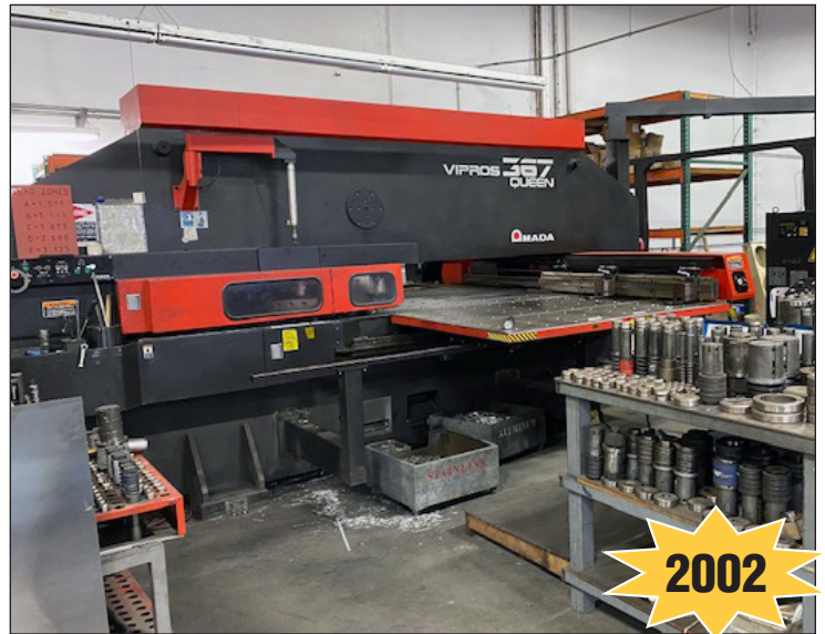
Amada Vipros 367 CNC Turret Fabricator