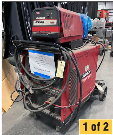
Lincoln Squarewave 275 Tig Welder