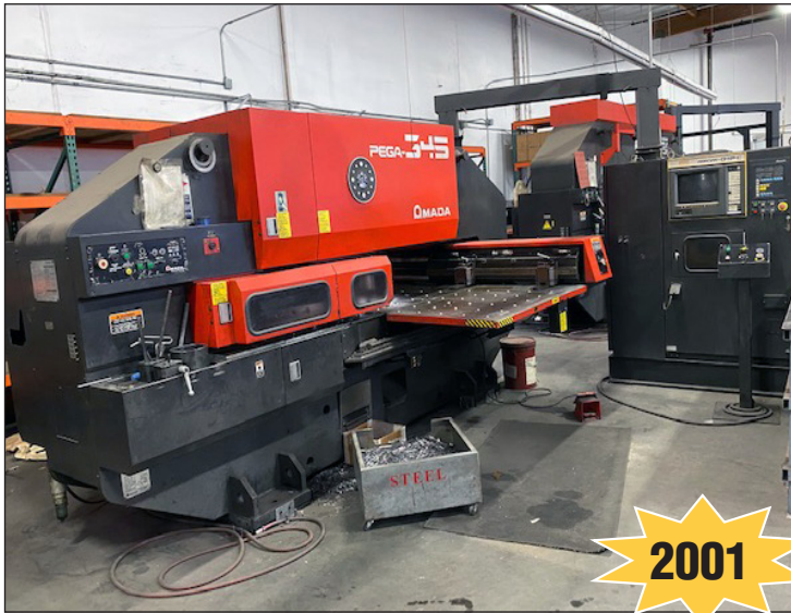
Amada Pega-345 CNC Turret Fabricator

Aploo Computer w/Software & Solidworks Computer w/Software