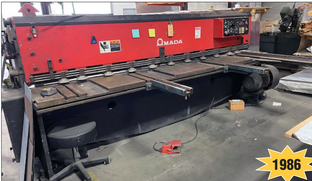
Amada Mod. M2545, 10' Power Gap Shear

1986 Amada Mod. M2545, 10' Power Gap Shear , w/FOPBG Front Extensions, S/N 25452884