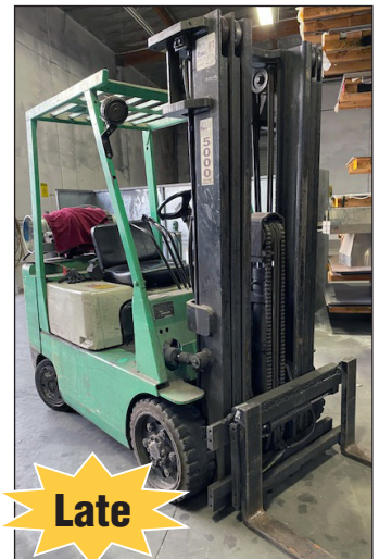
Mitsubishi 5,000 Lb. Cap. LPG Forklift