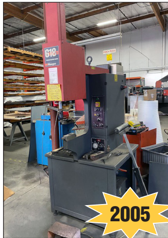
Haeger 618 Plus-L Fastener Insertion System