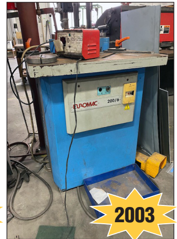
Euromac Mod. 200/6 Corner Notcher