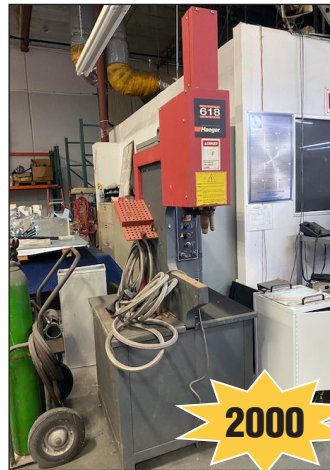
Haeger 618-1H Insertion Press