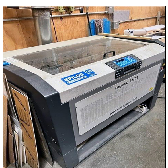
Epilog Legend 36EXT

For An Auction Calendar Visit Our Website: www.tauberaronsinc.com 323-851-2008 • 888-648-2249