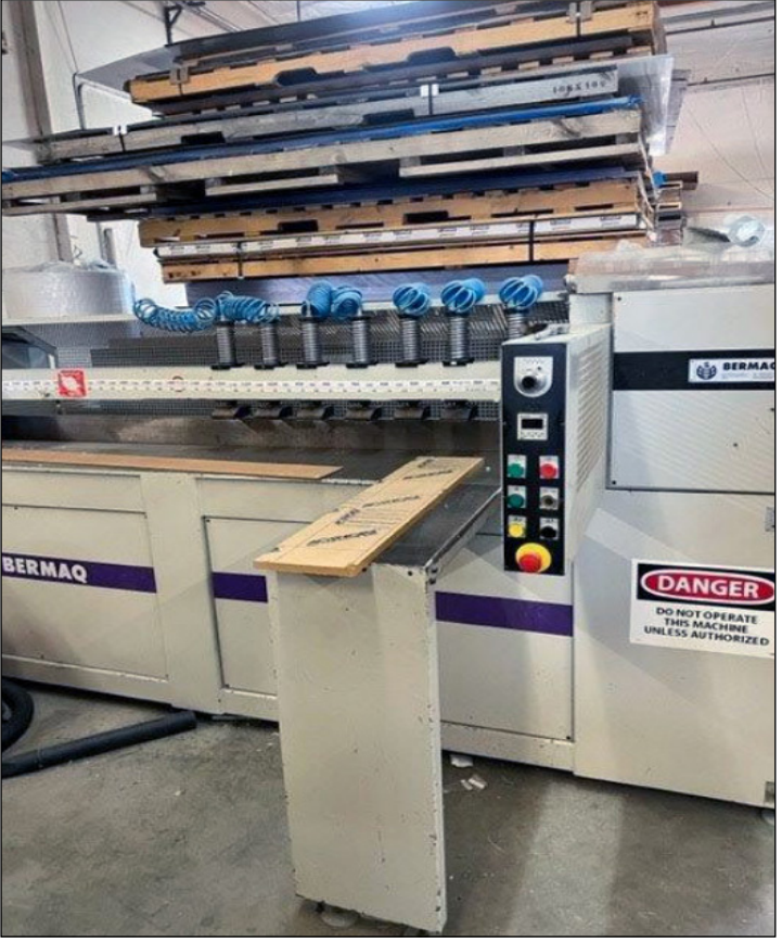
Bermaq Mod. Bermaq-AMI250 Edge Polishing Machine