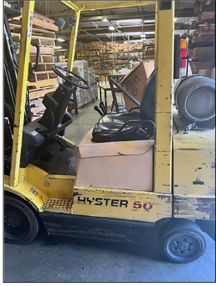
Hyster Mod. S50XM Forklift