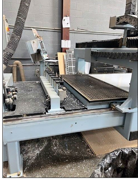
DMS Mod. 35B-5-10-10SCXLXX CNC Router

Garner Denver Mod. FEC99,I01 Compressor Great Lakes Mod. ERF-125A-116 Air Dryer