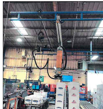
Gorber Crane UniMove Vacuum Lifter