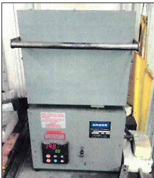
Cress Heat Treat Oven