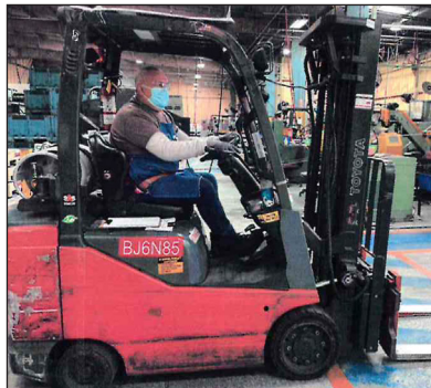
Toyota 8FGCSUZO, 3,989 LBS Cap. Forklift