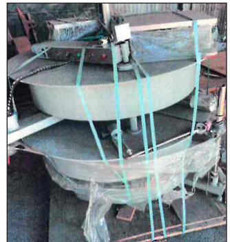
Xiamen 500 LBS Strap Table Decoiler