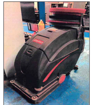
Dayton Floor Scrubber