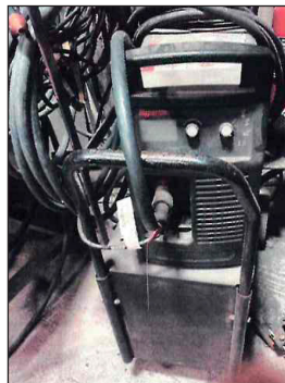
Hypertherm Plasma Cutter