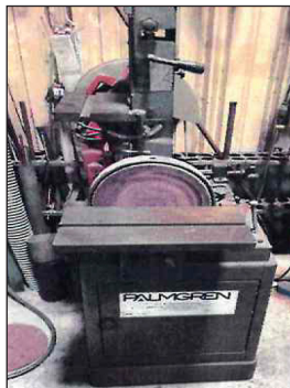
Palmgren Belt & Disc Sander