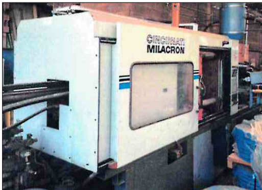
Cincinnati Milacron Injection Machine

Precision Mod. PCW-1200-480, Electric Boiler, S/N 22T23 5' Steel Parts Conveyor 10' x 10" Motorized Incline Conveyor 5hp VFD Controlled Wire Draw (3) Xiamen 500 LBS Strap Table Decoilers Titan Pallet Jack Table Product Stacker Non-Motorized Rotating Table 1/2 Ton Swing Crane, w/1/2 Ton Electric Hoist (3) Wesco Pallet Jacks Water Maze Water Treatment System ITT Heat Exchanger Hot Water Parts Washer Tunnel