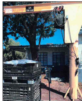
1/2 Ton Swing Crane