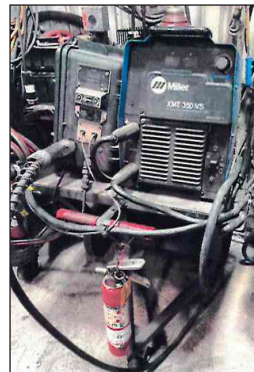
Miller MIG Welder