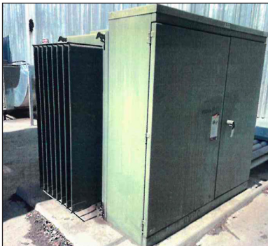
ABB 1500 KVA Transformer

FEATURING: Welding, Injection Molding, Forklift, Engine Lathe, Transformers, Misc. Equipment