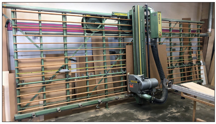
Striebog Standard 5192 A/M/9, 87" Vertical Panel Saw