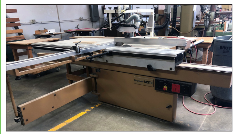
Rockwell/SCMi Sliding Bed Table Saw

Rockwell Single Spindle Shaper Ritter Mod. B1000, 4-Spindle Sander Mapla MicroMat Drill Press, w/Fixture JDS Multi Router 8' Foot Shear Paint Booth, w/Spray Guns Delta 1" Bend Sander 24' Storage Container Wood Clamps, Vises, Benches, Cabinets & Hand Tools