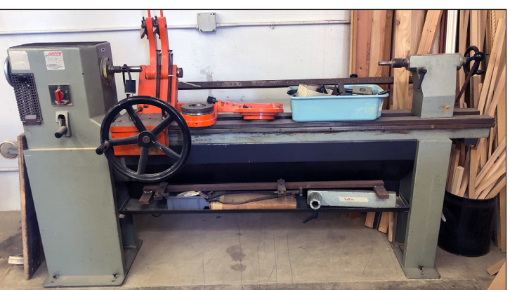
Hapfo Type AP 5000-M Wood Lathe