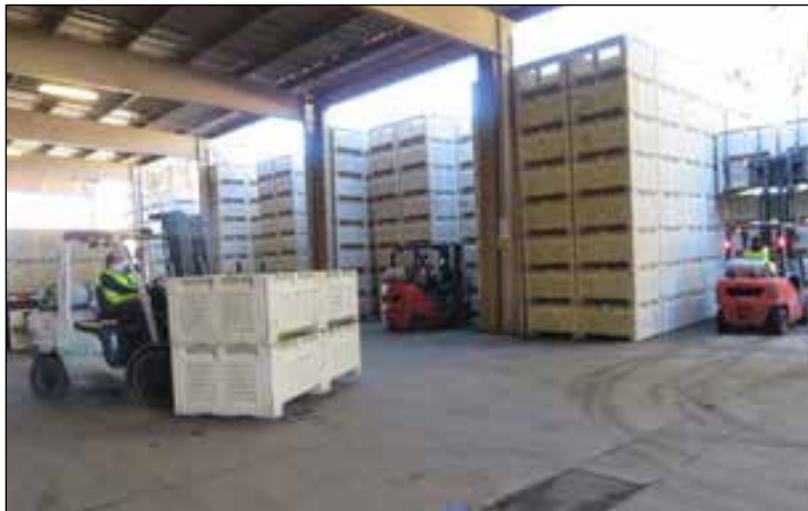
View of Forklifts