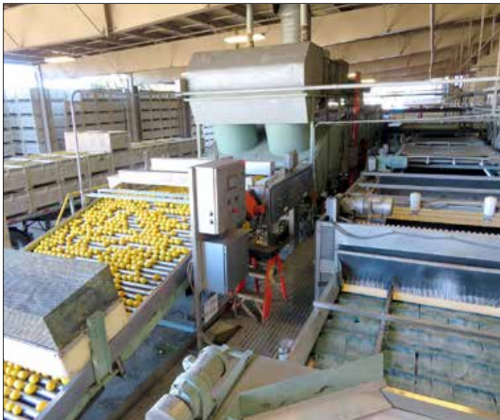
Partial View of Brush Drying

16 Pin Wash Bed to Resnor 1.2 MM/BTU Dryer & Conveyor to Sorter