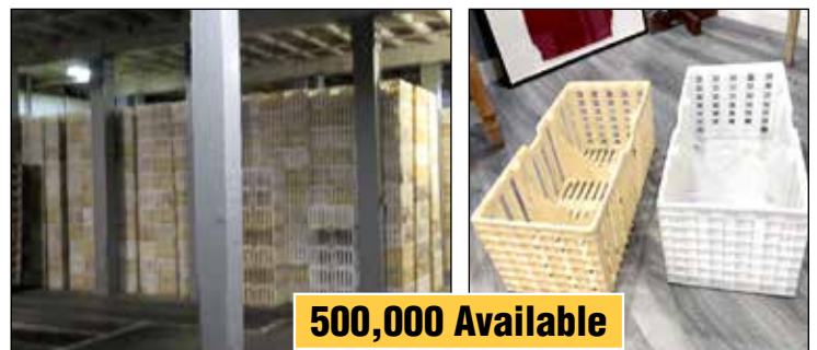
Partial View of Plastic Totes

(Approximately 500,000) 50 Lb. Lemon Box – HDPE Totes; 26" L x 13" W x 10" T, Solid and Slate Bottom; Material is FDA Compliant HDPE