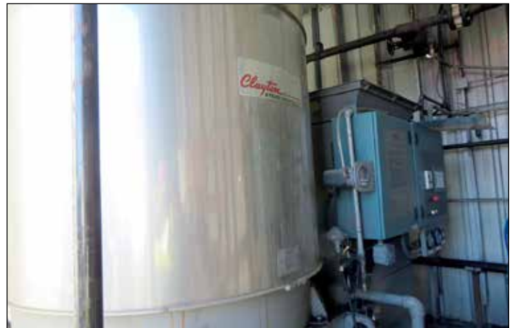
Clayton Steam Generator