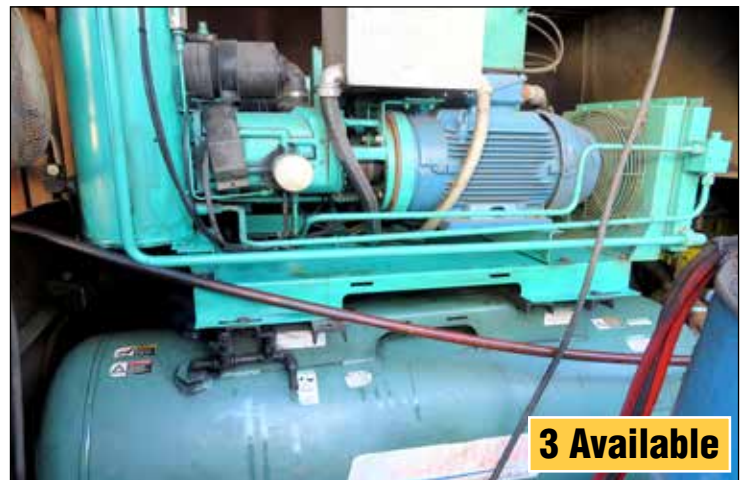
Champion Rotary Screw Air Compressor