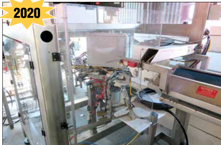
Fox Mod. WB3, Dual Wicket Bagger