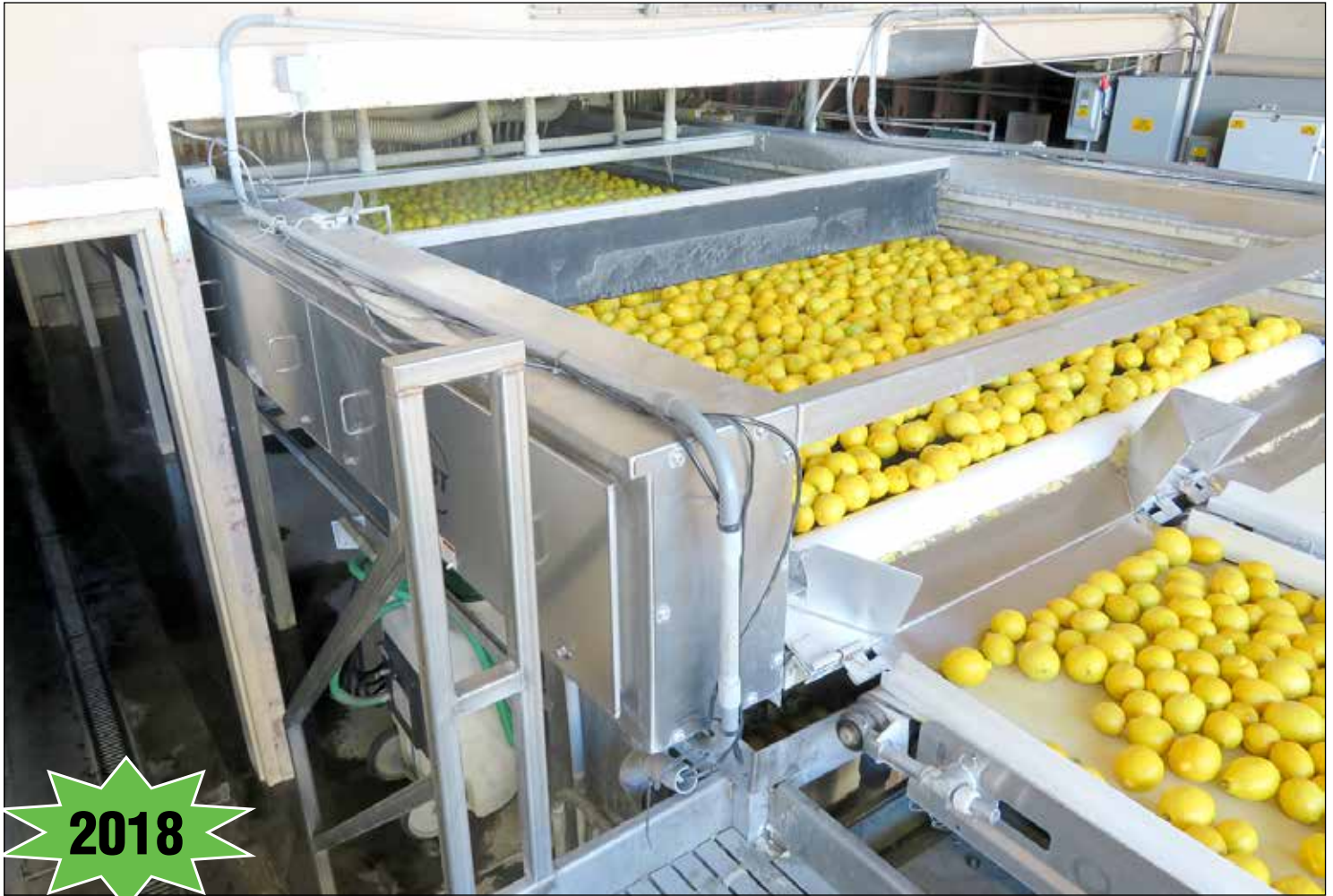
Partial View of JBT Wash Line

2018 JBT 7' x 18' Brush Fed Pressure Washer, w/Remote Bin Tilt Dump to Push Thru to Rot Lemon Table to Elevator to JBT Washer to S.S. Roll Elevator to Dryer