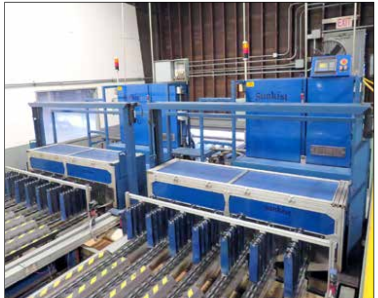
Partial View of Sunkist 14-Lane Color Sorter (Upgraded Software)

Sunkist 14 Lane Color Sorter (UPGRADED SOFTWARE) Feeding to (12) Box Filler Conveyors, Bin Filler & Conveyor to Storage