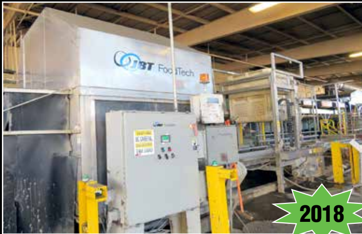
MAF Bin Wash Line

Ventura Pacific is Building a Brand New State-of-the-Art Processing Facility Everything at this Location Must Sell