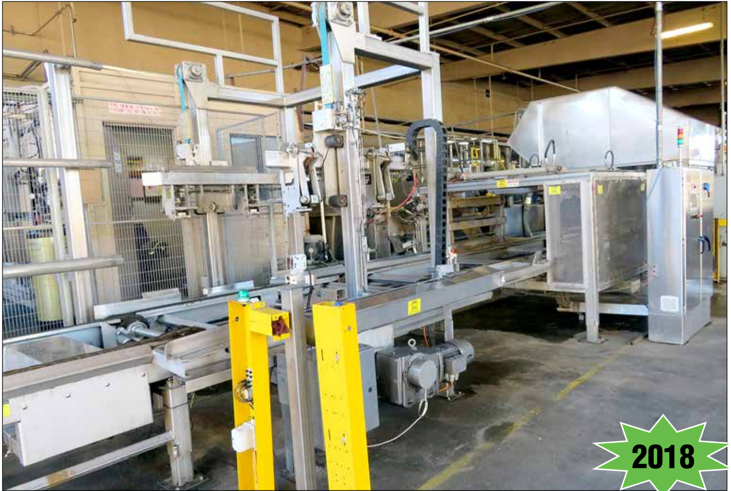
MAF Bin Wash Line

2018 MAF 7' x 120 Bins Per Hour S.S. Wash Line, w/Bin Lift, Set On, JBT Food Tech Bin Washer, Stacker to Set Off Feeding to Drying Line, S/N 853500X