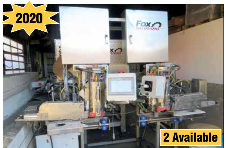
Fox Mod. SFB-2, Pouch Baggers