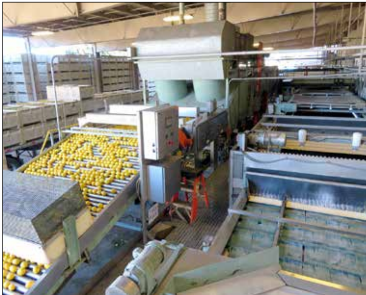
Wash and Dry Lines

From Wash Line to 8' x 7' Dump Tank, 7' x 15' Roll Conveyor, 5' x 20' Grate Table, Submerged Tank, Roll Elevator, 75 Pin Brush Bed, Flap Conveyor to Color Sorter