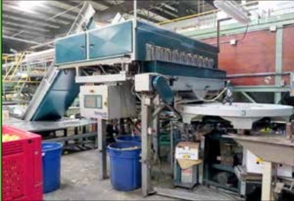
Volumpak Carousel Bagger

Timed Online Sale Ending: Wednesday, June 1, 2022 at 10:00am PT