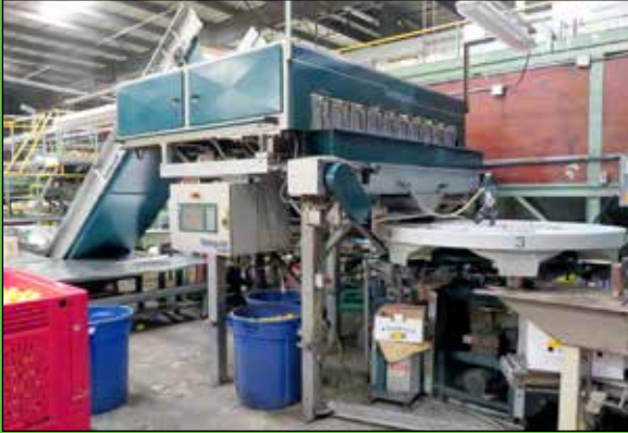
Volumpak Carousel Bagger

Timed Online Sale Ending: Tuesday, July 12, 2022 at 10:00am PT