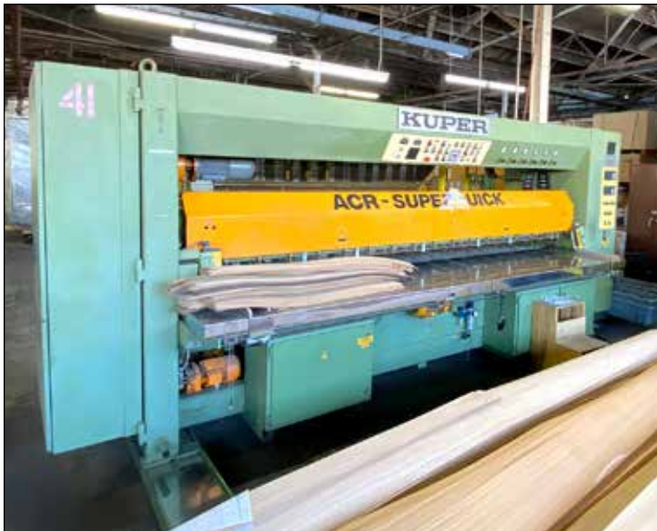
Kuper ACR/3100 Super Quick, 10' Veneer Splicer