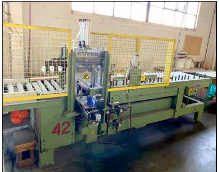
Kuper Mod. KLM, 20" Glue Applicator