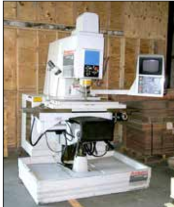
Bridgeport Vertical CNC Mill