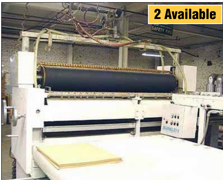
Burkle Mod. CAK2000, 78" & 87" Top & Bottom Glue Spreader