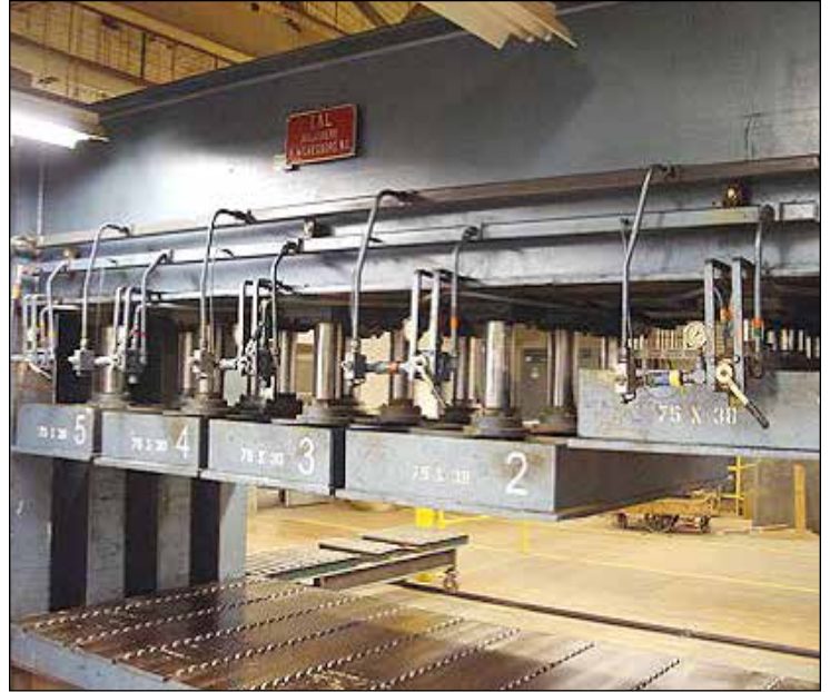
L&L Five Section 76" x 38" Cold Press