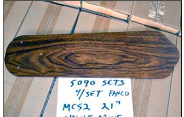
Extremely Large Qty. of Finished Wood Fan Blades & Fan Blade Material