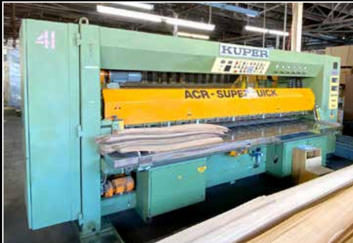
Kuper ACR/3100 Super Quick, 10' Veneer Splicer