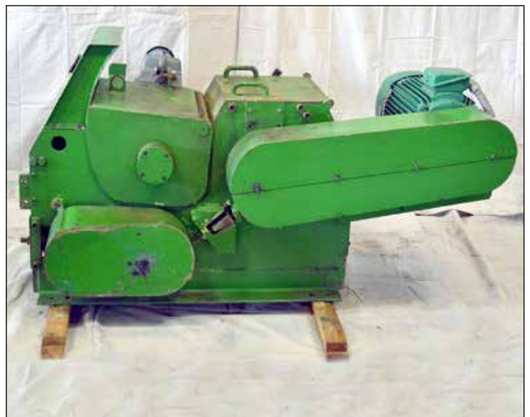
Klockner Mod. KTH120X400ZWT, Dual Head 2 H.P. Low Sped Grinder