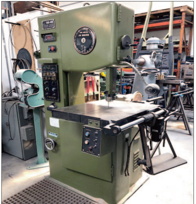
Hoe Jun Mdl. HVA-400, 16" Vertical Band Saw

Hirschmann Hauser 838 Vertical Drill Press, Buffalo No.22 Production Drill Press, Moore Production Drill Press, Famco No. 3 Arbor Press, Kalamazoo Mdl. 8C-W 8" Horizontal Metal Cutting Bandsaw, Delta Carbide Double End Tool Grinder, Blue M Furnace, Pexto 42" Hand Roll, Torit Dust Collector, Walker Turner Ped. Drill Press, Pexto 0617 18 Ga. Bevele, Millermatic Arc Welder, Littell 300lb Cap. Coil Reel, Rapid Air Coil Reel, Baby Bench Type Drill Press, Gorton Pantograph Eisele TMSII Cut-Off Saw, Gage Master Series Twenty, 14" Optical Comparator, Carts, Vices, Hand Tools, Toll Holders, Chucks, Floor Jacks, Storage Cabinets, End Mills, C-Clamps, Grinding Wheels, Angle Plates, Indexers, Drills, 3' x 4' Granite Surface Plate, Height Gages, Shop Fans, Work Benches, Heavy Duty Shelving and Much More!