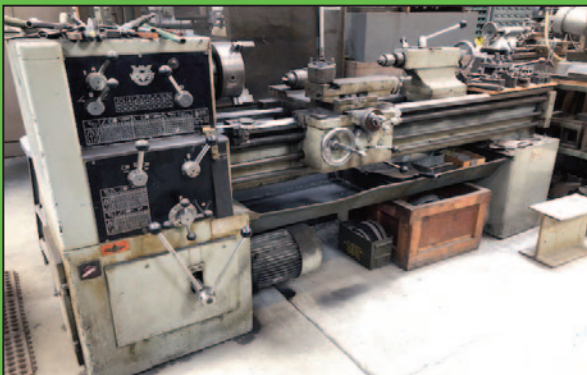
Voest 18" x 60" Engine Lathe