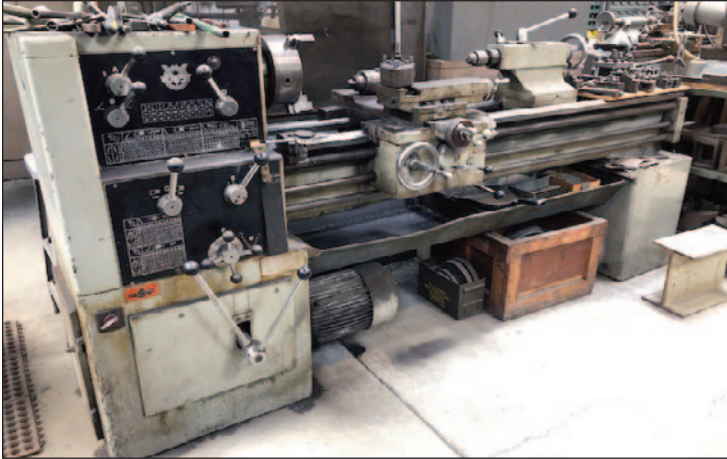
Voest 18" x 60" Engine Lathe

Hardinge Mdl. HLV, Chucker , w/6-Jaw Chuck, Aloris Tool Post, Tail Stock, Hand Collet Closer