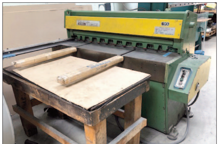
Edwards Truecut Mdl. 3-25/1250/DD, 5' Power Squaring Shear

Edwards Truecut Mdl. 3-25/1250/DD, 5' Power Squaring Shear , w/Front Arm Extensions, S/N 74C/39194