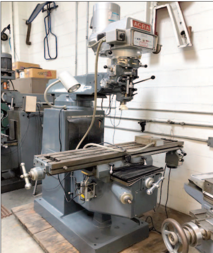
Acra 2 Hp Variable Speed Vertical Mill

SPIRO Type VA-AH-2 Vertical Mill , w/60" x 12" Work Table, S/N 67-92