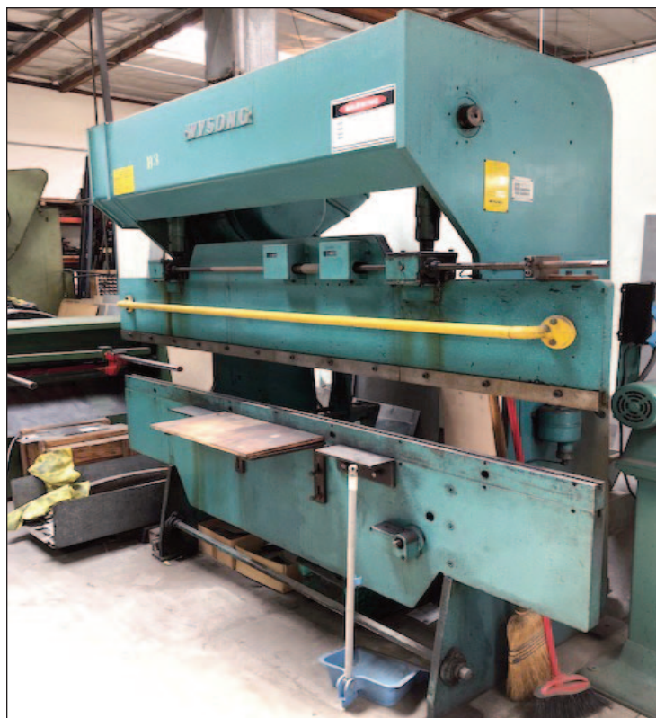
Wysong Mdl. 3596, 8' x 35-Ton Power Press Brake

Wysong Mdl. 3596, 8' x 35-Ton Power Press Brake , w/2" Stroke, 3" Adjustment, 9' Maximum Die Space, S/N PB62-106 Chicago Dreis & Krump Mdl. 135, 4' x 15-Ton Power Press Brake , S/N L-16244 Chicago Dreis & Krump Size. W31, 4' Finger Brake , S/N 84380