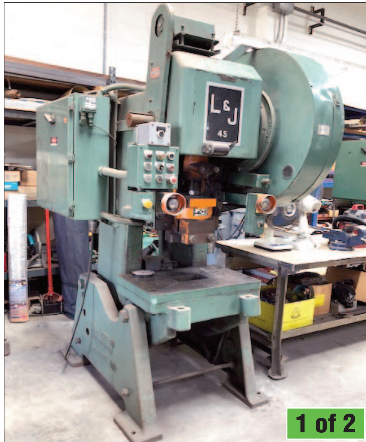
L&J No. 45, 45-Ton OBI Punch Press

(2) L&J No. 45, 45-Ton OBI Punch Presses , w/3" Stroke, 3" Adjustment, 10" Shut Height on Bed, Bed R To L x F to B 28 x 18, S/Ns 45900A & 45954A V&O No. 60, 60-Ton OBI Punch Press , w/Feed Unit, S/N 60ST-45 Roussell No. 10, 110-Ton OBI Punch Press , w/6" Stroke, 4" Adjustment, 16-1/2" Shut Height, 45 SPM, S/N 20573