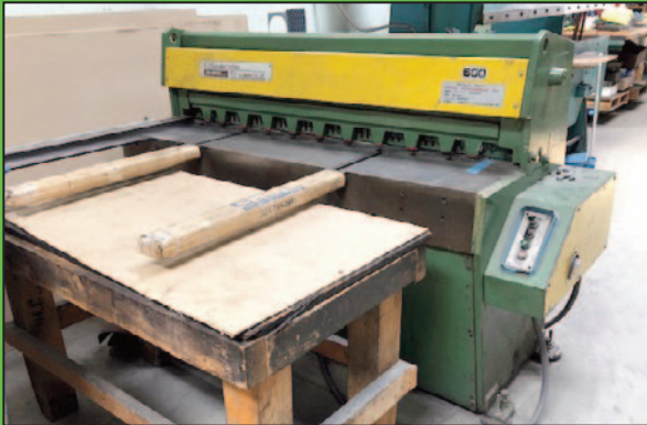
Edwards Truecut Mdl. 3-25/1250/DD, 5' Power Squaring Shear