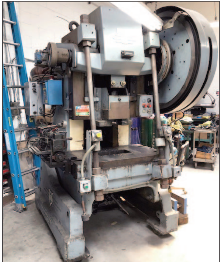
Roussell No. 10, 110-Ton OBI Punch Press

Diamond 50-Ton OBI Punch Press , w/22" x 32" Bed Roussell Mdl. 3, 25-Ton OBI Punch Press , w/2" Stroke, 2" Adjustment, 10-3/4" Shut Height, 135 SPM, S/N 21371 L&J No. 27, 27-Ton OBI Punch Press , w/9" Shut Height on Bed, 2" Adjustment, 2-1/2" Stroke, Bed R To L x F to B 21-1/2 x 13