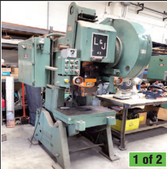
L&J No. 45, 45-Ton OBI Punch Press