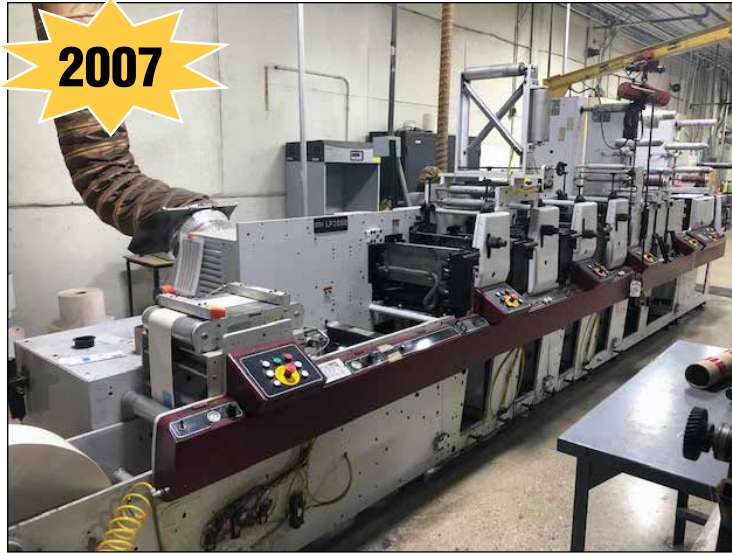
Mark Andy Mod. LP3000-10A, 10" Four Color Label Press

Mark Andy Mod. 220492108/2, 10" Four Color Label Press, Tumbler, Three-Die Station, Perf Station, Fan Folder & Sheeter, S/N 7703