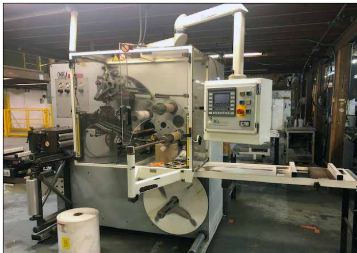
Omega Systems Unwinder