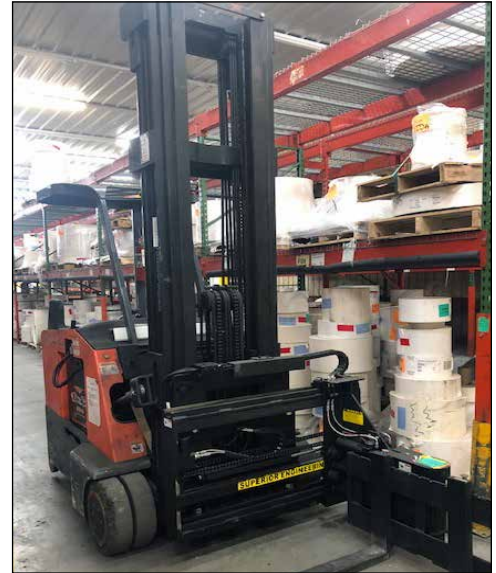
Toyota Mod. 6BNCU13, 2,000lb. Electric Forklift

Everything Must Sell! BID ONLINE AT: BidSpotter