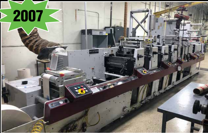
Mark Andy Mod. LP3000-10A, 10" Four Color Label Press