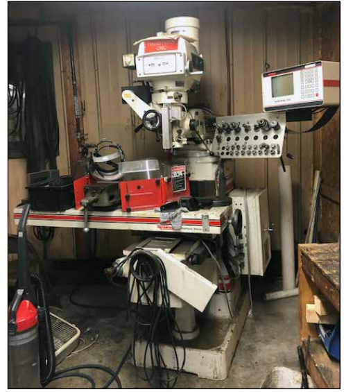
Handyman CNC Vertical CNC Mill