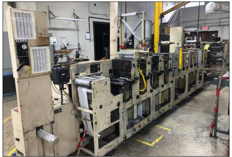
Mark Andy Mod. 220492108/2, 10" Four Color Label Press