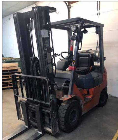
Toyota Mod. 7FGU118, 3,000 Lb. Cap. Forklift