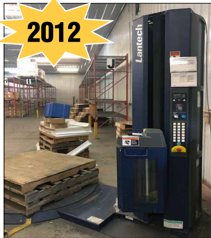
Lantech Mod. Q300 Pallet Wrapper