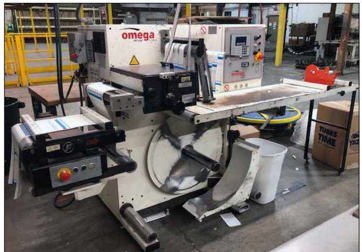
Omega SR1300 13" Rewinder