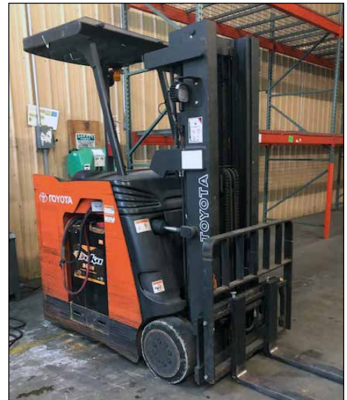
Toyota Mod. 5FBE15, 3,000 Lb. Cap. Forklift