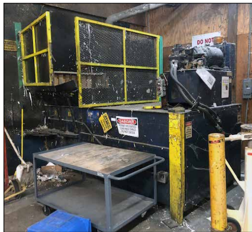
SP Industries Horizontal Baler