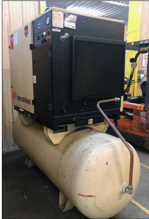
Ingersoll-Rand Mod. PSIG Tank-Mounted Rotary Screw Type Air Compressor