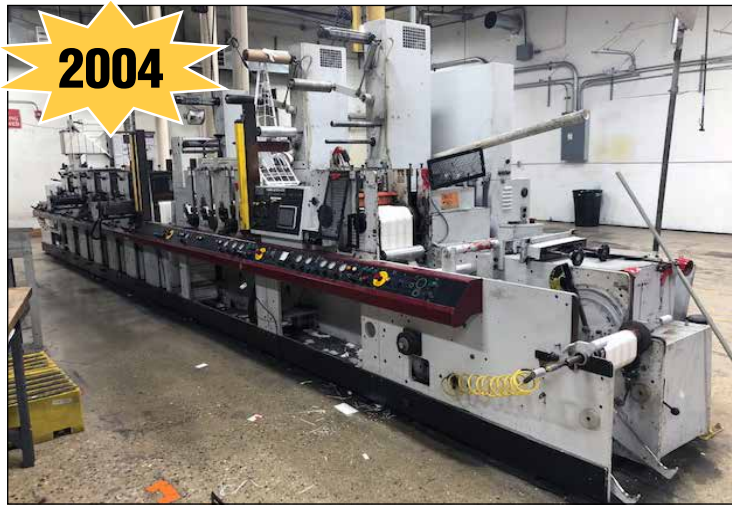
Mark Andy Mod. 4150-10C, 10" Six Color Label Press