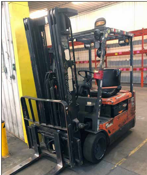
Toyota Mod. 7BNCU15, 3,000 Lb. Cap. Forklift