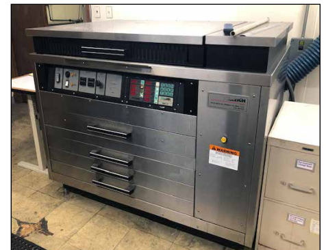
Kelleigh Mod. 275 Exposure Unit/Dryer