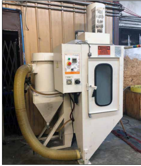
MicroClean Flexo Concepts Blast Cabinet