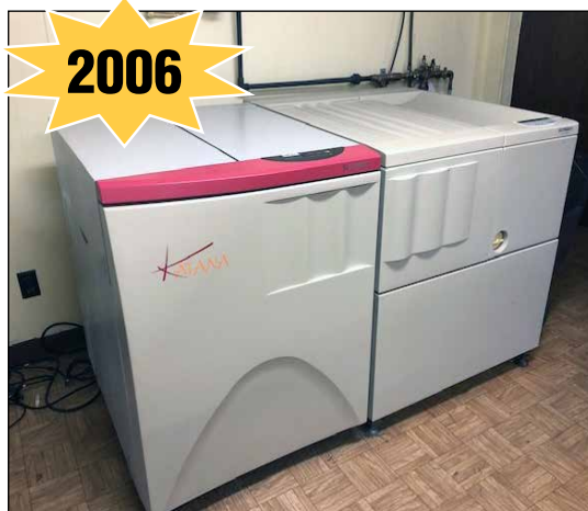
Screen Katama LD-M1060 Screen Printer

2006 Screen Katama LD-M1060 Screen Printer, S/N 7189 Kelleigh Mod. 2430 In-Line Plate Processor/Dryer, S/N 240-600 Kelleigh Mod. 275 Exposure Unit/Dryer, S/N 275-527