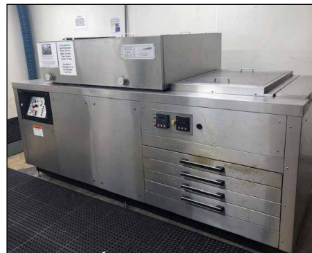
Kelleigh Mod. 2430 In-Line Plate Processor/Dryer

Kelleigh Mod. 266 Plate Cutter, S/N 266-563 Spectra Light QC Light Station