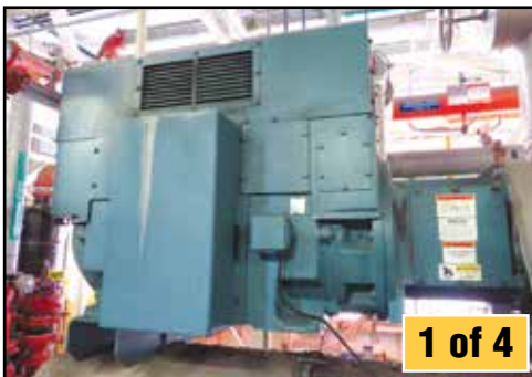
Frick 570hp Rotary Screw Air Compressor