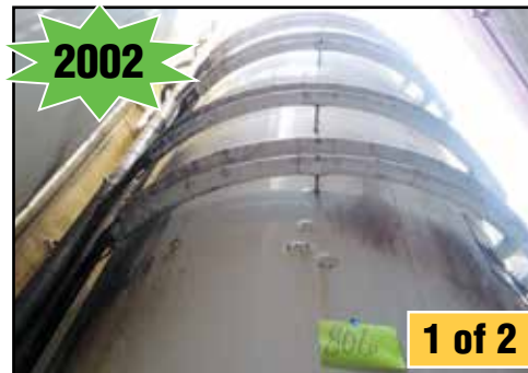
Walker S.S. 30,000 Gal. Jacketed Silo