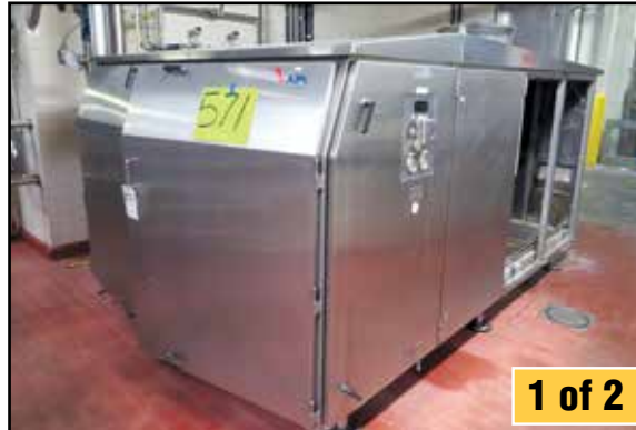
APV SPX 250hp High Performance/Pressure Homogenizer