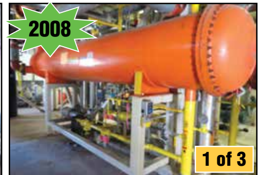
Chil-Con CH32180-410 Ammonia Condenser System

SHORT SALE!!! Approx. 35 Lots In Total. All Lots Subject To Presale. All Bills To Be Paid In Cleared Funds Only (Cash, Cashiers' Check Or Wire Transfer) By Sept. 2nd. If You Wish To See The Defaulted Buyer's Invoice, Please Email stevewquale@aol.com . All Bidders Must Register With Their Company Name And Verifiable Contact Information.