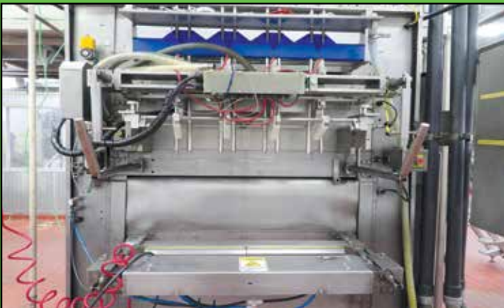
Winpack Filler, w/Tanks & Valves

Lots Begin Closing: Tuesday, September 1st at 11:00am PDT