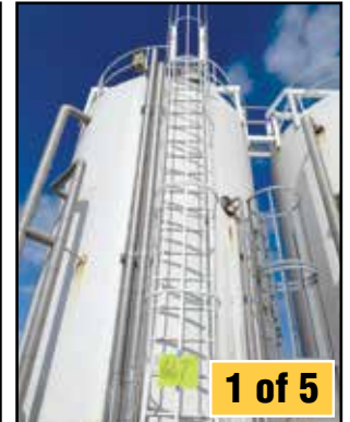
DCI 30,000 Gal. S.S. Jacketed Silo