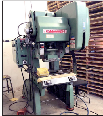
Bliss C35 OBI Punch Press