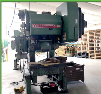
1979 Bliss C60 OBI Punch Press