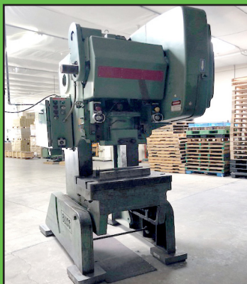
Bliss OBI Punch Press