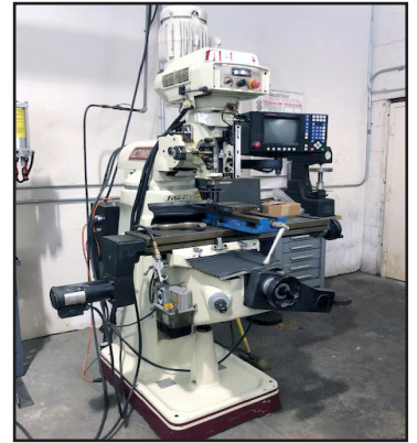
Acer Vertical Milling Machine