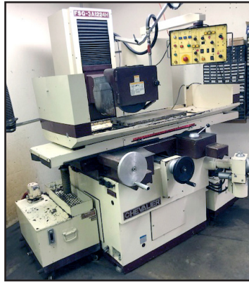
Chevalier Hydraulic Surface Grinder