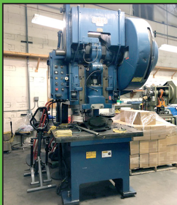
Bliss DT-60 OBI Punch Press