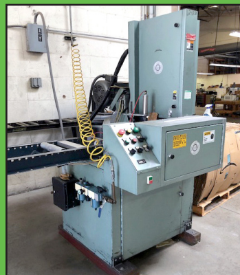
CTD A48E Abrasive Carbide Saw