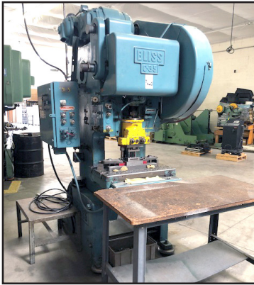
Bliss C35 OBI Punch Press

ASSET LOCATION: 82 Industrial Way, Buellton, CA 93427