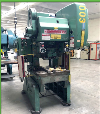
1970 Bliss C35 OBI Punch Press