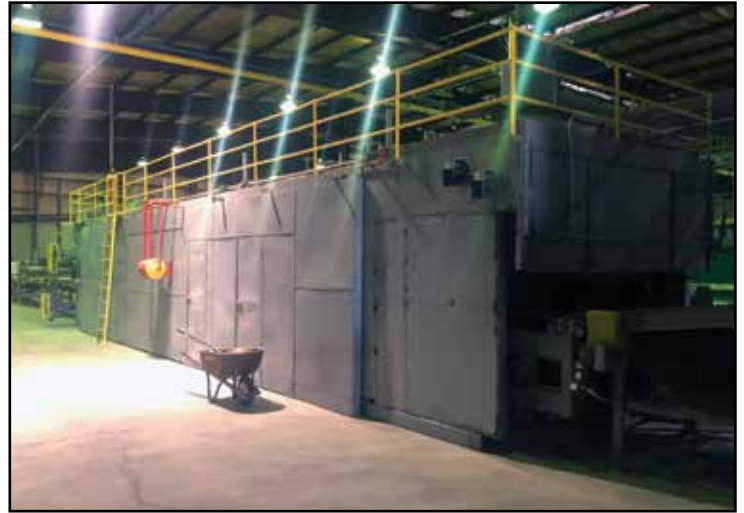
Views of Process Engineering 10' x 60' x 92" Conveyorized Curing Oven