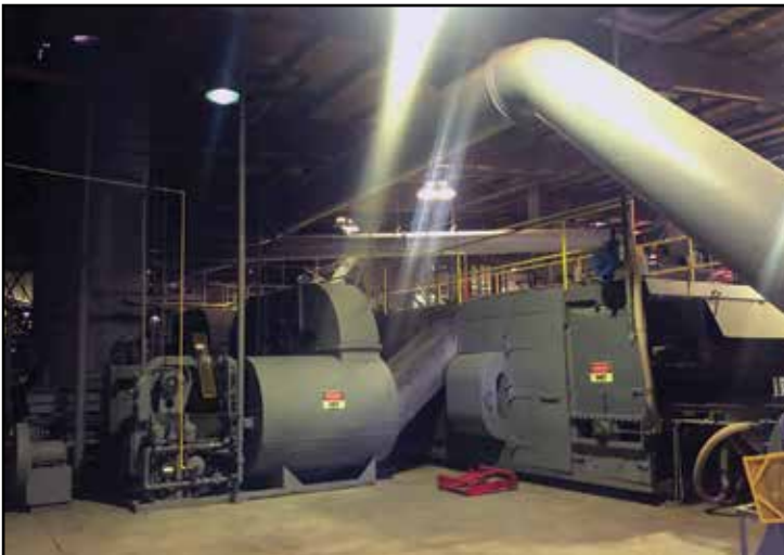
American Industries 75 HP Boiler System