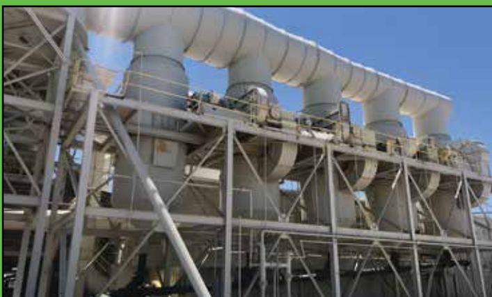
Wheelabrator-Frye 6 Bag Dust Collection System

Lots Begin Closing on: Thursday, September 17th at 10:00am PT