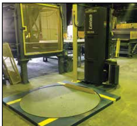
Lantech Q300 Pallet Wrapper