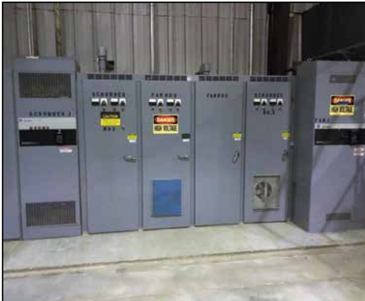
Allen Bradley Centerline Electrical Switchgear