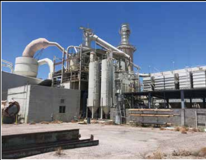
View of Aerospace Rock Wool Manufacturing Facility