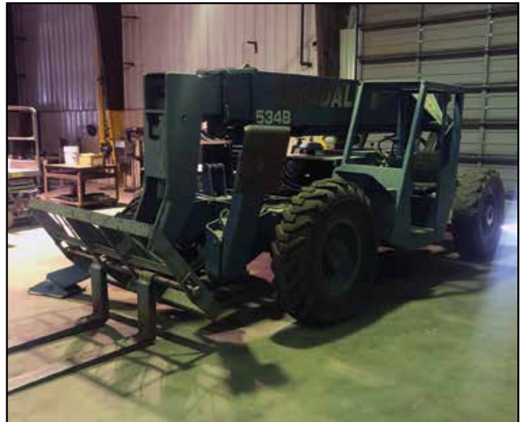
Gradall 534B8, 8000 Lb. Telescopic Forklift