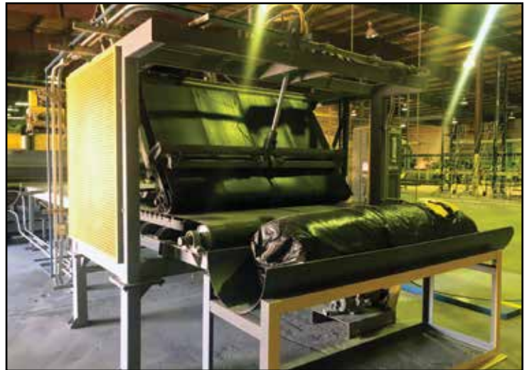
Custom Roll-Up Machine