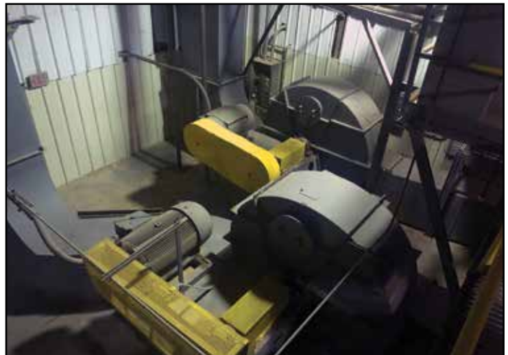
200 HP Blower System for Dust Collector