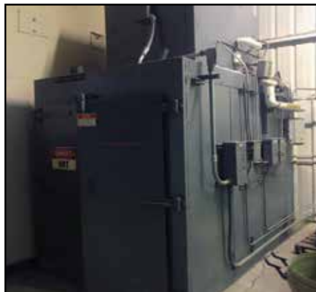
Despatch 6' x 10' Curing Oven