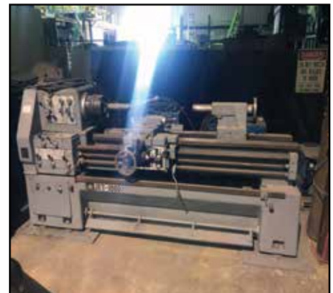
Jet 1860, 18" x 60" Engine Lathe