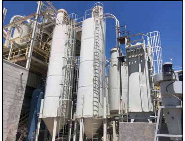
Steel Glass Material Silo System