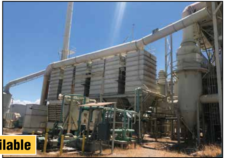
Ducon Scrubber Systems