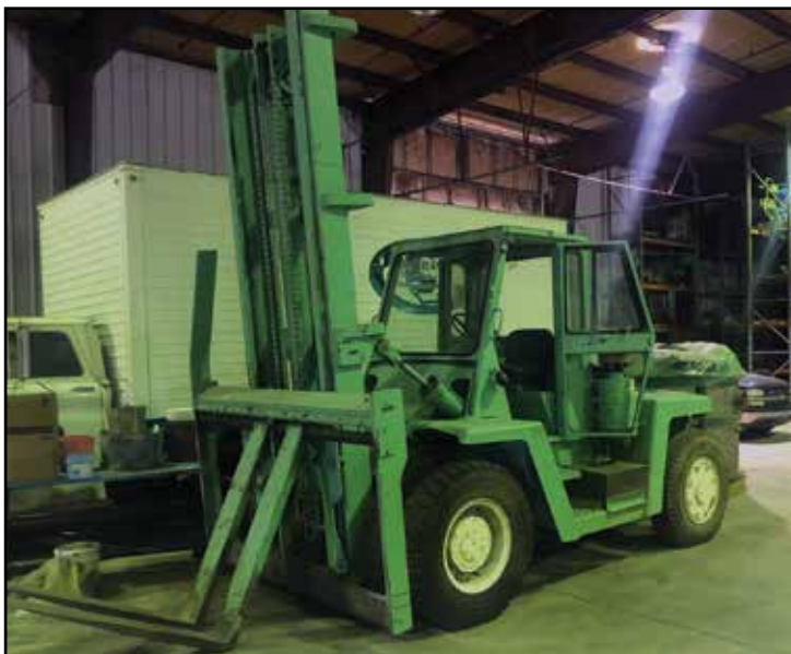
Clark 18000 Lb. Forklift