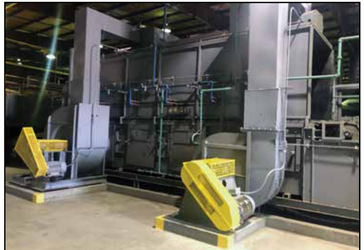
8' x 25' Forming Plenum w/50 HP Blowers