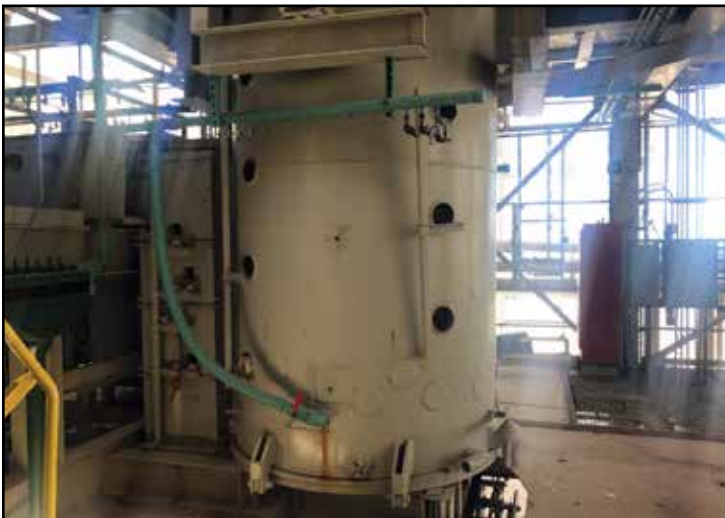
2000 Degree Gas Fired Incinerator