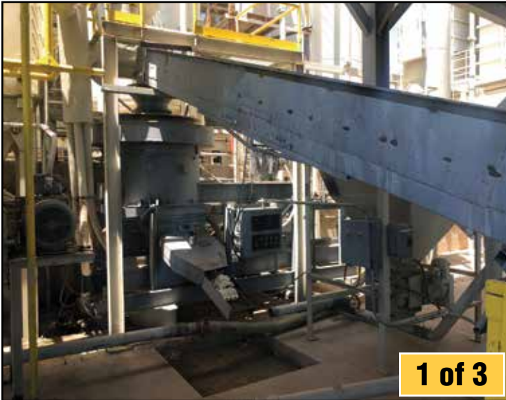
50 HP Glass Granulator