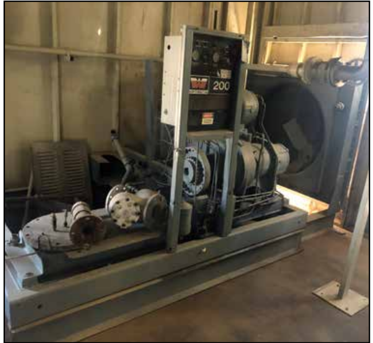
Worthington 200 HP Air Compressor