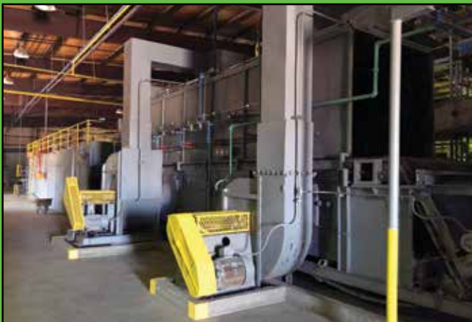
Process Engineering 2000 Degree Conveyorized Curing Oven

Lots Begin Closing on: Thursday, September 17th at 10:00am PT