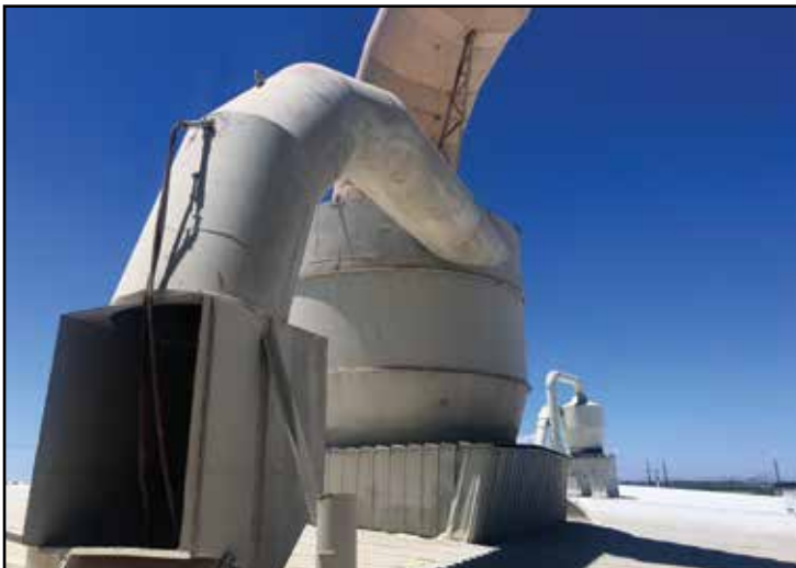
Indiana Industries Steel Collection Chamber