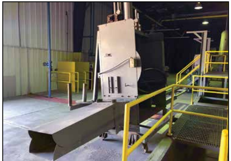
Manual Bagging System