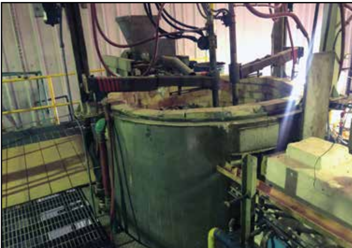
6' x 2000 Degree Fire Brick Line Melter