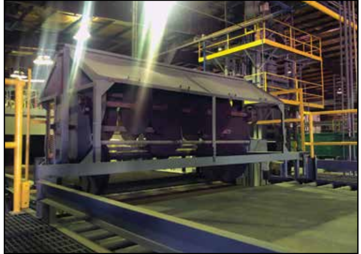
Indiana Industries 12FB Edge Trimmer