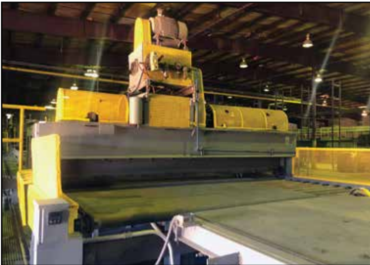
Indiana Industries EX-STR Guillotine Shear