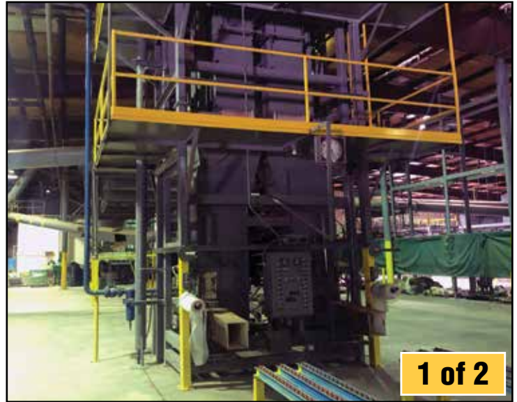
Indiana Industries Two Chamber Bagger System