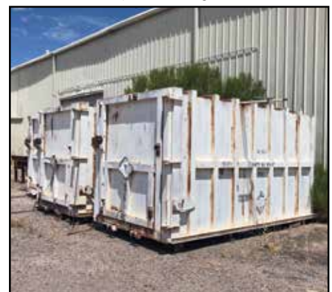
Steel Roll-Off Bins