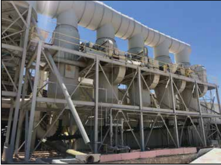
Wheelabrator-Frye 6 Bag Dust Collection System

Indiana Industries 55' x 27' x 9' Steel Frame Collection Silo, w/Picker and Chain Conveyor