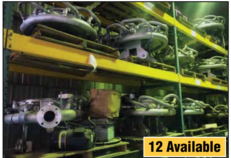
Spare Custom Fiberizer's