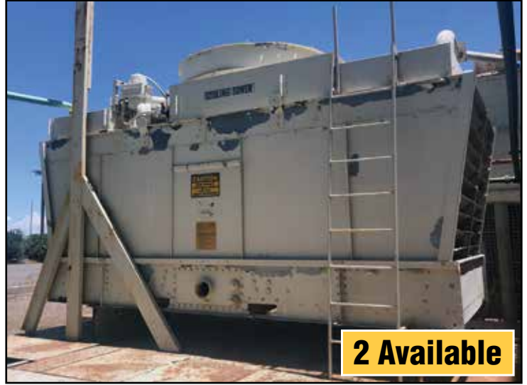
Marley Cooling Tower