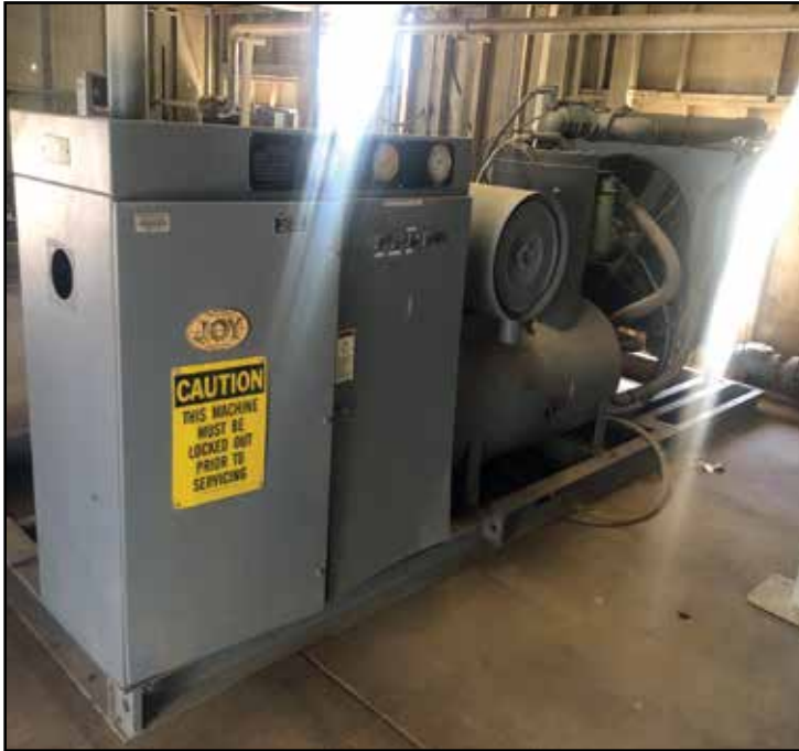
Joy TA1025, 200 HP Air Compressor

Worthington 200 HP Rotary Screw Air Compressor