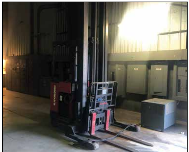
Raymond 4000 Lb Electric Forklift