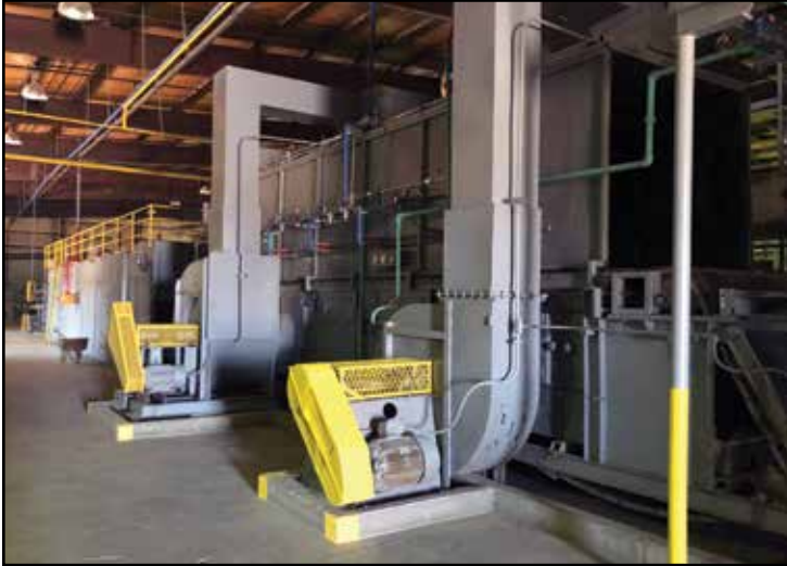
Process Engineering 2000 Degree Conveyorized Curing Oven

Process Engineering 10' x 60' x 92" x 2000 Degree Conveyorized Curing Oven, w/30 HP Main Drive, Chain Type, w/(2) American Mfg., 75 HP Burners, Recirculating Fans