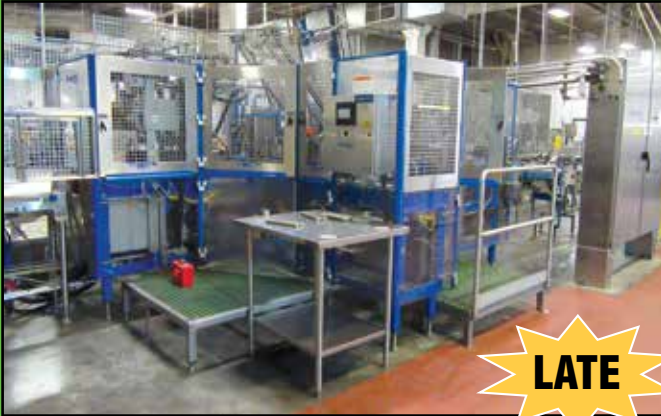
Douglas Case Packer – Line 13

Lots Start Closing on: August 11, 12 & 13 Lots Start Closing at: 10am West Coast Time (PDT) All Three Days