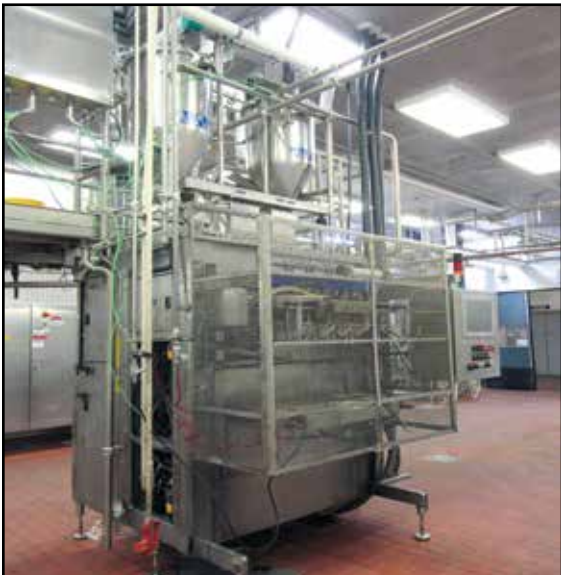
Winpak Filling Units

(2) Winpak Mod. LD-32 Filling Units, w/ Apex Controls, C21 Filler Tanks, Catwalk