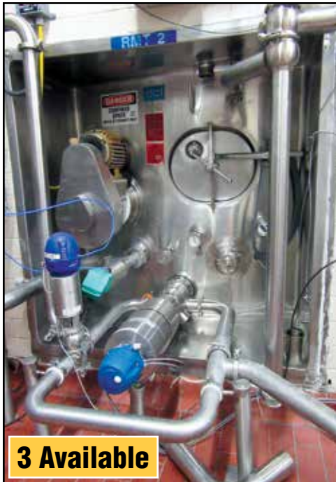
(11) S.S. Silos

(6) 2004 DCi 30,000 Gal. Storage Silos, w/Pumps, Piping, S/Ns 85D-32749-B, 85D-32749-A, 85D-32750, n/a, n/a, n/a (2) 2002 Walker 10,000 Gal. Batch Silos, S/Ns SPG-33756, SPG-33755 (4) DCi 30,000 Gal. Storage Silos, S/Ns SC-00061-A, SC-00061-B, SC-00061-C, SC-00061-D