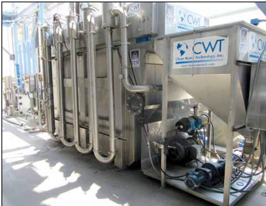
Partial View of CWT Waste Water Treatment System

Clean Water Technology (CWT) Waste Water Treatment System, w/GEM System, Dorit Controls, Tanks