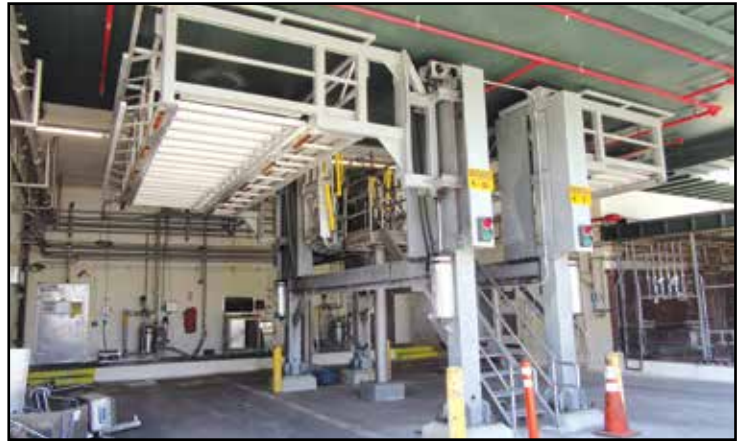
Carbis Bulk Loading, Dual Station Milk Receiving

Carbis Bulk Loading Solutions Bulk Milk Receiving Bay, Sanitizer Hose, Ag Hose, Receiving Stairs, Eye Wash