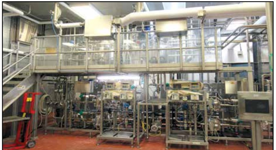
Blending System w/(2) 2017 Walker 75 Gal. S.S. Tanks

A&B Base Bowl; 200lb. Dig. Scale, 6-Lane Conveyor System, (3) Kraken Incline Conveyors, Water Skid Blending System , w/(2) 2017 Walker 75 Gal. S.S. Tanks, Piping, Valves, Catwalk, Master Flux L/S Wash Down Modular Controller, Eye Wash Station