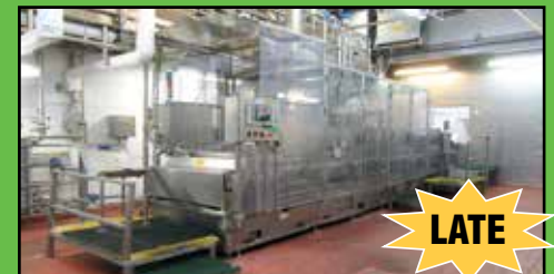
Zitro Pack Z3-6000 Packaging System