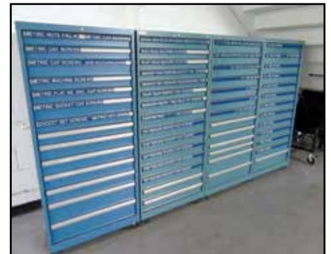
Partial View of Lista Cabinets