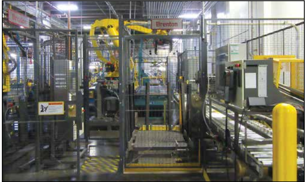
View of Kauffman Case Loading Line w/(5) Fanuc Robots

Kauffman Case Loading Line – Including: (15) Pallet High Pallet Dispensers; Incline Conveyor; Brenton Enclosures/Robotic Palletizers; (3) Fanuc M-410 iB 300 Robots; In & Out Roller Conveyor