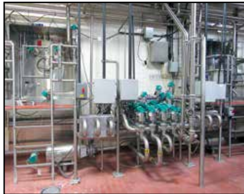
Partial View of S.S. Silos