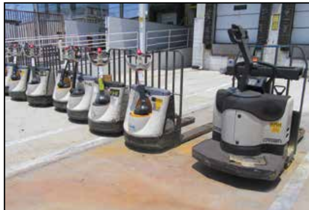
Partial View of Crown Electric Pallet Jacks