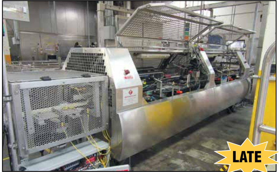
Bradman-Lake – Line 13