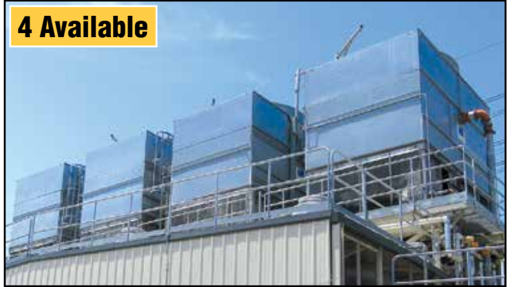
Evapco Cooling Towers

(4) Evapco Mod. AT 112418 Cooling Towers, S/Ns 7313125, 12468166, 8342486, 7313126