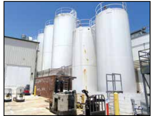
Partial View of Walker & DCi Storage Silos