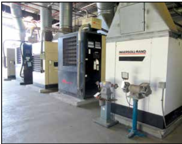
View of Ingersoll-Rand Rotary Screw Air Compressors

Lantech Mod. 4WD QM008697 Pallet Wrapper