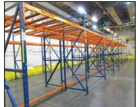
Partial View of Pallet Racking

(2) Presto Hyd. Lift Carts; 500lb. Jib Crane, w/Tilt Lock Handling Unit Westco Hyd. Lift Cart Genie QS-1500 Man Lift (2) Strapping Units Proto Portable Tool Box (5) So-Low Ultra-Low Freezers (50) Rubbermaid Portable Trash Containers; Portawasher PHP-3, High Pressure Cleaning System; Ace 1/2-Ton Free Standing Crane System, w/1/2-Ton Hoist; Torit Dust Collector; Douglas Can Washer