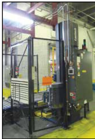
(2012) Lantech Mod. Q Pallet Wrapper