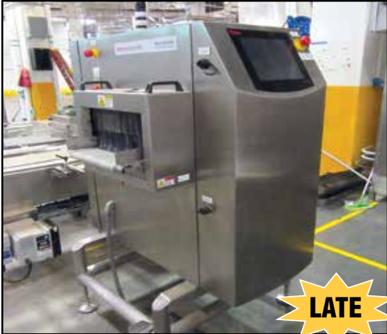
Thermo Scientific X-Ray

Yogurt Line No. 12 – Including Thermo Scientific Next Guard X-Ray Inspection System, w/ Next Guard ; Twin Line Conveyor; Electrical Panel; CLE Conveyor