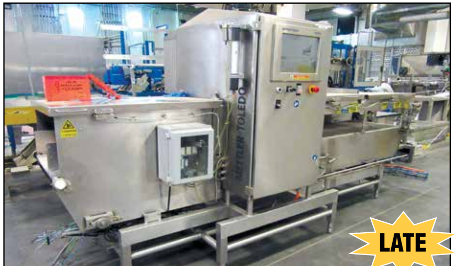
Mettler-Toledo Power Checker & 500 Metal Detector