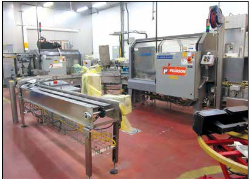
Partial View of Pearson Packaging Line

(2) Pearson Case Packers/Erectors; IPM Sealing Unit, w/Allen Bradley Panel View Plus; Mettler Toledo Safeline Metal Detectors & X-Ray Inspection; Fully Automatic Conveyor System & Controls