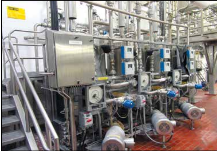
View of CIP System

CIP System , w/(4) S.S. Tanks, Pumps, Metering (9) Walker Mod. BHT-BS-36, 3/16" 30,000 Gal. Storage Silos, w/150 psi @ 300° (5) 3,000 Gal. CIP Tanks (9) SPX Votators, w/Pumps TriCore AEA Metering Cluster