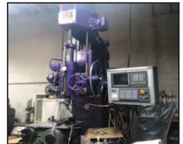
Pratt & Whitney 3E, 2-Axis CNC Jig Borer