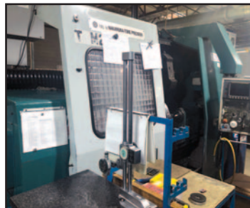
1991 Nakamura-Tome TMC-400 CNC Turning Center