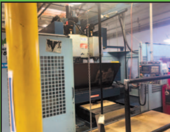
2001 Matsuura MC1500V-DC, 5-Axis CNC VMC