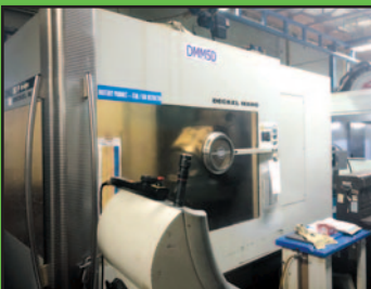
2001 Decker Mako Mod. DMU80P, 5-Axis CNC HMC