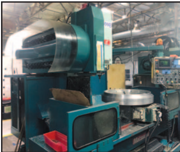
1992 Matsuura MC1000V-DC, 3-Axis CNC VMC

ASSET LOCATION: 404 W. Guadalupe Road, Tempe, AZ 85283