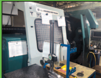
1991 Nakamura-Tome TMC-400 CNC Turning Center