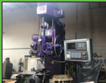
Pratt & Whitney 3E, 2-Axis CNC Jig Borer