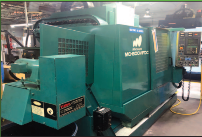
1997 Matsuura Mod. MC800VFC, 4-Axis Vertical Machining Center

TAUBER-ARONS, INC. Industrial Auctioneers & Liquidators since 1892