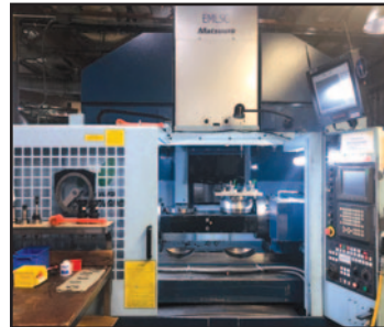
2000 Matsuura MC 1000VGDC, 5-Axis CNC VMC