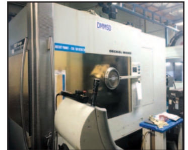
2001 Deckel Mako Mod. DMU80P, 5-Axis CNC HMC