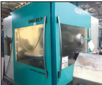
1998 Deckel Mako DMU80P, 5-Axis CNC HMC