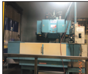
Matsuura MC1500V-DC, 4-Axis CNC VMC