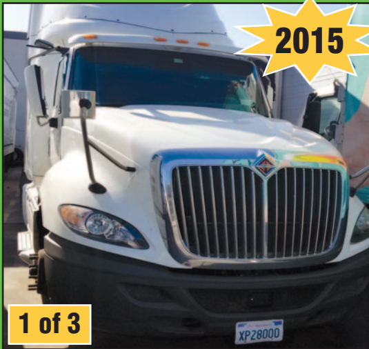
International ProStar+ Truck Tractor

TAUBER-ARONS, INC. Industrial Auctioneers & Liquidators since 1892