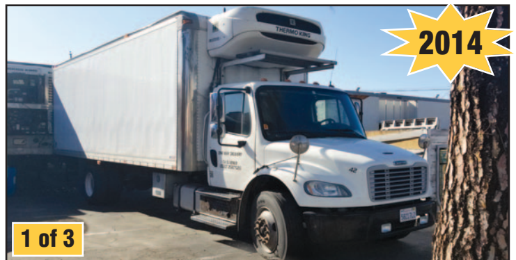
Freightliner M2 Refrigerated Van Truck