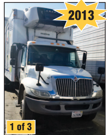
International 4300 Refrigerated Truck