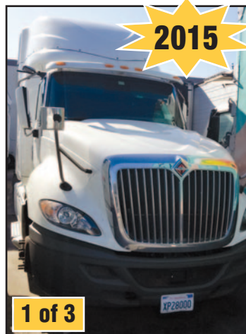
International ProStar+ Truck Tractor