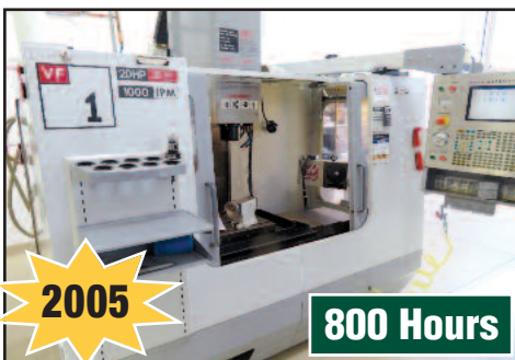
Haas Mdl. VFID 4-Axis CNC Vertical Machining Center