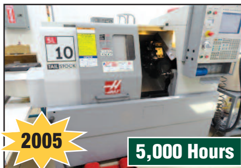
Haas Mdl. SL10T CNC Turning Center