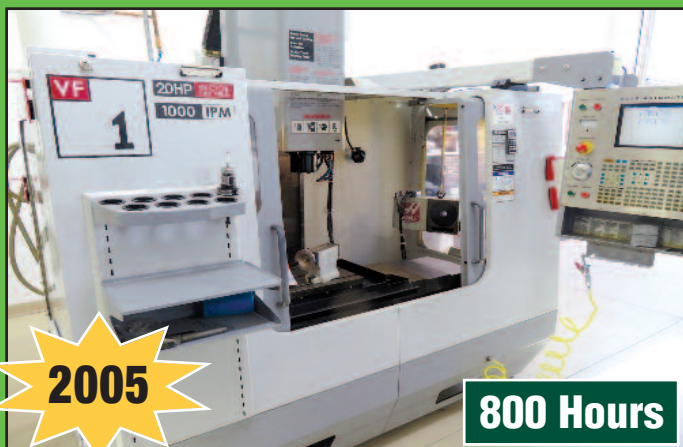
2005 Haas Mdl. VFID 4-Axis CNC Vertical Machining Center

BIDS START CLOSING: Nov. 14th at 11am PST