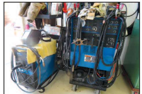
Miller Heli Arc & Wire Welders