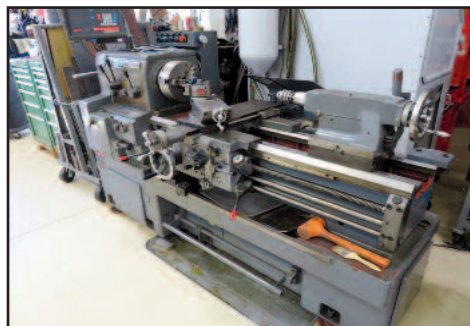
Hwacheon Mdl. 460, 19" x 36" Gap Engine Lathe