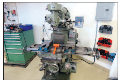
Tree Mdl. 2VGC, 3hp Gear Head Vertical Mill