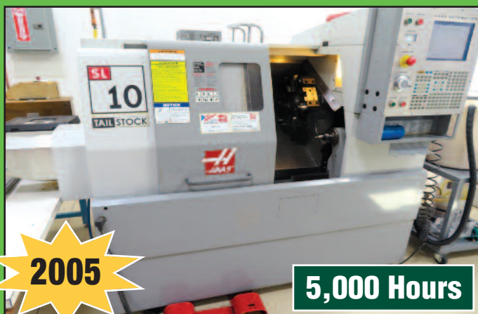
2005 Haas Mdl. SL10T CNC Turning Center

BIDS START CLOSING: Nov. 14th at 11am PST