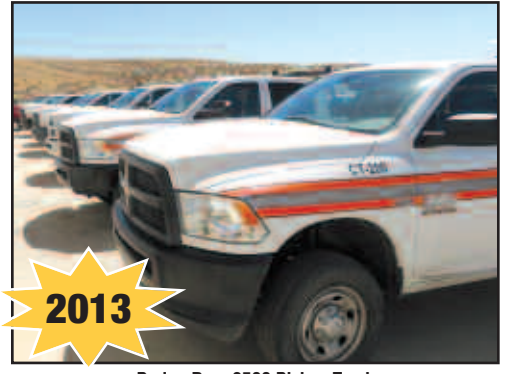
Dodge Ram 2500 Pickup Truck