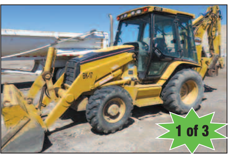
CAT 420D Backhoe/Loader

(3) 2002 – 2005 CAT 420D Backhoe/Loaders, (2) w/Quick Connect Buckets & Forks, S/Ns FDP22953, BLN12022 & FDP07764