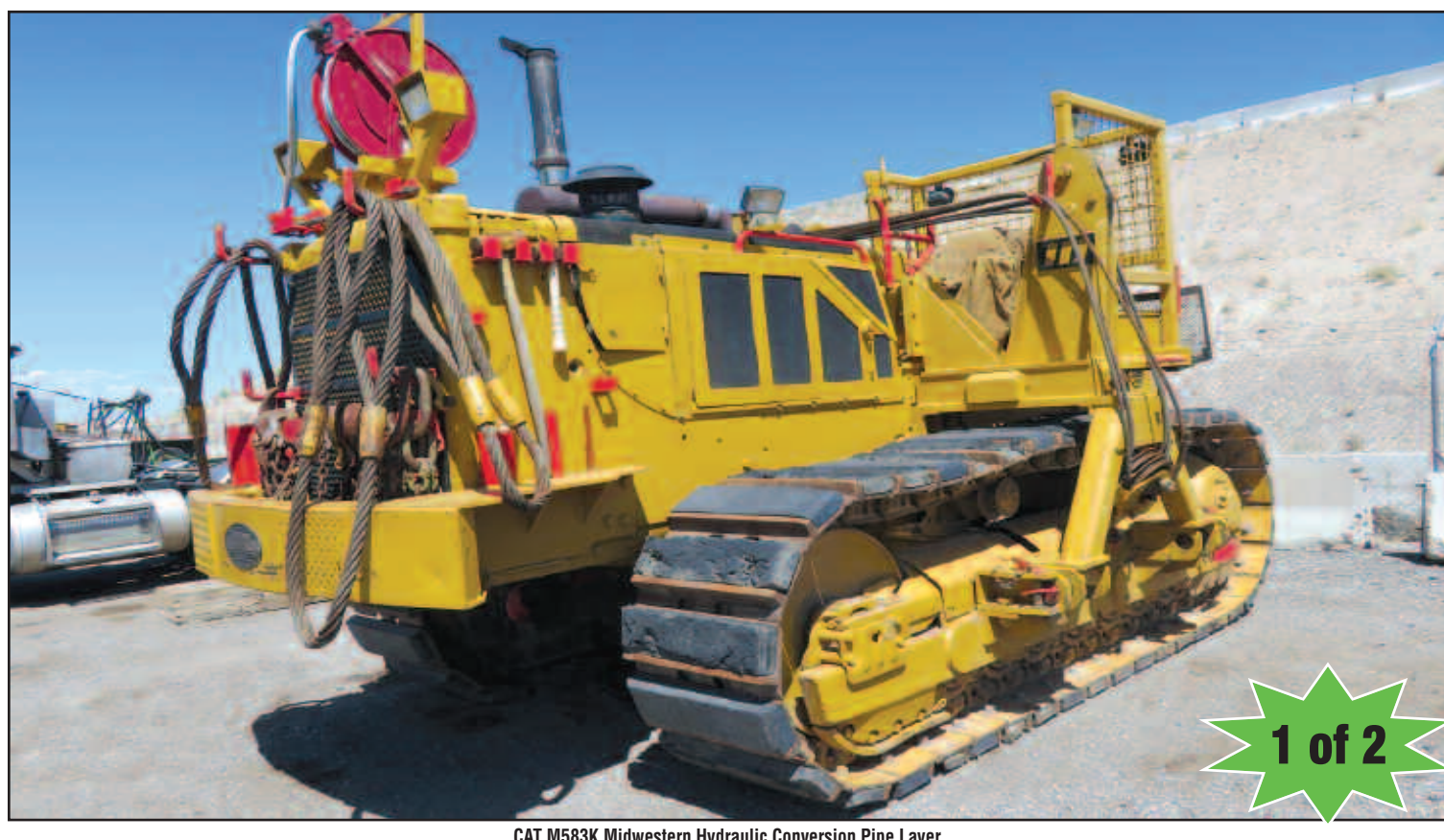
CAT M583K Midwestern Hydraulic Conversion Pipe Layer

(2) 2001 & 1999 CAT 140H Graders, w/Rippers, S/Ns 022K7104 & 22K013104