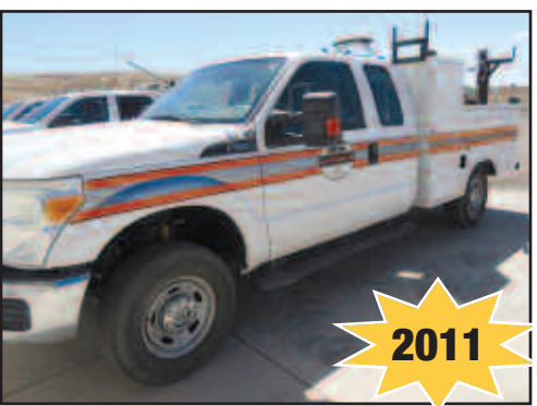
Ford F250SD Service Truck