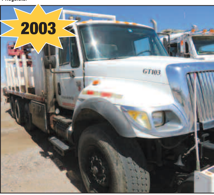
International 7600 24' Flatbed Truck, w/Prentice Crane & High Rail