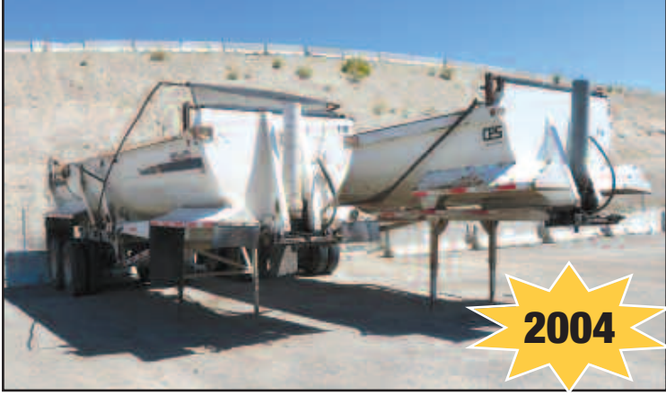
CPS 40' End Dump