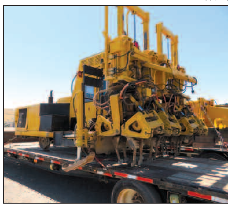
Jackson 2600 Tamper Ballast