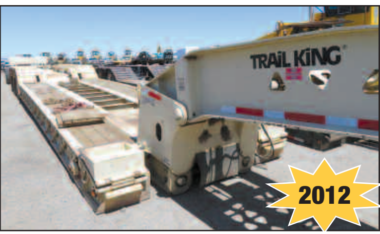
Trail King TK110DHG, 65-Ton RGN w/Booster, Anchor & Jeep