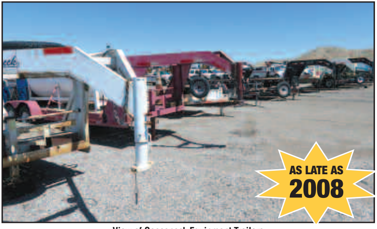
View of Gooseneck Equipment Trailers