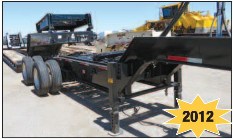
Talbert 65-Ton RGN w/Booster, Anchor & Jeep