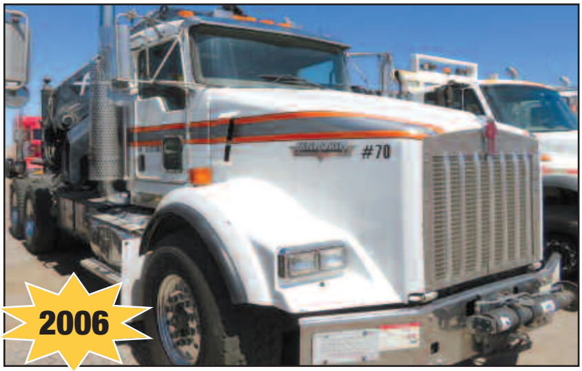
Kenworth T800 Tractor & HIAB 60Sep HT Crane