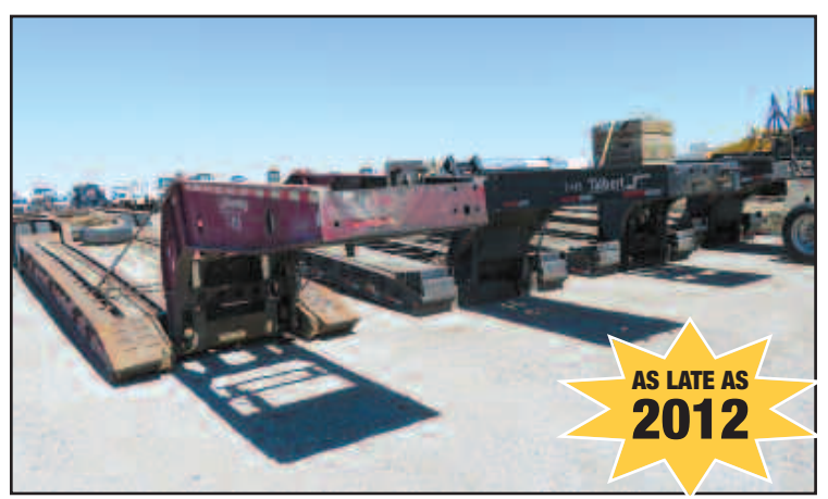
View of Heavy Haul Low Bed Trailers