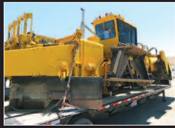
Kershaw 26-3-1 Regulator

GANDY DANCER, LLC RAILROAD & EXCAVATING SERVICE COMPANY