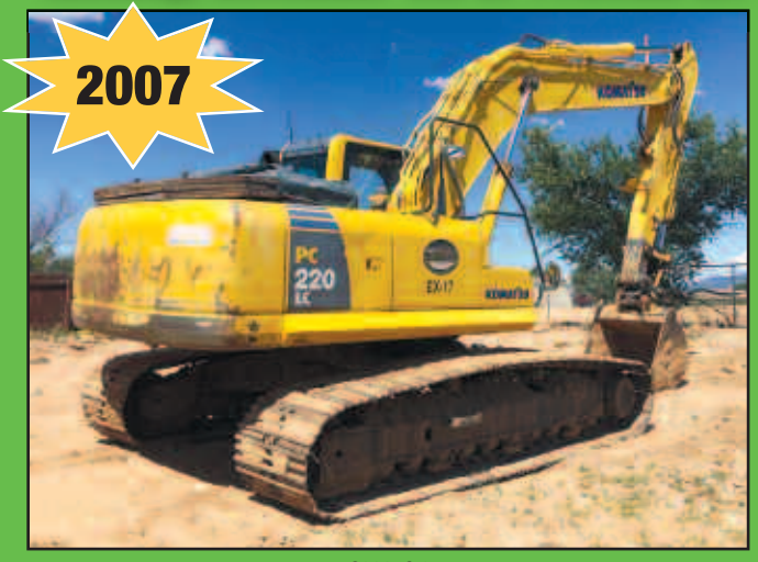
Komatsu PC200LC 8 Excavator