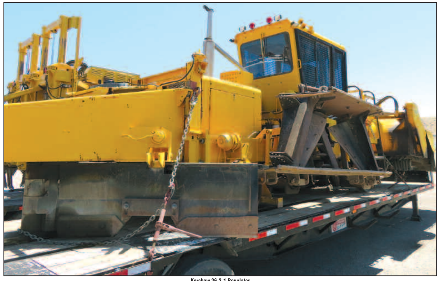
Kershaw 26-3-1 Regulator

2003 Fairmont Jackson Mdl. 2000-W96E3, Setter Drive, S/N 257700 1997 Ford Louisville W96 Vacuum Truck, w/High Rail, Remote Operator Station, Hyd. Boom, Wash-Out