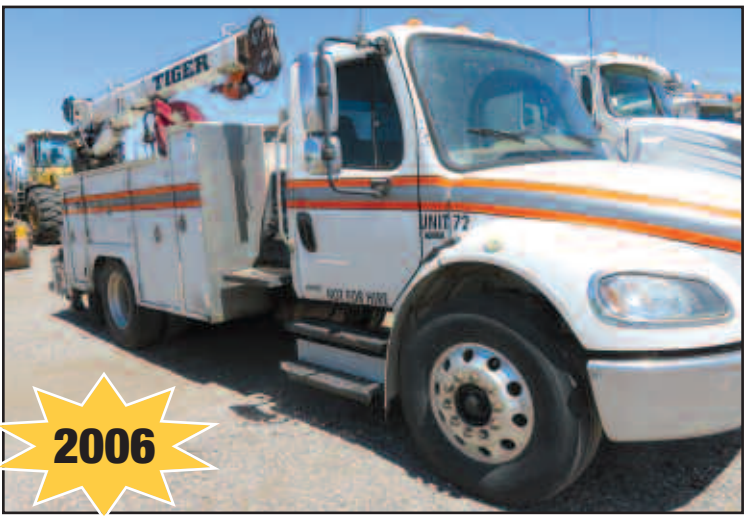
Freightliner M2 Business Class Service Truck