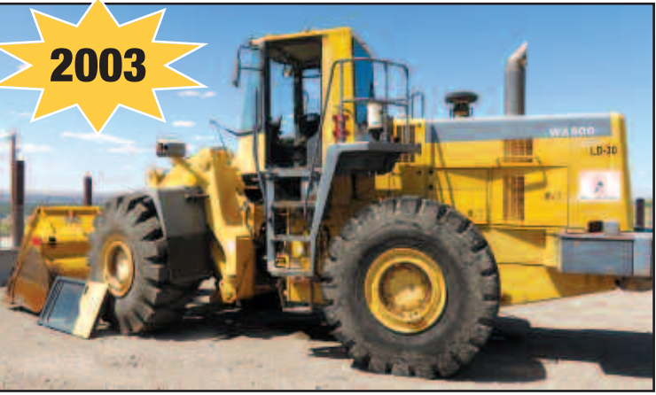
Komatsu WA500-3 Loader