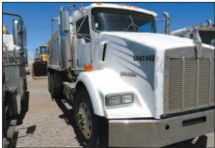
Kenworth T800 Dump Truck