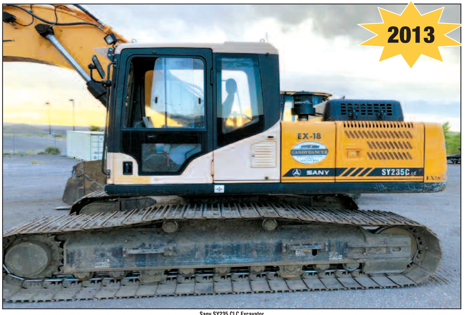
Sany SY235 CLC Excavator

2006 John Deere Mdl. 200CLC Excavator, Setup to Run Tie Inserter & Tamper, S/N CX506075