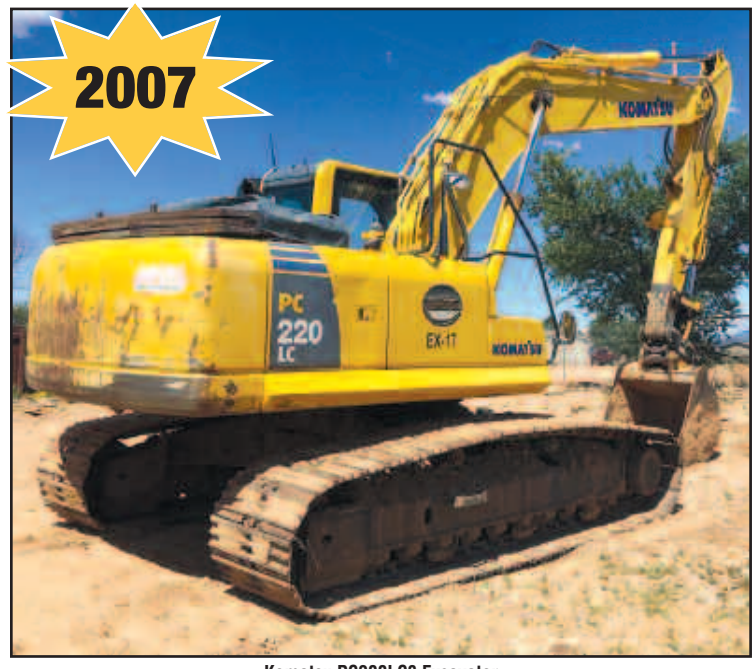
Komatsu PC200LC8 Excavator