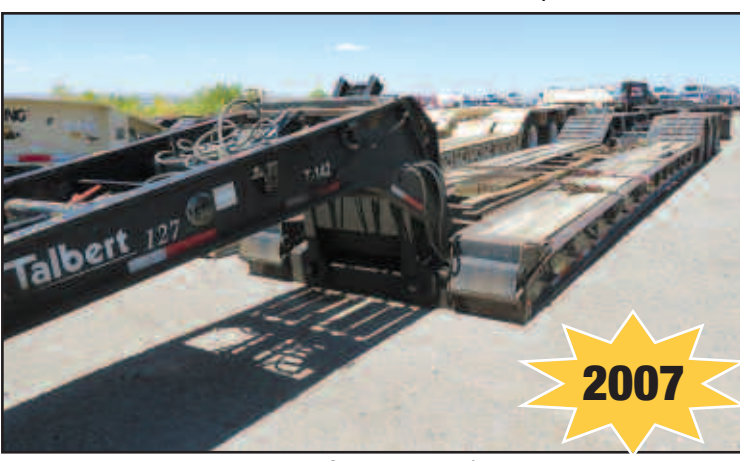
Talbert 55-Ton RGN Bed w/Anchor & Booster