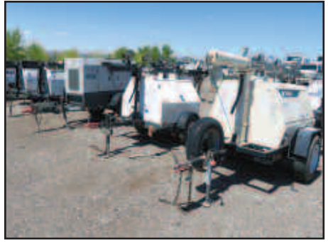
Light Plants & Generators