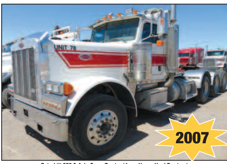
Peterbilt 379 3-Axle Conv. Tractor (4 are Heavy Haul Tractors)

(4) 2004 - 1999 Kenworth T800 Truck Tractors, 2-Axle Conv.