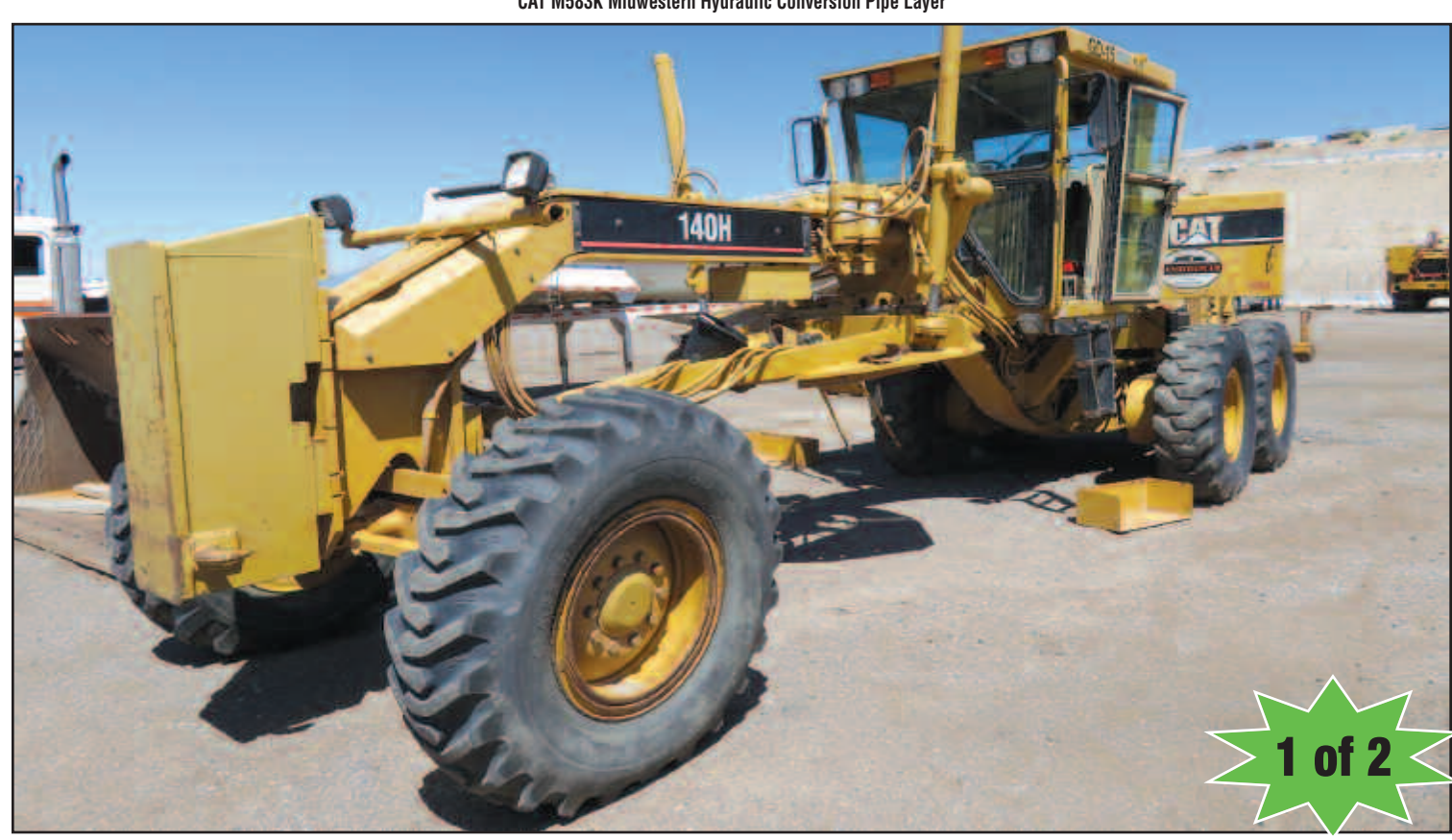
CAT 140H Grader, w/Rippers