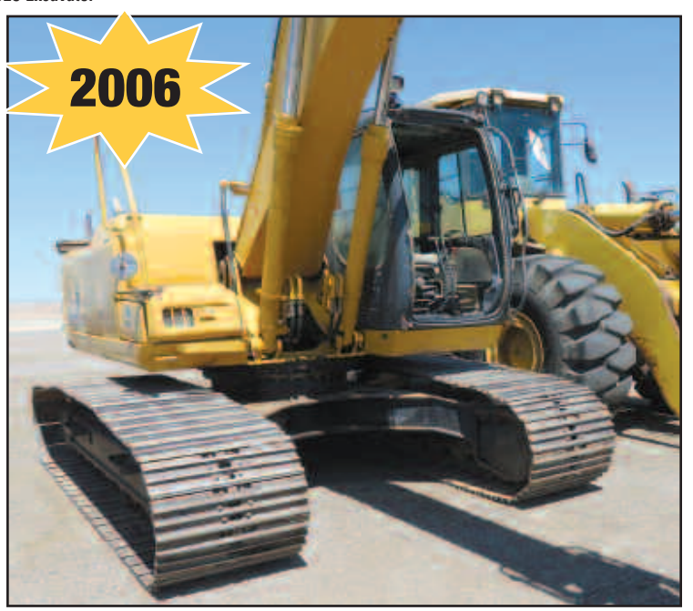
John Deere 200CLC Excavator