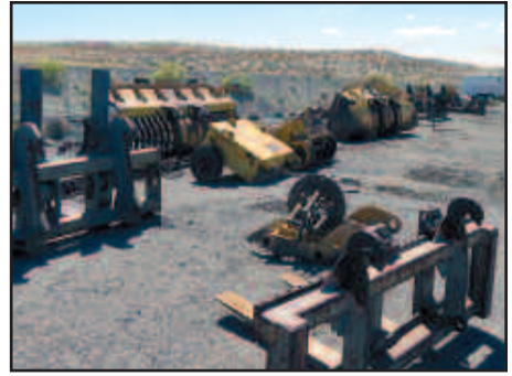
View of Buckets & Attachments