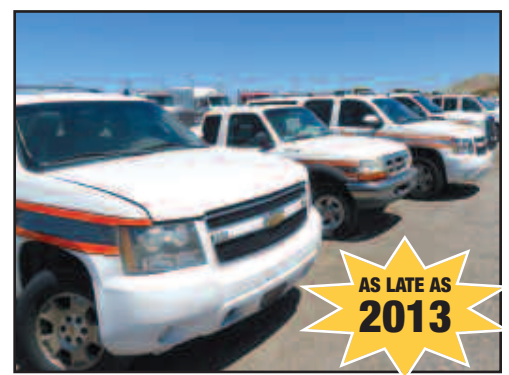
View of Pickups & Suburbans