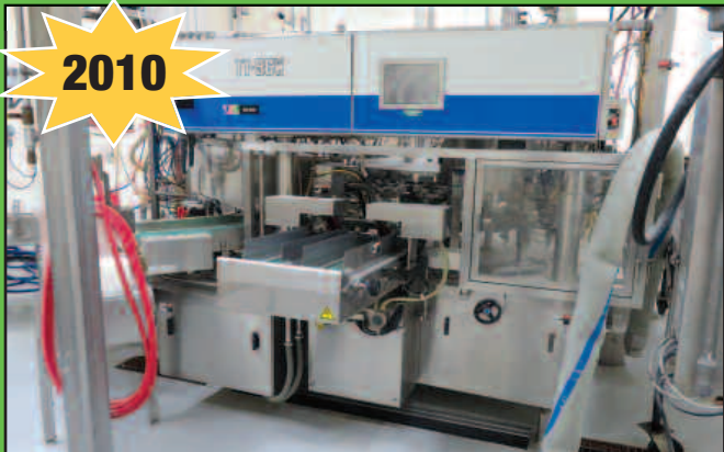
Toyoi Jidoki Mdl. TT-9CW Pouch Filler