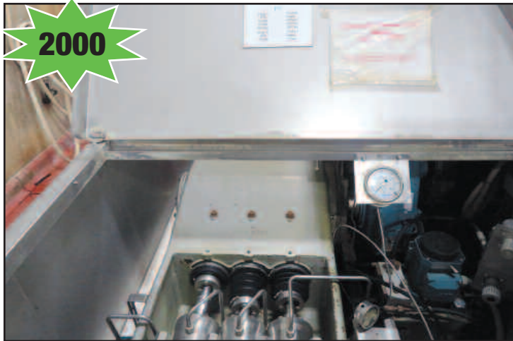
Tetra Pak Mdl. TAM25/200/BAR 2-Stage Homogenizer

APV-Gaulin Mod. 15MR-8TBA Lab Homogenizer