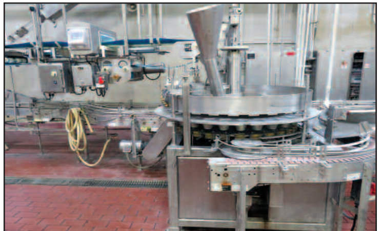
ERD 30-Station Pocket Filler