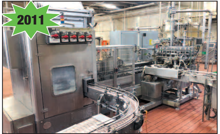
Zacmi 6-Head Steam Flow Seamer