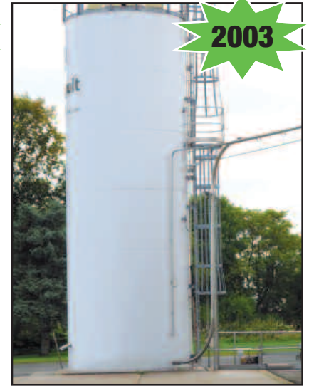
Columbian 2530 Cu. Ft. Flour Silo