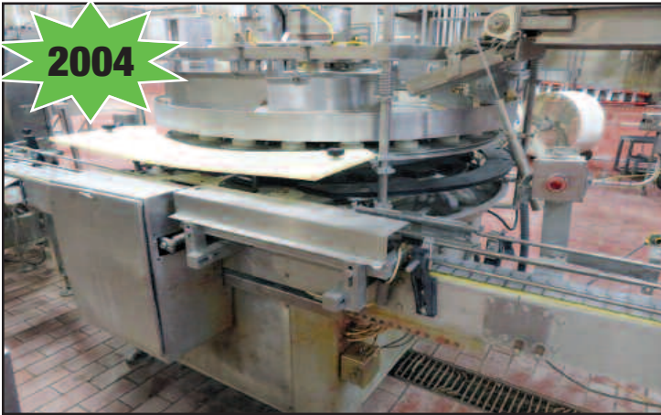
Zacmi 28-Station Volumetric Pocket Filler