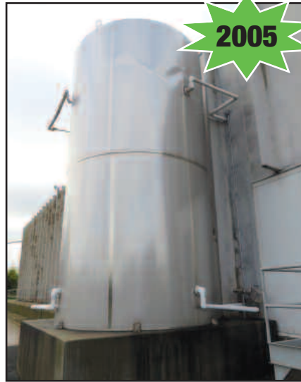
Feldmeier 10,000 Gal. S.S. Jacketed Silo