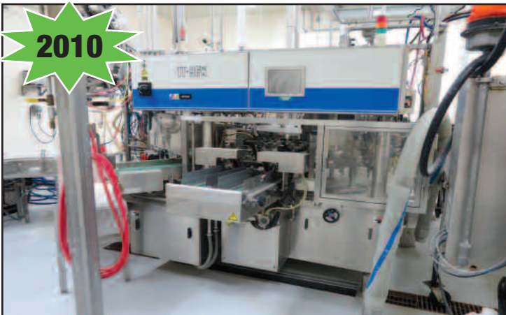
Toyo Jidoki Mdl. TT-9CW Pouch Filler