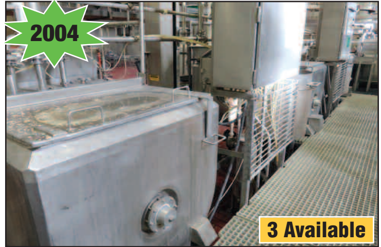
Viatec 475 Gal. Jacketed Horizontal Mixing Tanks