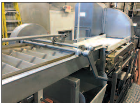
Olney Destoner, w/Key 2X-SS Air Cleaner