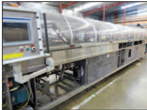
Breton Tray Packer