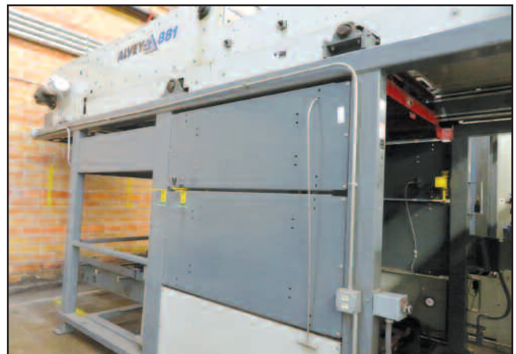
Alvey 881 Full Case Palletizer