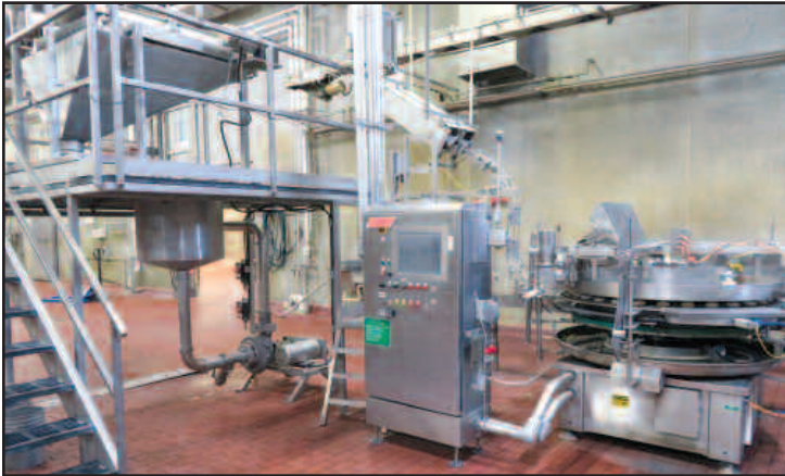
Zacmi 36-Station Volumetric Pocket Filler