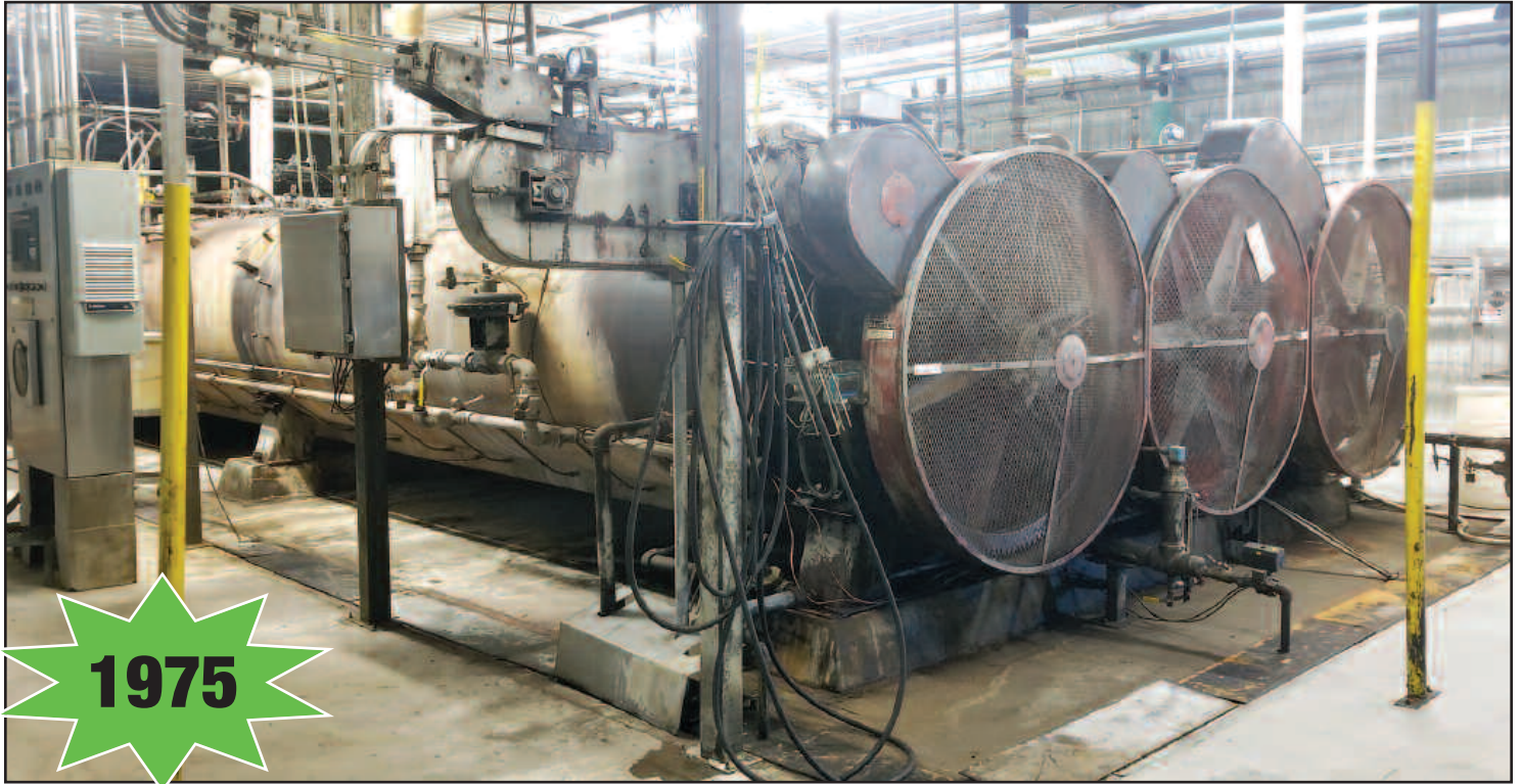
FMC 3-Shell Pressure Cooker-Cooler for 300 x 407 Cans

Stock Rotomat Mdl. 1100-4 Agitated Retorts