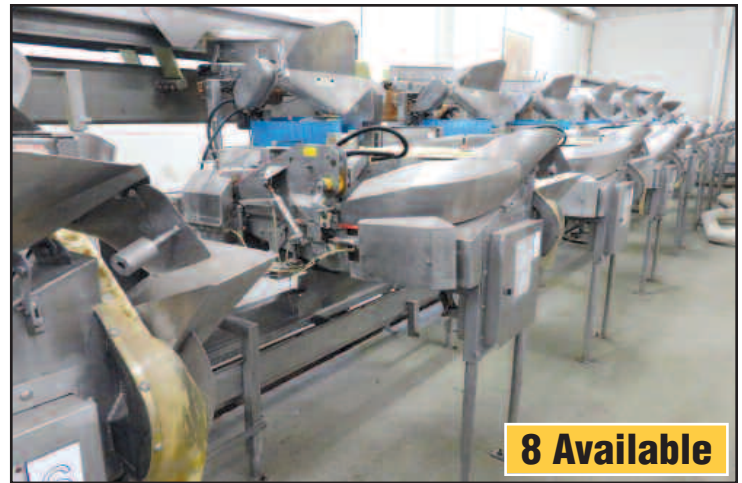
CCM Mdl. S08402-L Auto. Corn Cutters

(8) 1982 CCM Mdl. S08402-L, Auto. Corn Cutters