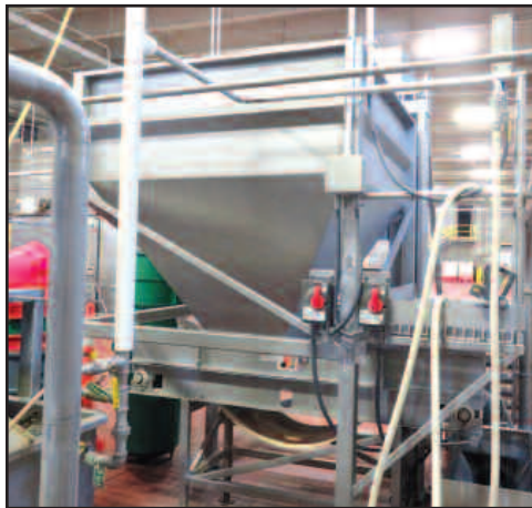
MTC Tote Dumper with Live Bottom Feeder