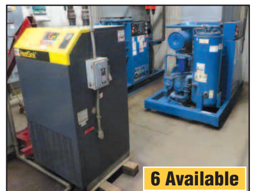
Quincy 30 & 25hp Rotary Screw Air Compressors