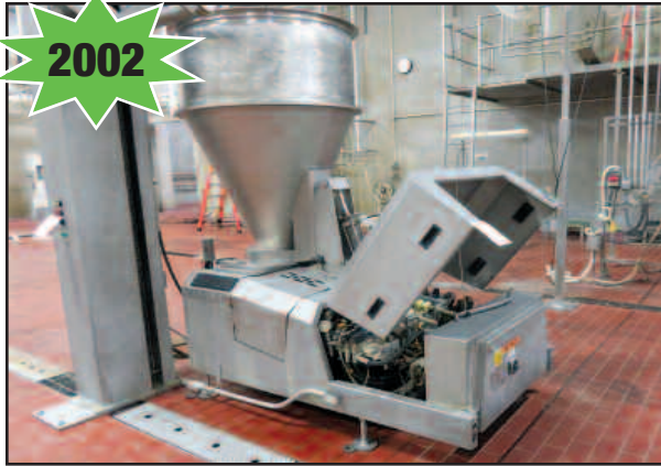
Marlen Mdl. OPT1140 Meat Extruder