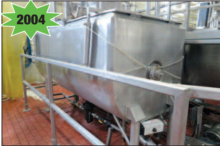
Viatec 675 Gal. Jacketed Horizontal Mixing Tank