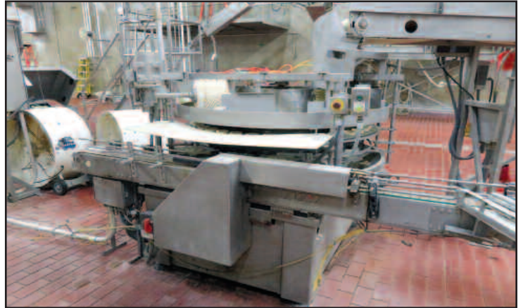
Zacmi 20-Station Volumetric Pocket Filler