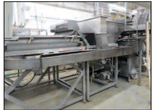
Femia 48" Flotation Washer