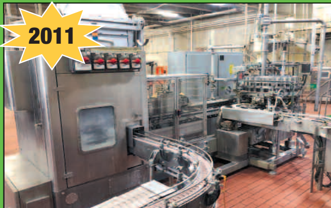
Zacmi 6-Head Steam Flow Seamer