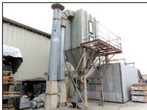
Dust Collection System