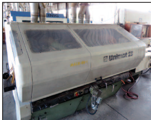
Weinig Unimat 23, 9" x 5" x 6-Head Planer/Moulder