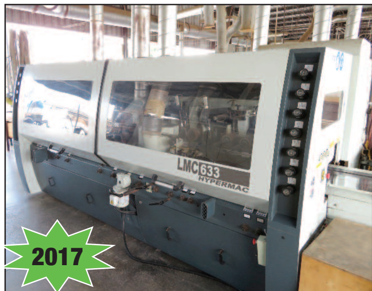
Leadermac LMC-633H, 13" x 6-Head HD Hypermacer Moulder

2006 Weinig Powermat 1000 , 15hp CNC Moulder, w/9" x 6 Powerlock Heads, 4,000-12,000 Var. Spd. RPM H.S. Inverter, S/N 106-585