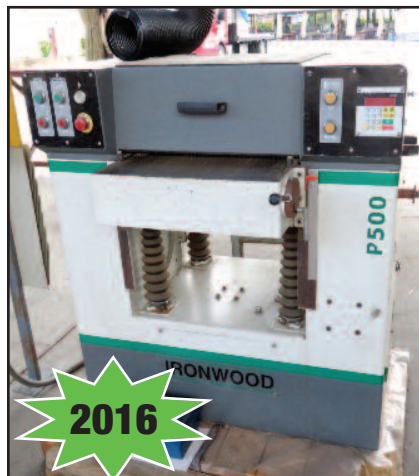
Ironwood Genesis P500, 20" Spiral Head Planer

Newman Mod. S-382-HD , 30" Top & Bottom Roughing Planer, Spiral Heads, Hydraulic Drive, S/N 14254