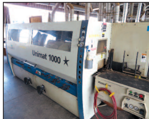
Weinig Unimat 1000, 9" x 7-Head Moulder