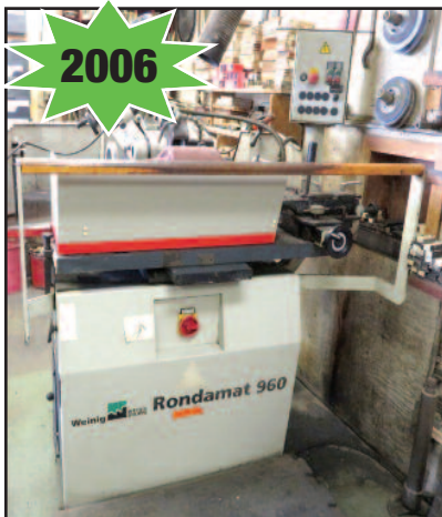
Weinig Rondamat 960 Profile Grinder