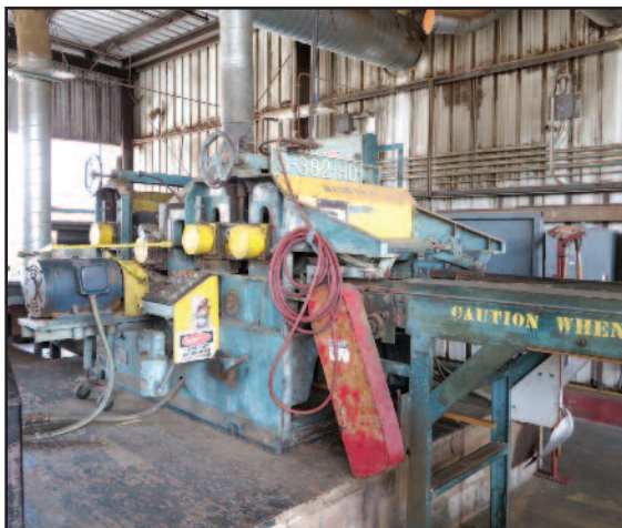
Whitney Mod. DS-802, 30 x 8, 30" Dbl. Head Surface Planer