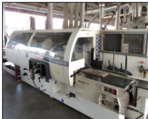
SCMI Superset 23 Plus, 9" x 5-Head Moulder