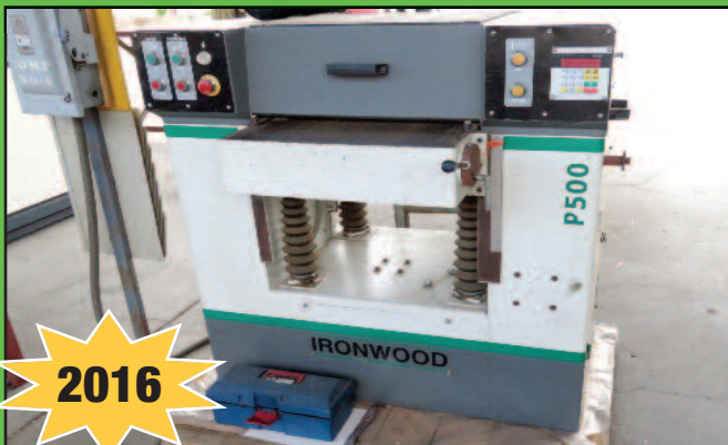
Ironwood Genesis Mod. P500, 20" Single Sided Spiral Head Planer