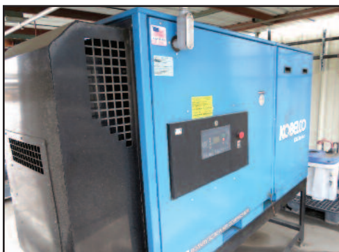
Kobelco Mod. KA50E, 50hp Rotary Screw Air Compressor