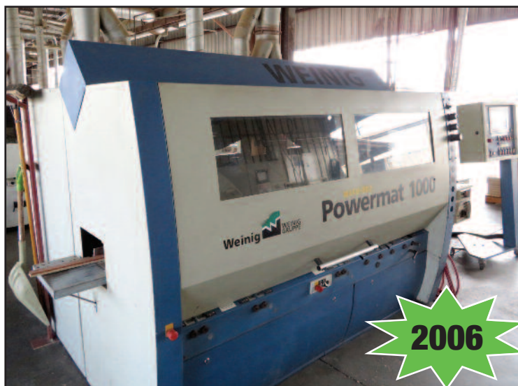
Weinig Powermat 1000, 15hp CNC Moulder

Weinig Unimat 1000 , 9" x 7-Head Moulder, with Universal, S/N 99-317 Large Quantity Moulder Heads