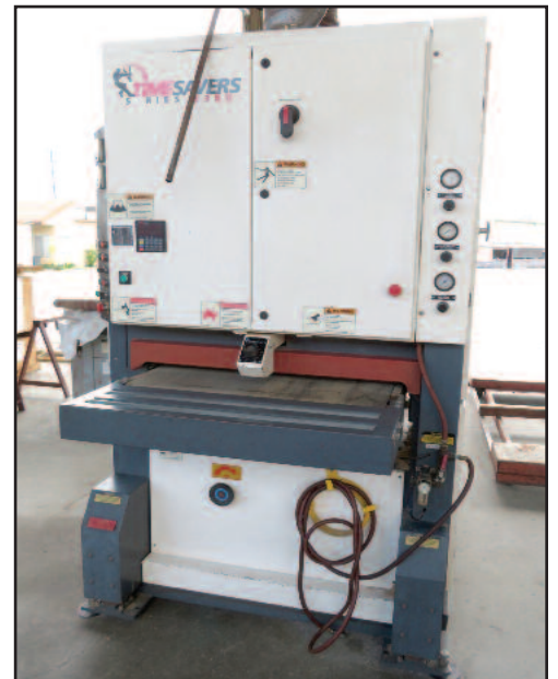
Timesavers Series 2300, 37" Dbl. Drum Wide Belt Sander

ONLINE BIDDING AVAILABLE AT: www.bidspotter.com www.industrialbid.com