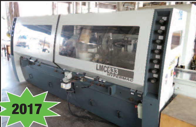
Leadermac LMC-633H, 13" x 6-Head HD Hypermac Moulder

CLOSING OPERATIONS • Building Sold • Must Vacate Premises