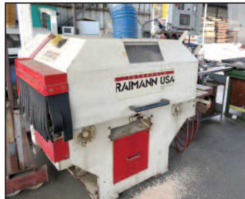
Raimann KM310BV, 12" Gang Rip Saw

2005 Baker BBR-0 , 30 HP Band Resaw, S/N 05-3494