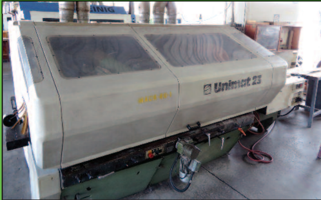
Weinig Unimat 23, 9" x 5" x 6-Head Planer/Moulder