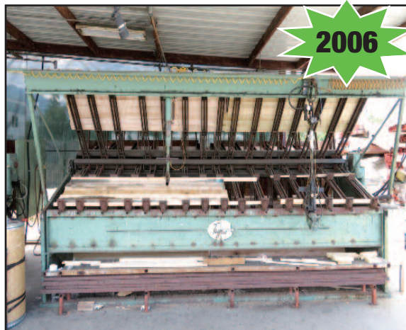
Taylor Mod. CM, 16' Hydro Clamp Carrier