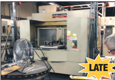
Okuma & Howa Millac 50M CNC Horizontal Machining Center