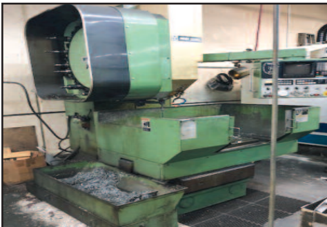
Mori Seiki MV Junior CNC Vertical Machining Center

LOCATION: 6960 Hermosa Circle, Buena Park, CA • INSPECTION: Mon., June 5th, 9am to 4pm & Morning of the Sale