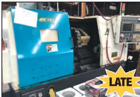
Takisawa EX-110 CNC Turning Center