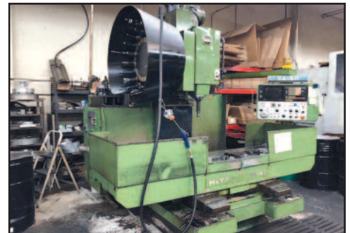
Hitachi Seiki VA-50 CNC Vertical Machining Center