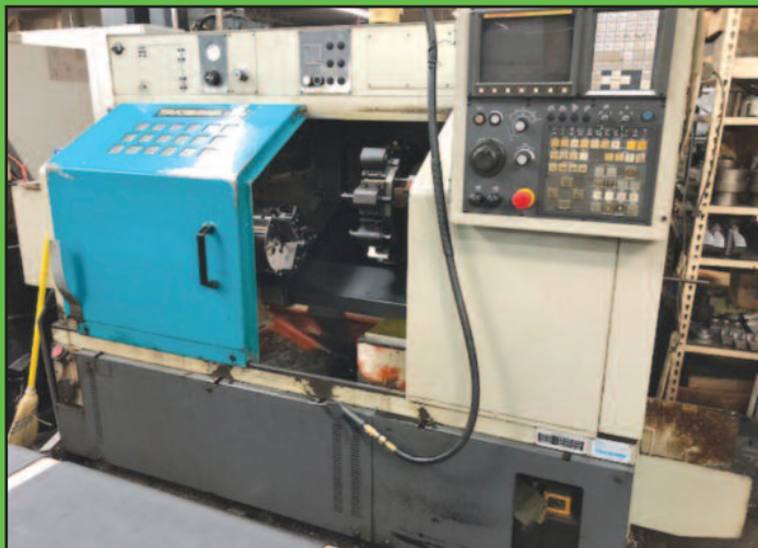
Takisawa TW-30 CNC Turning Center