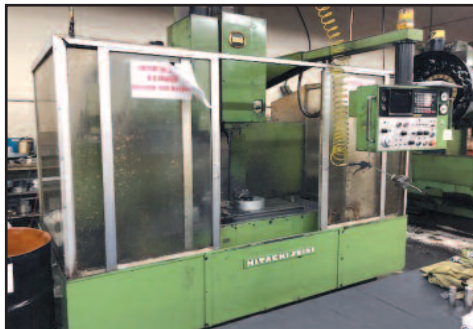
Hitachi Seiki VA-45 CNC Vertical Machining Center