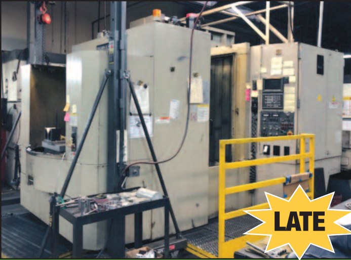
Okuma & Howa Millac 50M CNC Horizontal Machining Center

TAUBER-ARONS, INC. Industrial Auctioneers & Liquidators since 1892