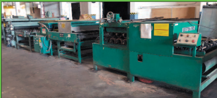
Besten Glass Wash Line