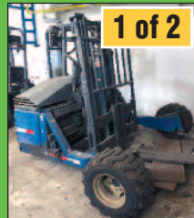
Piggy Back 5k Cap. Lb. Forklift

TAUBER-ARONS, INC. Industrial Auctioneers & Liquidators since 1892