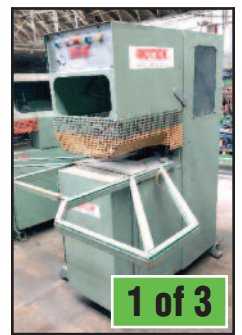
Rotex Sash Corner Cleaner