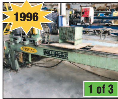
Hollinger Winmac Twin Point Welder