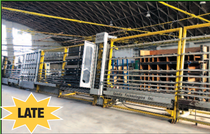
Spadix Quad Seal/Roller Press

BIDS START CLOSING: Feb. 13th & 14th at 10:00am PST Each Day