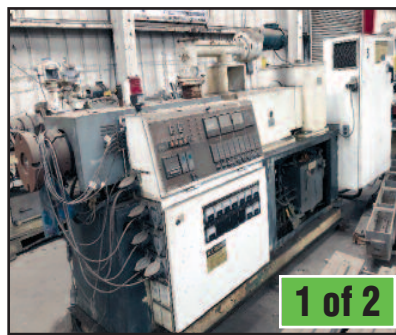
Cincinnati Milacron Extruder