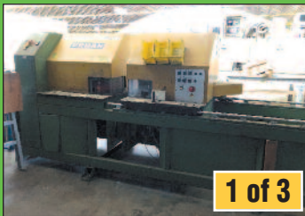
Urban Frame Corner Cleaner