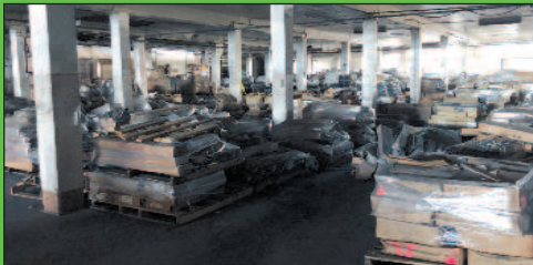
Partial View of Finished Goods & Parts Inventory