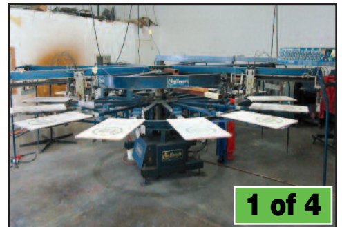
M&R Challenger Screen Printer