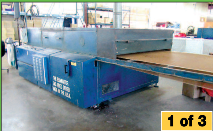
M&R Oven Dryer

INSPECTION: Mon. & Tue., July 23rd & 24th, 9:00am to 4:00pm & Morning of the Sale