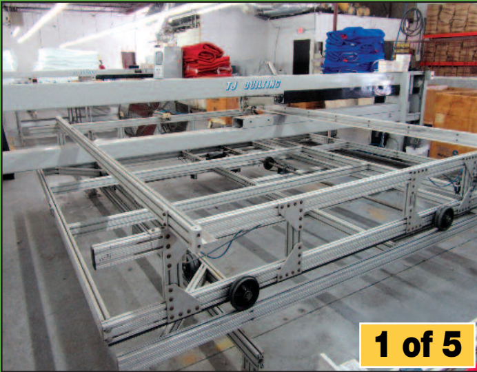
TJ Quilting Machine