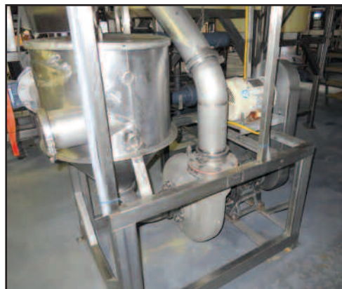
Cornell Water Knife Pump