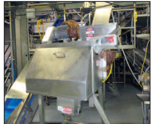
Urschel RA Slicer