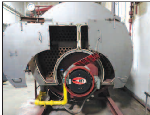
Johnston 300hp Boiler