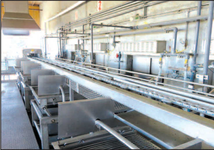
Outside Strawberry Receiving w/(4) 30" x 10' Shakers

Femco 20-Ton Rotary Coil Hot Break Tank, 6' x 4' x 5' High Cherry Burrell 6" Dia. Votator Dual Swept Surface Heat Exchanger Mueller Plate & Frame Heat Exchanger