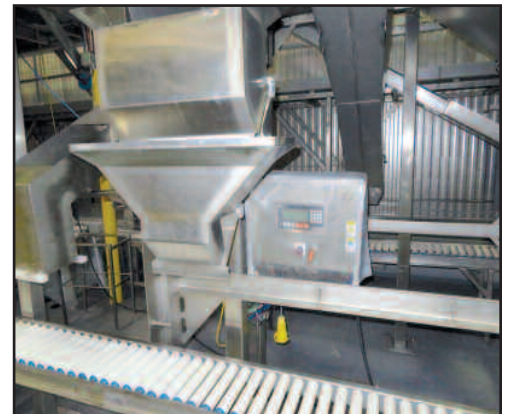
Bulk Net Weight Filler