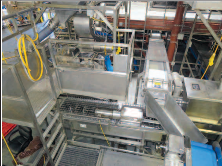
Strawberry Slicing and Processing Line