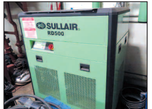
Sullair RD500 Rotary Screw Air Compressor