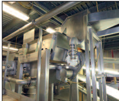
Stal Water Knife System