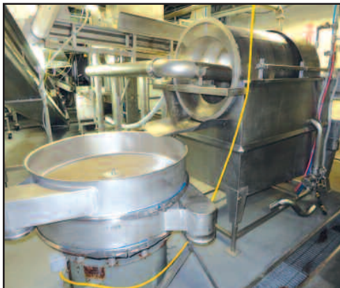
Sweco Screen w/Reclaim Reel