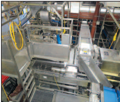
Strawberry Slicing and Processing Line