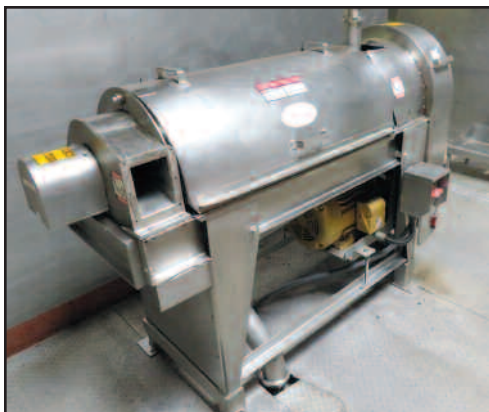
Brown 202 Pulper