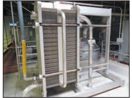
Mueller plate & Frame Heat Exchanger