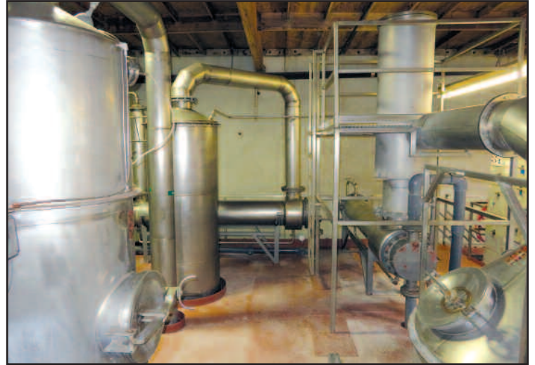
Femco Two-Stage Evaporator w/Essence Recovery