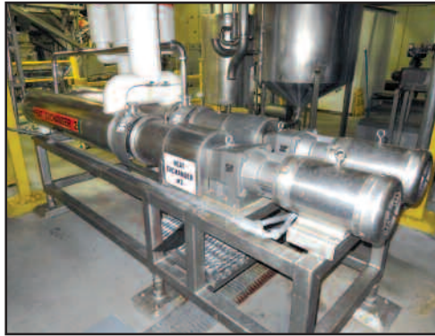
Cherry Burrell Votator Dual Sweep Heat Exchanger