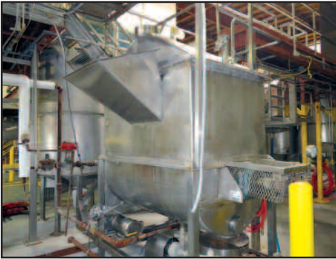
Femco 20-Ton Rotary Coil Hot Break Tank