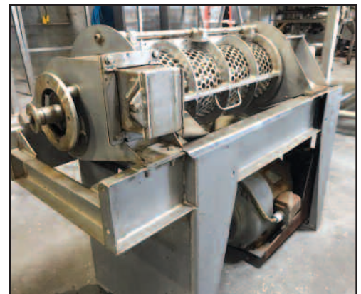
Brown 4000 Pulper