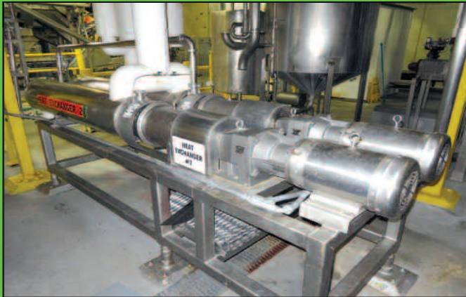
Cherry Burrell Votator Dual Sweep Heat Exchanger

TAUBER-ARONS, INC. Industrial Auctioneers & Liquidators since 1892