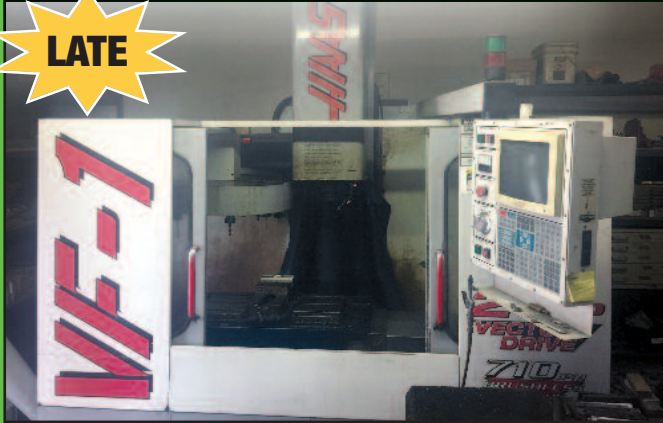
Haas VF-1 4-Axis CNC Vertical Machine Center