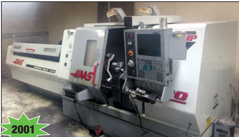
Haas SL20 CNC Turning Center w/Servo Bar

1997 Haas Mod. HL-4, CNC Turning Center, w/Haas Controls, 10" 3-Jaw Chuck, 19" 12-Pos. Turret, Tailstock, Chip Conveyor, S/N 61093