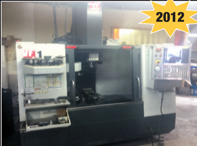
Haas VF-1 4-Axis CNC Vertical Machine Center