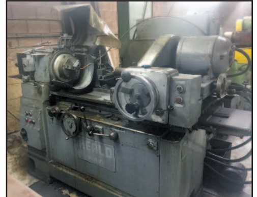
Heald Mod. 271, ID Grinder w/3-Jaw Chuck