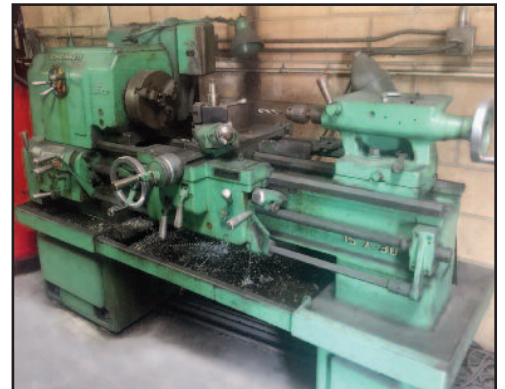
Cincinnati 15" x 30" Engine Lathe w/3-Jaw Chuck