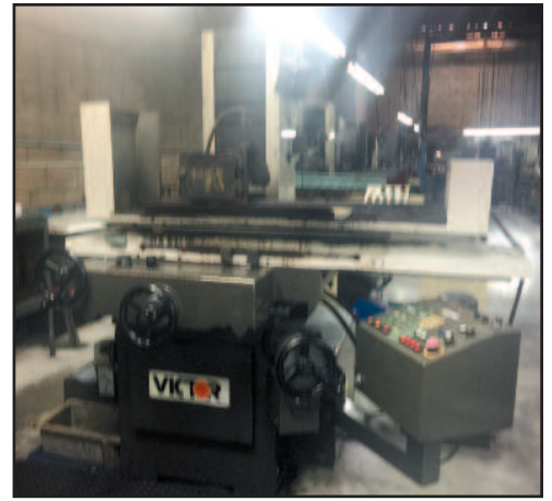
Victor 1020AH Auto Hydraulic Surface Grinder