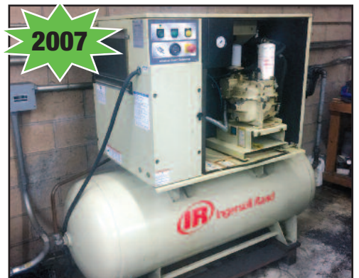
Ingersoll Rand 15 HP Rotary Screw Air Compressor