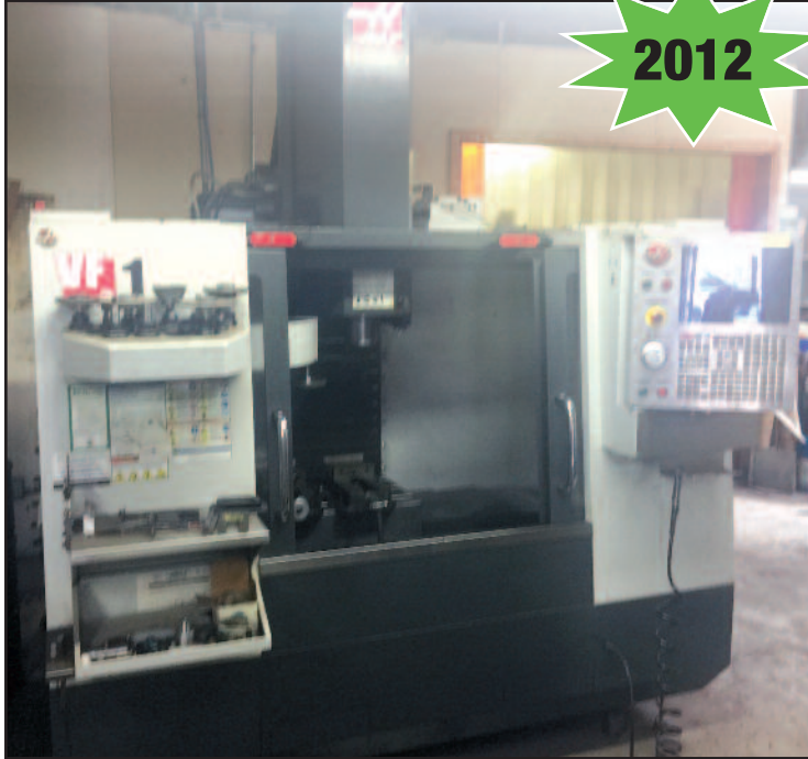
Haas VF-1 4-Axis CNC Vertical Machine Center