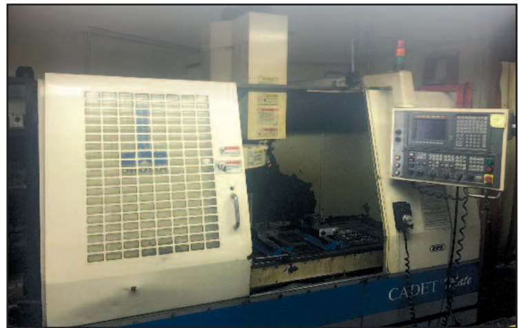
Okuma Cadet Mate Vertical CNC Machine Center