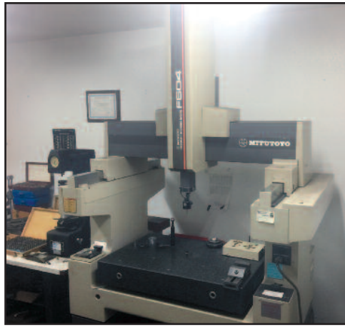
Mitutoyo F-604 CMM w/Probe

Hansvedt Wire EDM, w/ Pulse 201 Power Source, Anilam DROs; Cincinnati 15" x 30" Engine Lathe, w/3-Jaw Chuck, KDKs; Bridgeport 1 HP Vertical Mill, S/N 163455; Sunnen Mod. MBC-1802, Prec. Horiz. Hone, S/N 82630; Hardinge Mod. DSM59, 2nd Oper. Lathe; 2007 IR Mod. UP6-15C-125, 15 HP Tank Mounted Rotary Screw Air Compressor; Quincy Mod. F-390, 15 HP Tank Mounted Air Compressor; Magnolia 10 HP Tank Mounted Air Compressor; Husky 5 HP Vert. Air Compressor; Do-All Mod. 1612-0, 16" Vert. Band Saw, w/ Butt Welder, S/N 277-721152; Wellsaw Mod. 1000, Horiz. Band Saw, S/N 5341; 10' x 15' x 8' Burn Off Oven; Blue M Oven; 1993 KBC Mod. 9648, 6" Combo Disc/Belt Sander; CI Mod. 3 Arbor Press; Pit Bull Mod. WA-14M, 14" Vert. Band Saw; Pittsburg 20 Ton "H" Frame Press; Komatsu Approx. 3000 Lb. LPG Forklift; Central Machinery 8-Ton Engine Hoist; Transpower Ped. Drill Press; Landa Pressure Washer; Binks 10' x 10' x 8' Spray Booth; Strapping Units; Misc. Carbide Tooling; 15' Flat Bed Trailer; Kurt Mill Vises; Bar Stock; Vise & Benches; Bench Drill Press; Misc. Setup Racks; Dbl. End Grinders; Custom Cold Saw; Miscellaneous Collets, Tooling.; Miscellaneous Office Furniture