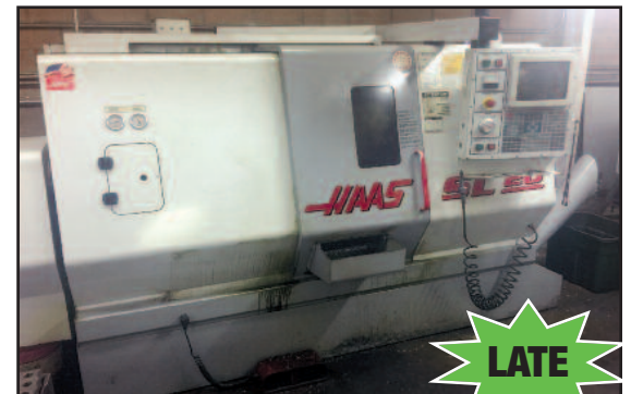
Haas SL20T CNC Turning Center