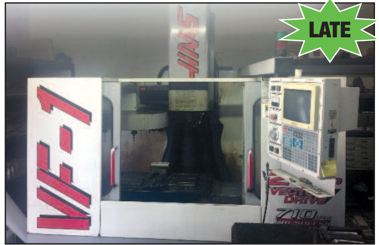
Haas VF-1 4-Axis CNC Vertical Machine Center