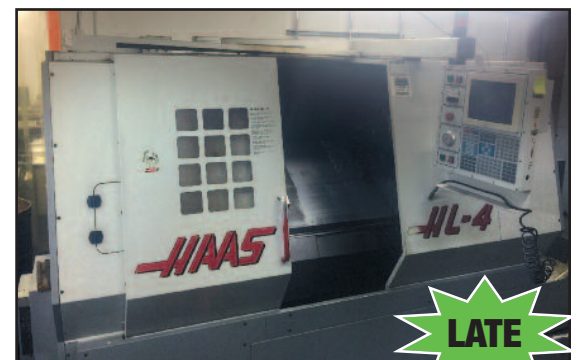
Haas HL-4 CNC Turning Center