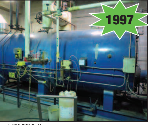
Hurst 150 PSI Boiler