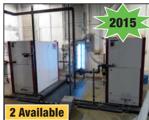
Gardner Denver 37KW Compressors