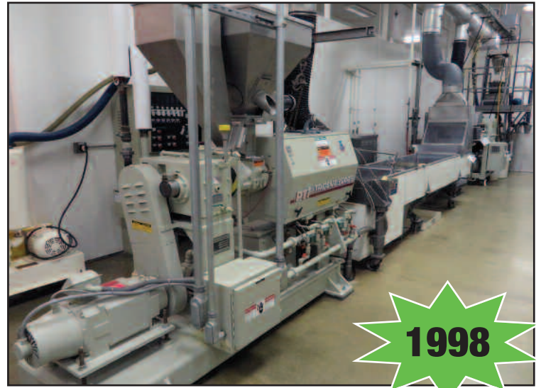
PTI 2" Pelletizing Line

Prodex Mod. 0200-24, 2" – 15hp – 24:1 Pelletizing Line, Water Bath, Berlyn 2-Head Dryer, Cumberland Pelletizer, Syntron Vibratory w/Screen, S/N 74-339