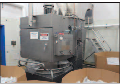
Fitzmill 150 Fluid Bed Dryer

Aeromatic Mod. S4 Fluid Bed Dryer, S/N 879074/A Fitzmill Mod. 150 Fluid Bed Dryer, S/N 190