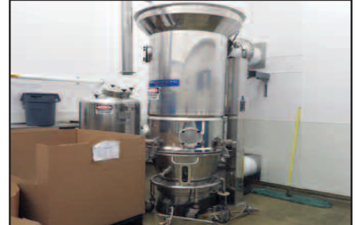
Aeromatic S4 Fluid Bed Dryer