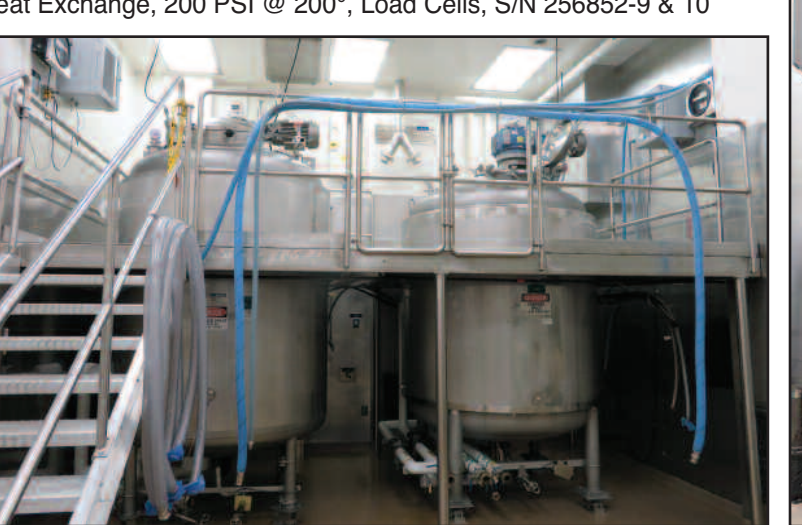
Mueller 4000L and 3000L Jacketed Mixing Tanks

Hermann 200 Gal. Portable S.S. Tank; Waldner 800L Port. S.S. Tank; (3) Portable S.S. Tanks, 400L, 300L, 100L; (3) Yula Shell & Tube Heat Exchangers; 2' x 2' Port. Mixer