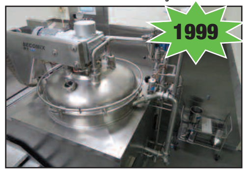
BecoMix 1,000L Vacuum Turbo Mixer