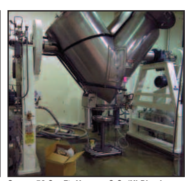
Patterson Kelly 60 Cu. Ft. Vacuum S.S. Blender Gemco 50 Cu. Ft. Vacuum S.S. 'V' Blender