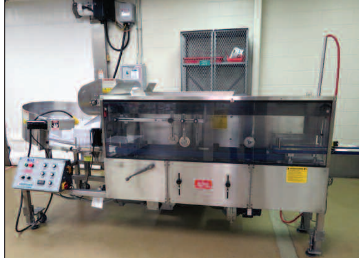
Kaps All AU-6C Bottle Unscrambler

Scheneck Super Sack, Weigh Scale, Feeder w/Hardy Controls (10) VideoJet Coders