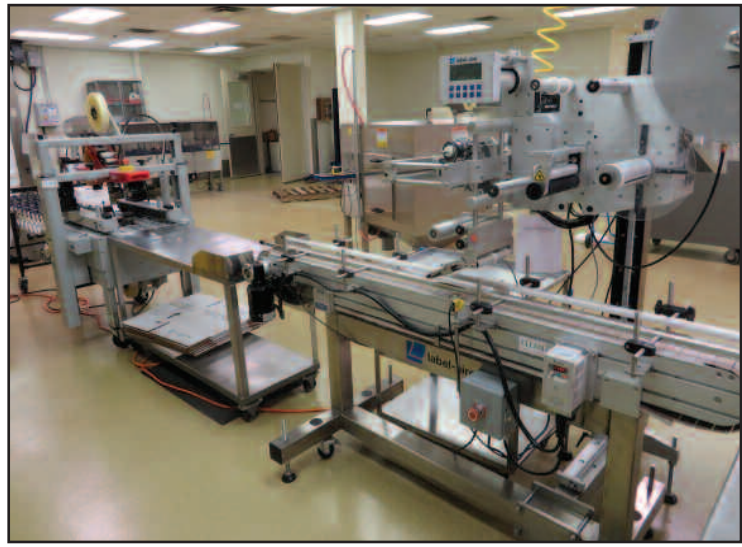
Labelaire Labeling Line