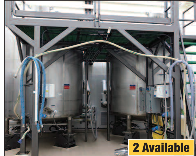
Mueller 12,000L S.S. Jacketed Formulation Tanks