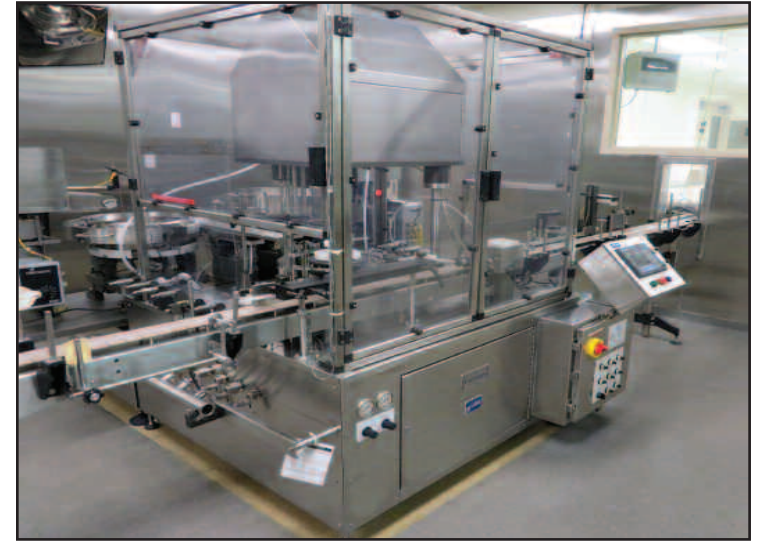
Chase Logeman MonoBloc Filler

Labelaire HS200 Labeler, Conveyor & 3M Case Closer RL Craig Labeler w/Lazy Susan & 3M Case Closer