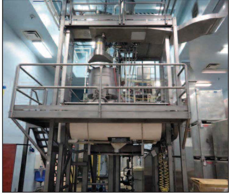
Henderon-Prodex Henschel Blender

Henderson-Prodex Mod. 115/SS, 100hp – 11.5 C.F. – 1750 RPM Henschel Mixer, (3) Weigh Scale Hoppers, 3' x 8' S.S. Ribbon Blender, (2) 80,000 Silos and Vacuum Loaders, (36) 4'x4' Aluminum Totes, S/N 74-322