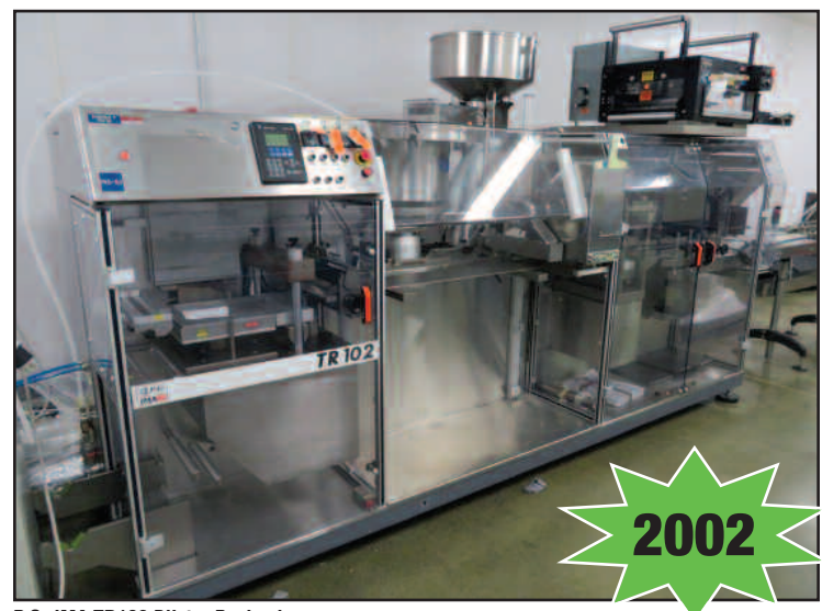
P.G. IMA TR102 Blister Packaging