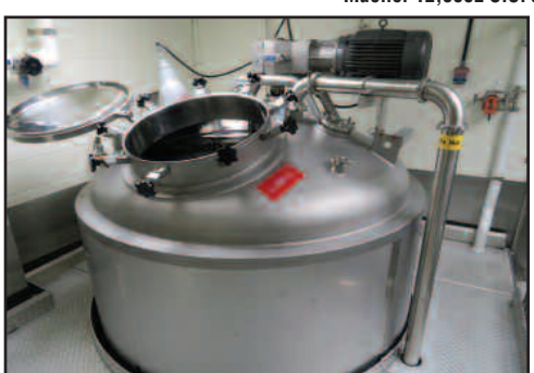
4,000L S.S. Jacketed Mixing Tank