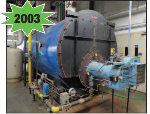
Hurst 16MM BTU Boiler