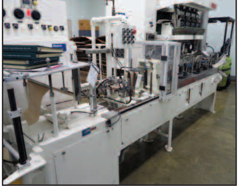
Bartelt Powder Pouch Filler