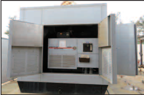
Spectrum Detroit Diesel 1115 KW Diesel Standby Generator

Magliner Mod. MA168438, 16,000lb. Aluminum Dock Ramp, S/N MW33201