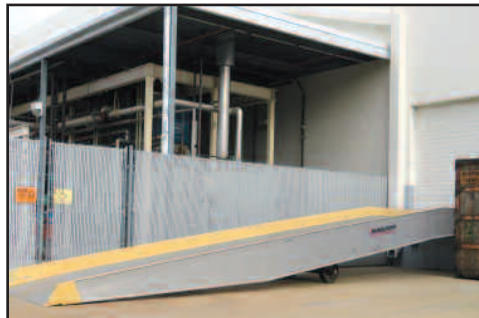
Magliner Alum. Port. Dock Ramp

Miscellaneous Office Furniture and Cubicles, Lobby & Lunch Room