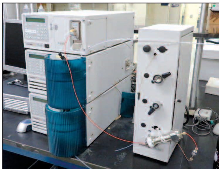
Varian Pro Star Chromatograph System