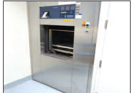
Getinge Steam Washer Dryer