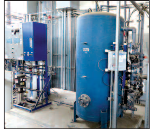
U.S. Filter D.I. Water Unit