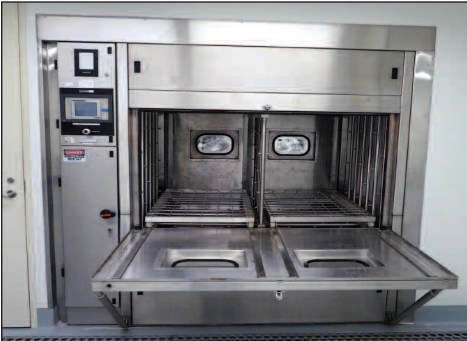
Getinge Vivarium Autoclaves