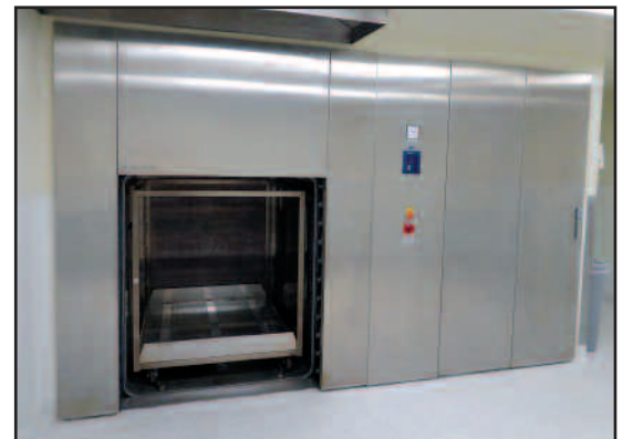
Getinge Drive-In Autoclave