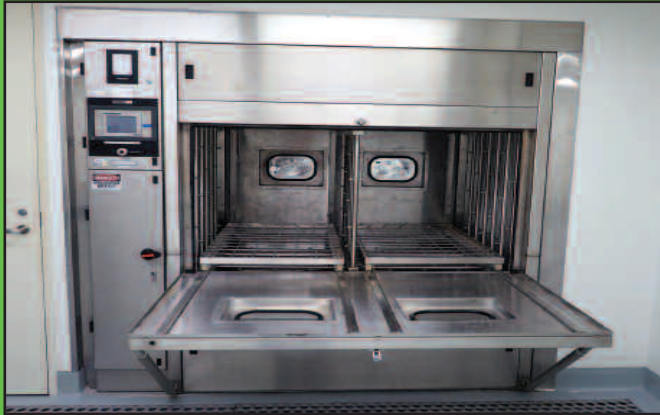
Getinge Vivarium Autoclaves

Wednesday, March 22nd at 10:30am PDT 28903 Avenue Paine, Valencia, CA