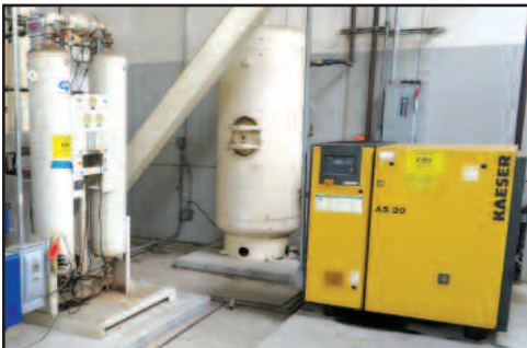
Kaesar & Quincy Air Compressors