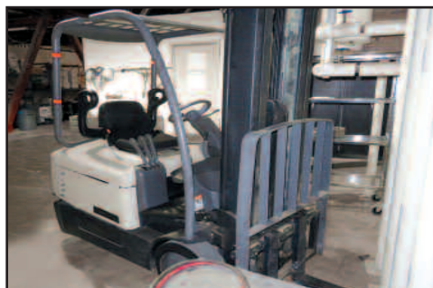
Crown 3000 Lb. Capacity Electric Forklift