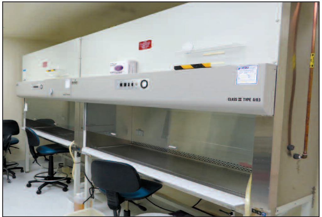
Thermo Bio Safety Cabinets

Justrite Flammable Storage Cabinet Beckman Coulter Microplate Carousel Beckman Coulter 6R Centrifuge Isotemp 20T, Bath Supply Cabinets w/Glass Doors (2) Eppendorf 5415, Centrifuges (3) VWR Wash MJ PTC100, Prog. Thermal Controller Gemini Twin Shaking Water Bath (2) Savant Speed Vac Centrifuges Lab Line Orbit Environ-Shaker (6) Steel Supply Cabinets (1) Hanson Fume Hood (2) Titer Plate Shakers Branson 8510, Ultrasonic Cleaner Port. S.S. Cart; Steam Generator Harris Refrigerator (10) Freezers Fisher Scientific Lab. Ref (3) Beckman Coulter 25R, Centrifuge