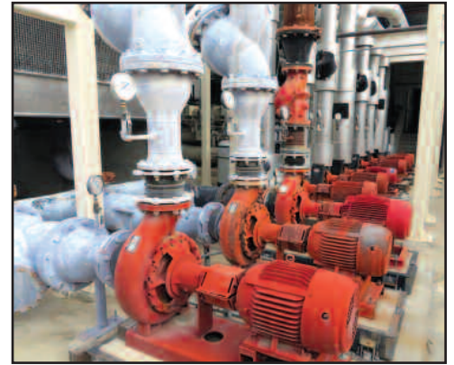
Armstrong Recirculation Systems