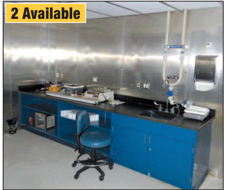
Smith Modular Clean Rooms

(20) Lab Benches: 6' x 24' with Sink, Gas Lines, Electrical Outlets, Chairs