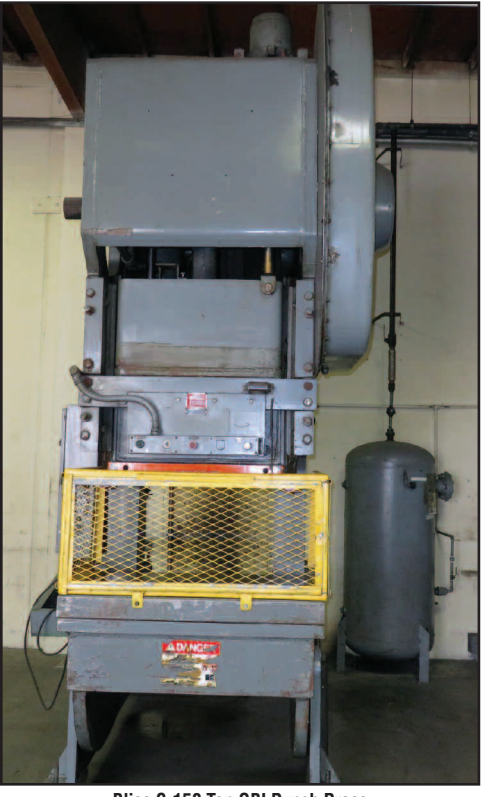
Bliss C-150 Ton OBI Punch Press