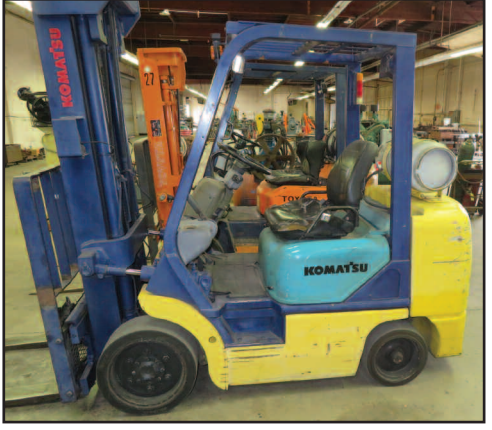
Komatsu FG25, 4000 Lb. Forklift

Hyster 70, 7,000lb LPG Forklift Toyota Mod. 5KG025, 5,000lb LPG Forklift (9) Clark 4,000lb & 5,000lb Forklifts