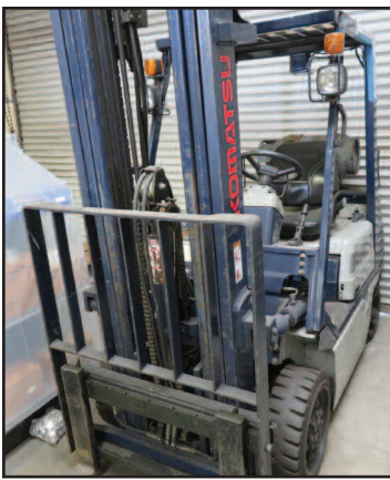
Komatsu FG30, 5000 Lb. Forklift