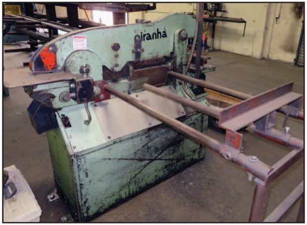
Piranha P-3 Iron Worker

Piranha Mod. P-3, Iron Worker. S/N P3-230 Mubea Mod. HP250 Iron Worker. S/N 015408803571290