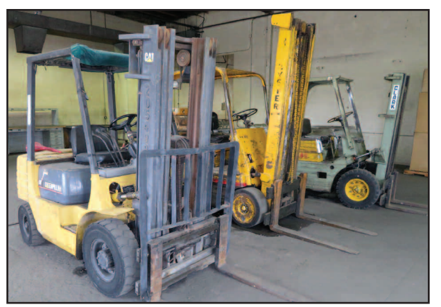
View of Forklifts

Komatsu No. FG30, 4,000lb. LPG Forklift Komatsu No FG25SG II, 5,000lb LPG Forklift. S/N 4930594 CAT DP85, 5,000lb LPG Forklift