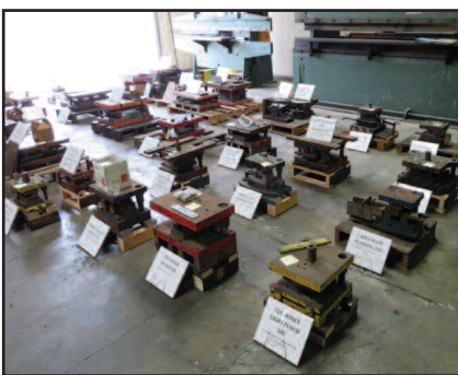
Product Line Dies