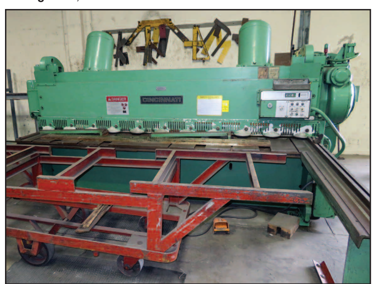
Cincinnati Mod. 2CC10, 10' x 1/4" Shear

Cincinnati Mod. 2CC10, 10' x 1/4" Shear, F.O.P.B.G.s; S/N 42455 Cincinnati 12' x 90-Ton Press Brake, 14' Overall, Pit Type. S/N 20991 Chicago 56A, 10' x 40-Ton Press Brake. S/N 18480