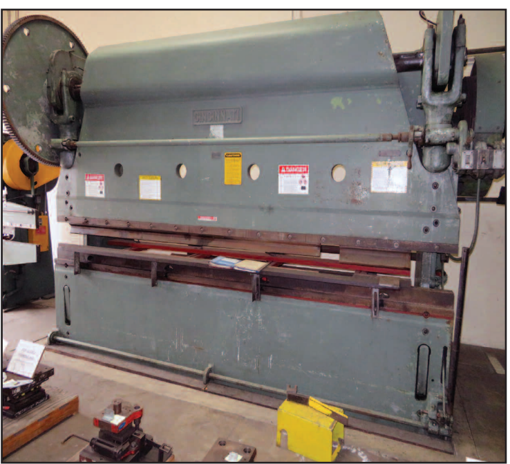
Cincinnati 12' x 90 Ton Press Brake

For more Information, visit our website: www.tauberaronsinc.com