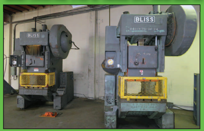
(2) Bliss 75 Ton OBI Punch Presses

BIDDING BEGINS CLOSING: July 28th at 10:30am PDT ASSET LOCATION: 3100 W. Central Ave., Santa Ana., CA