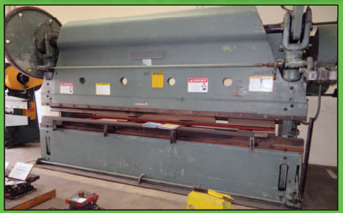
Cincinnati 12' x 90 Ton Press Brake

BIDDING BEGINS CLOSING: July 28th at 10:30am PDT ASSET LOCATION: 3100 W. Central Ave, Santa Ana, CA